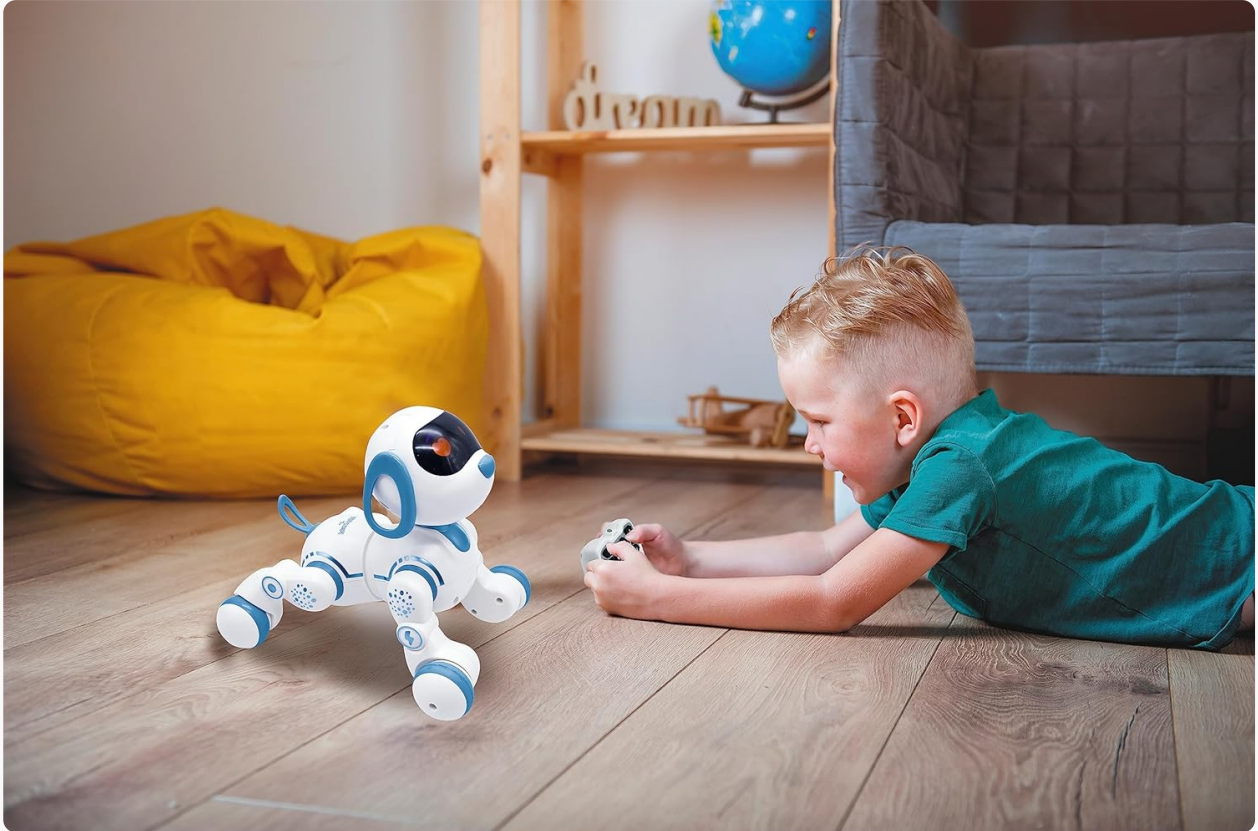
Image: A young boy lying on the floor, actively engaging with the Power Puppy® Jr using its remote control.