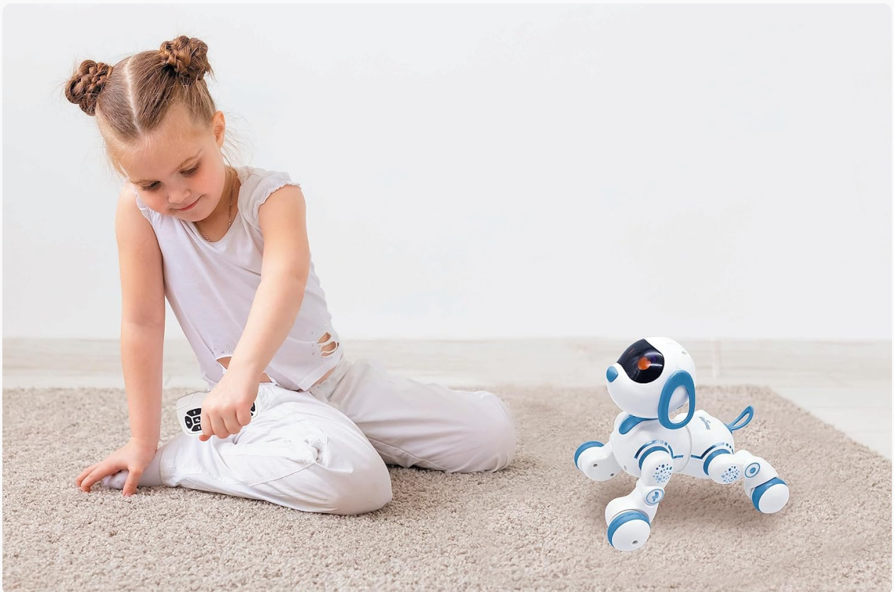
Image: A young girl sitting on a rug, operating the Power Puppy® Jr with its remote control.