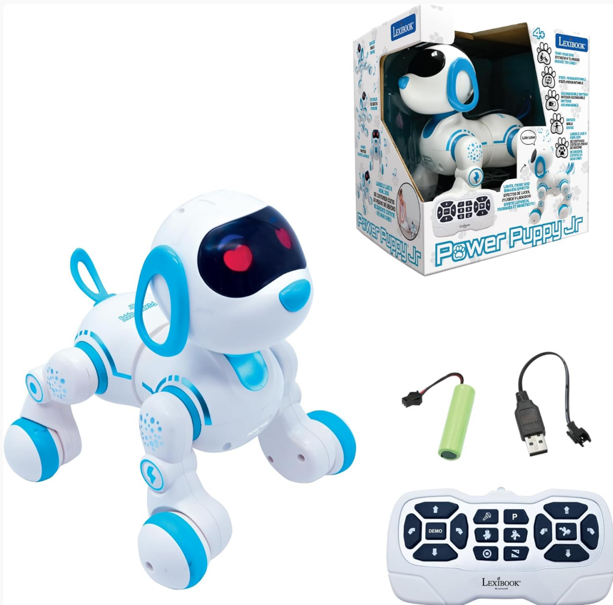
Image: The Lexibook Power Puppy® Jr robot dog and its remote control, ready for play.