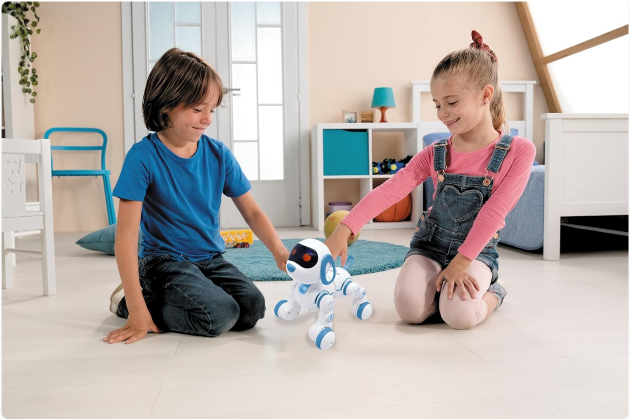
Image: Two children, a boy and a girl, kneeling on the floor and interacting with the Power Puppy® Jr.