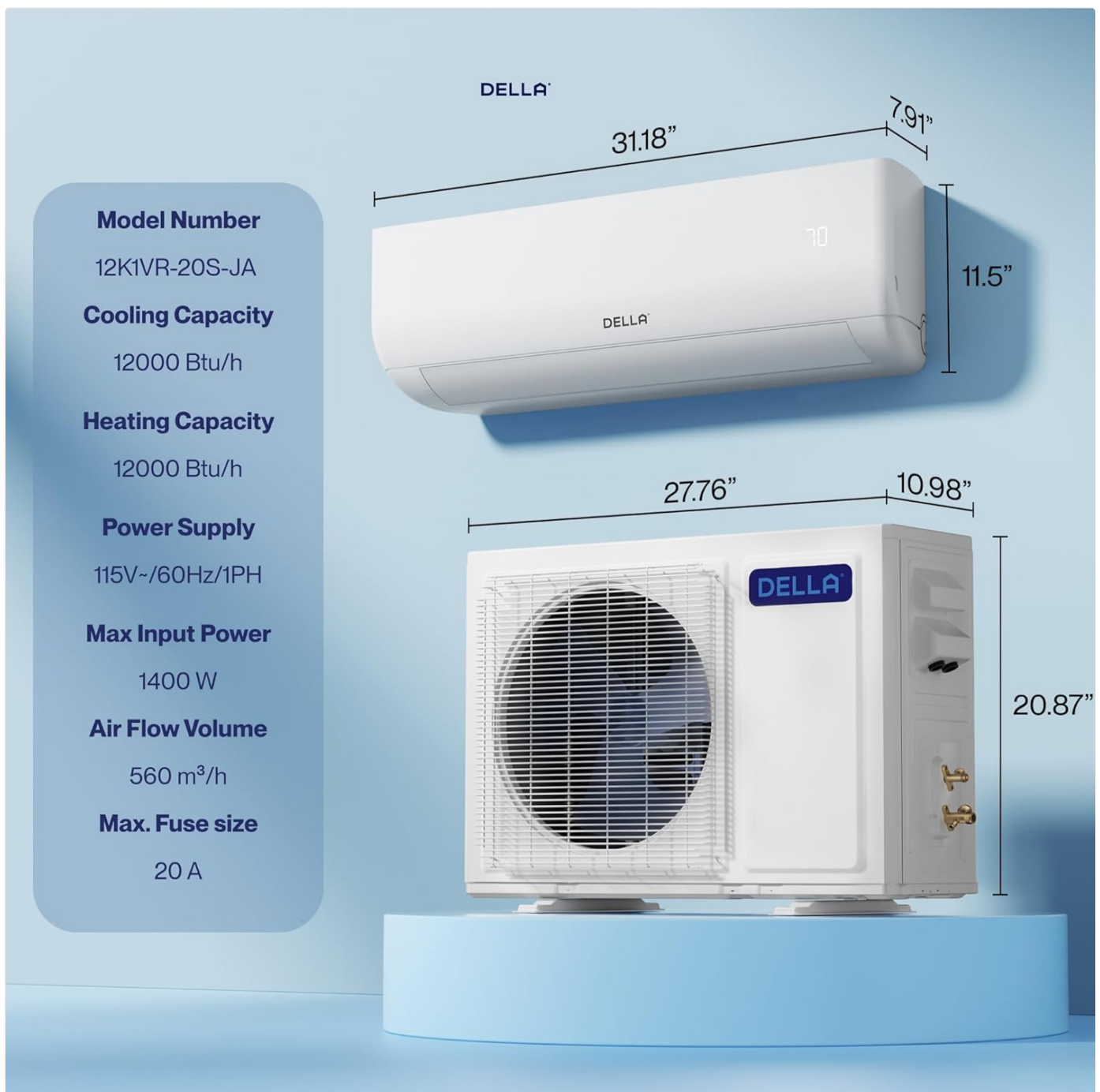
Figure 4.1: Detailed dimensions and key specifications for the DELLA Motto Series Mini Split indoor and outdoor units.