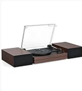
Image: Adjusting the counterweight for optimal tracking force.