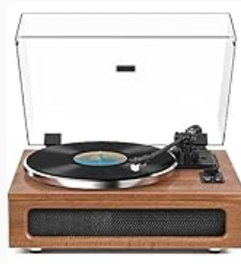
Image: Detailed view of the powerful stereo sound system with 2 mid-bass and 2 dome tweeter speakers.