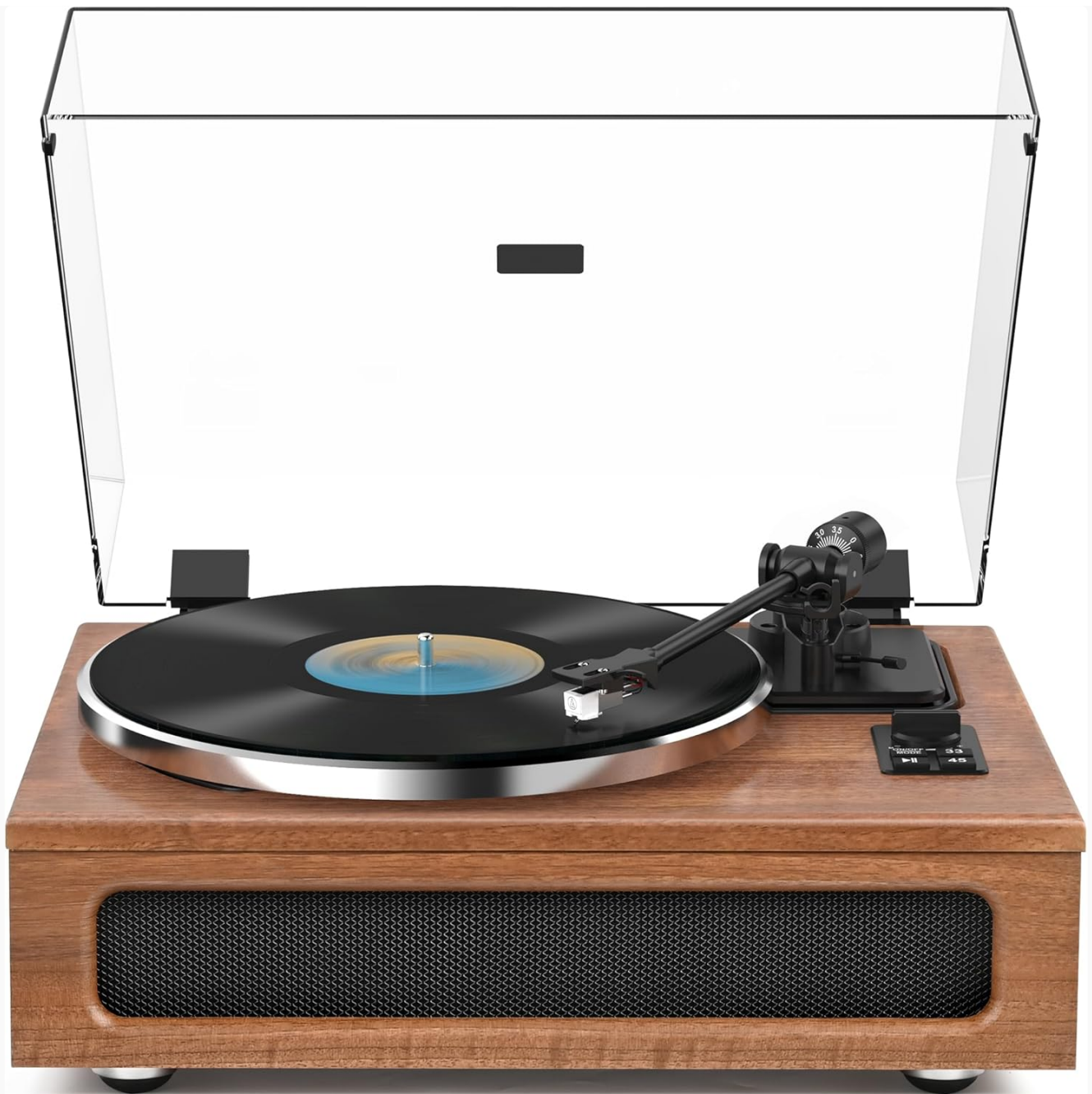
Image: The WOCKODER HQ-KZ018 turntable, showcasing its wooden finish, platter, tonearm, and control panel, with the clear dust cover open.