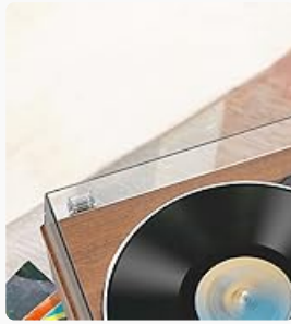
Image: The turntable's control panel with speed selection and volume knob.