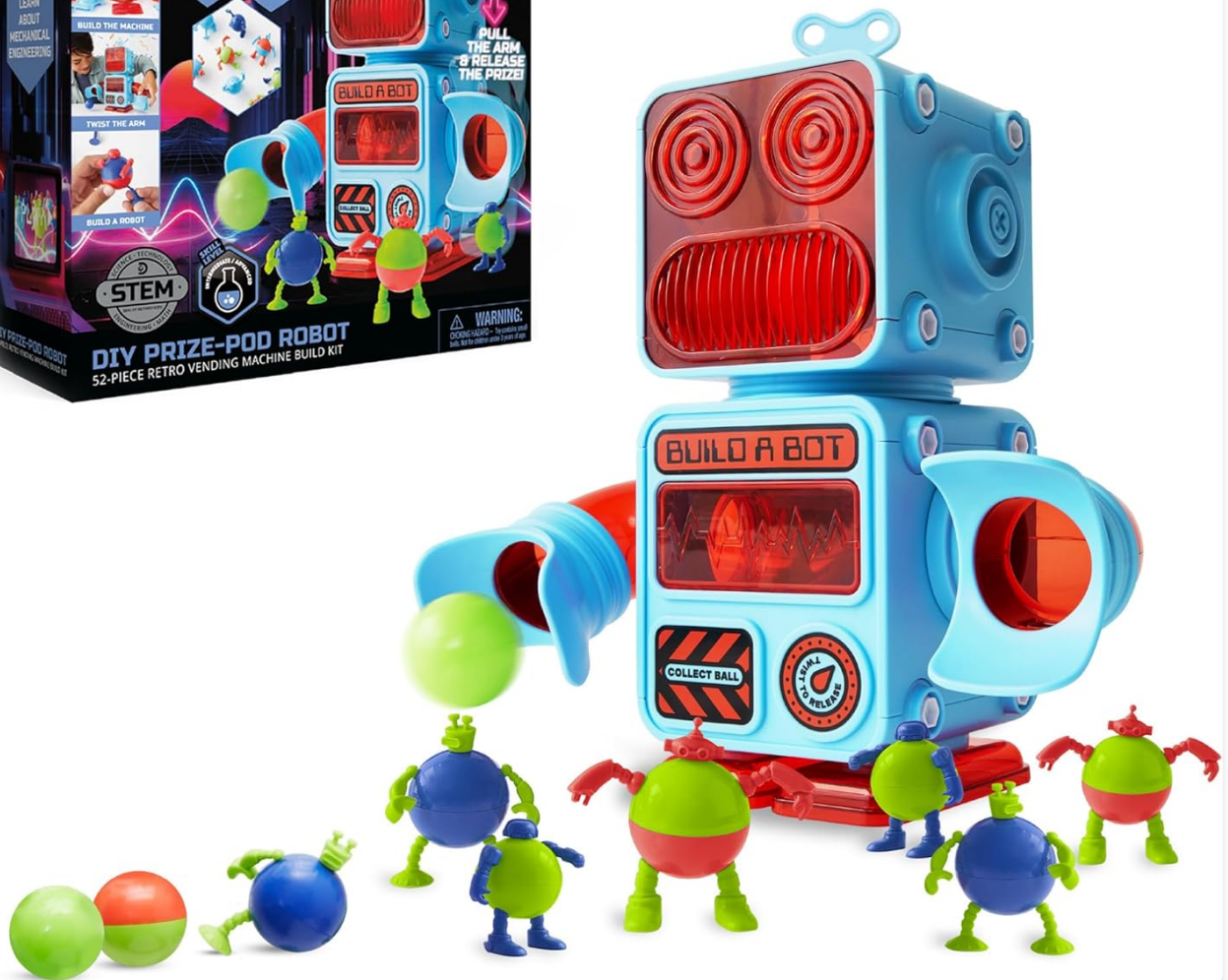
Figure 1: The fully assembled Discovery DIY Prize-Pod Robot Kit, showcasing the main robot, mini robots, and prize capsules.