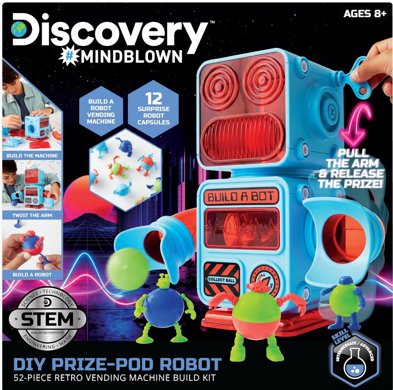
Figure 6: A hand demonstrating the twisting motion of the robot's arm to release a prize capsule.