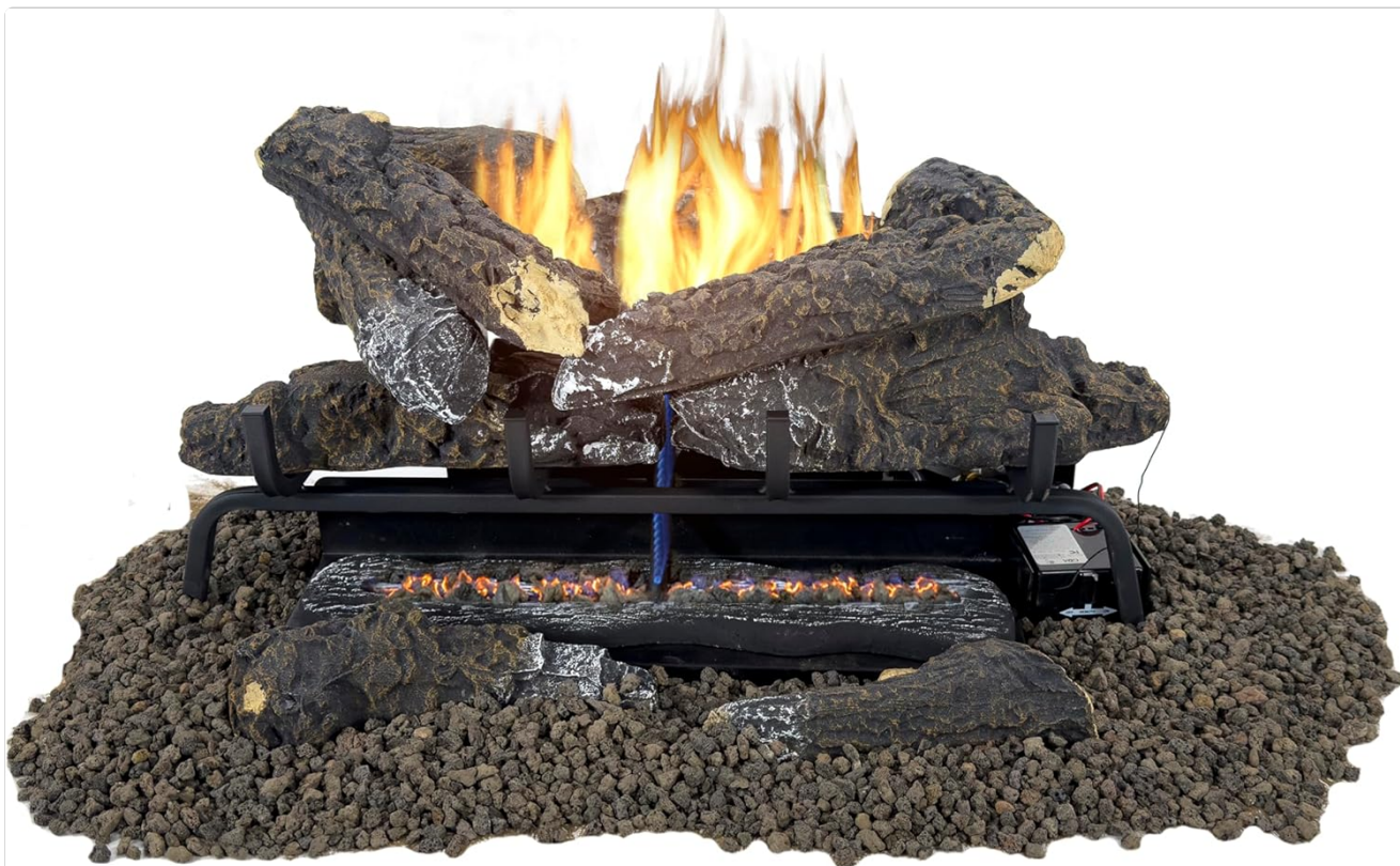
Image 1.1: The Pleasant Hearth 24-inch Valley Oak Vent Free Gas Log Set in operation, showcasing realistic flames and log arrangement.

The unit features a dual burner system with an additional ember fiber burner for a realistic glowing ash bed effect. A 2-in-1 millivolt remote controller is included, functioning as both an on/off switch and a programmable thermostat. No electricity is required for operation, ensuring reliable heating even during power outages.