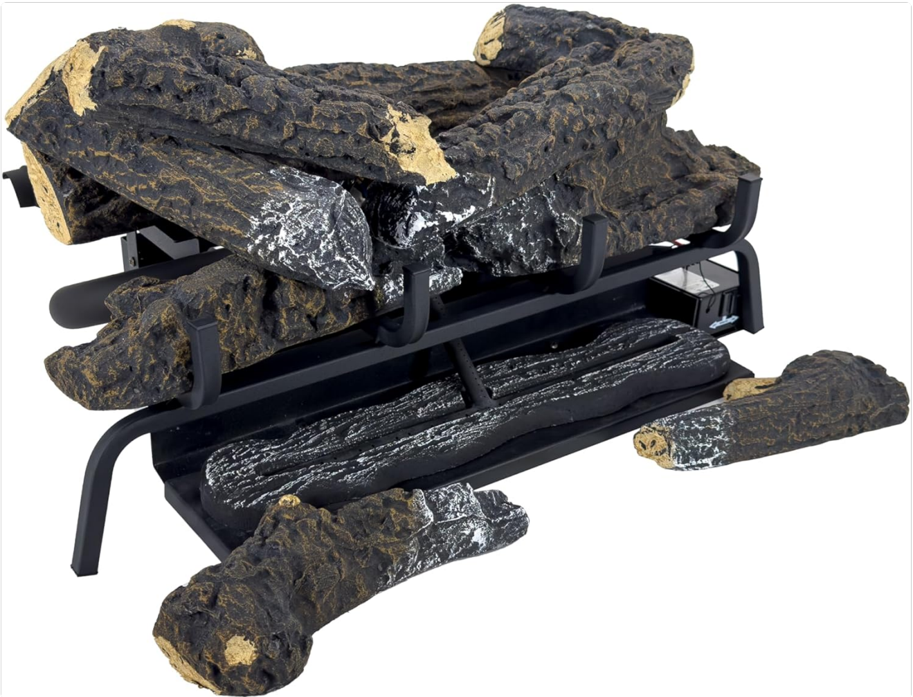
Image 3.1: Components of the gas log set, including the burner assembly and individual log pieces, prior to arrangement.