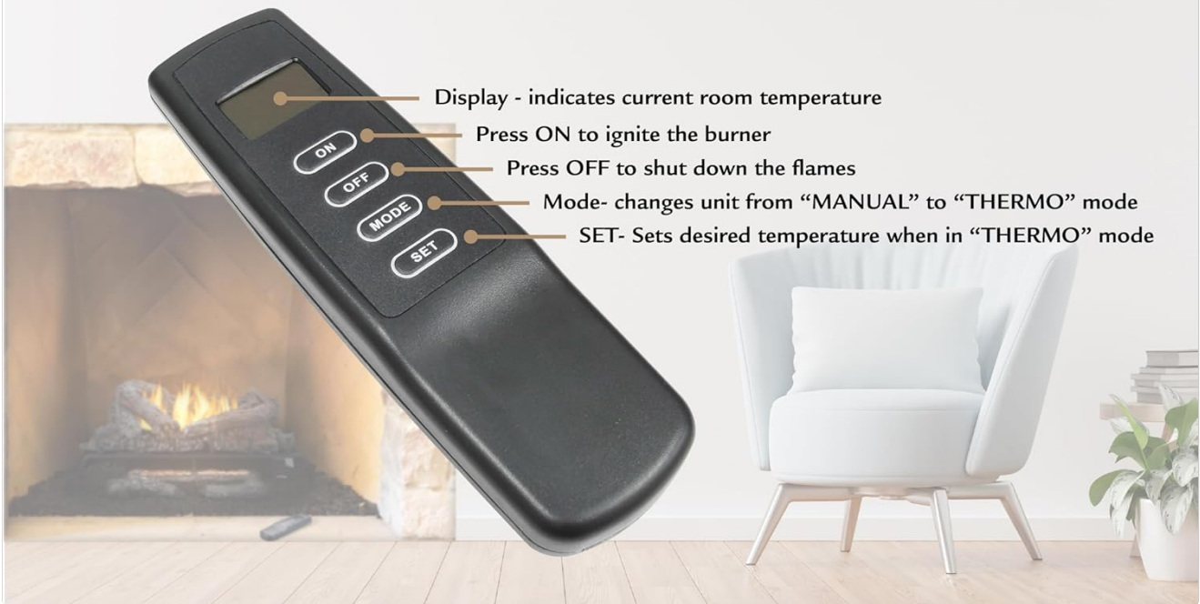
Image 6.1: The remote control unit, detailing the functions of its buttons and display.