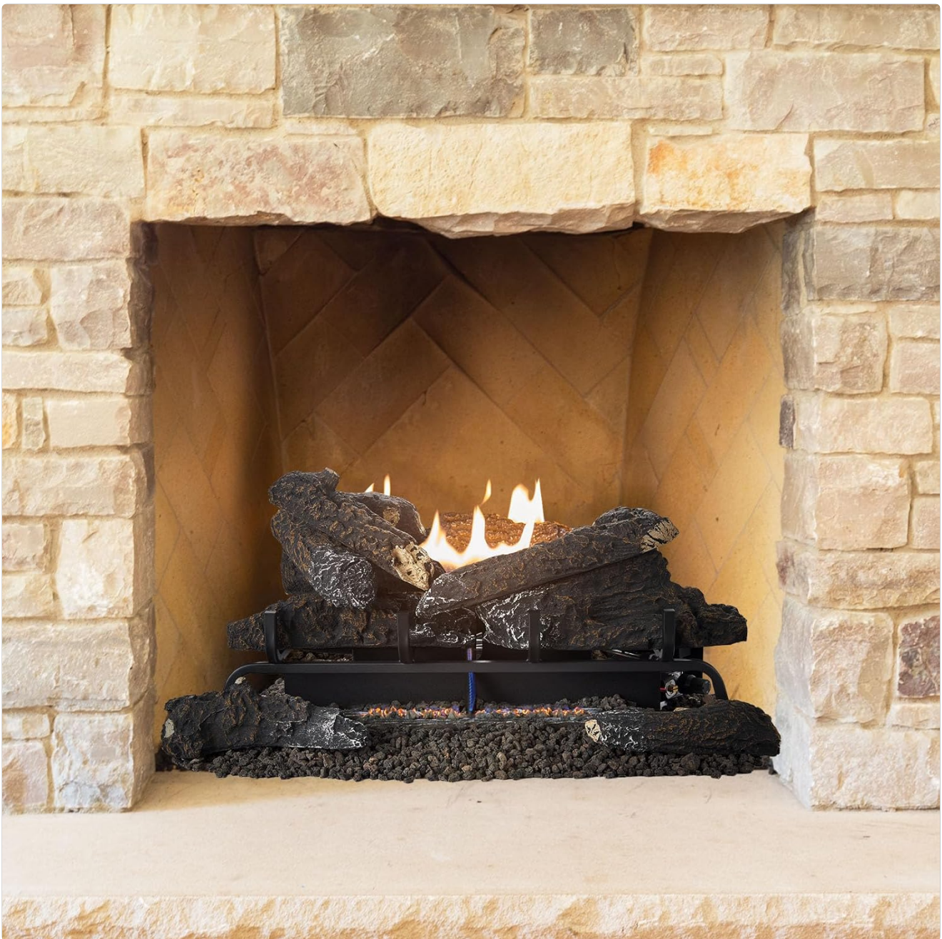
Image 5.2: The gas log set properly installed within a fireplace, demonstrating the intended aesthetic and log arrangement.