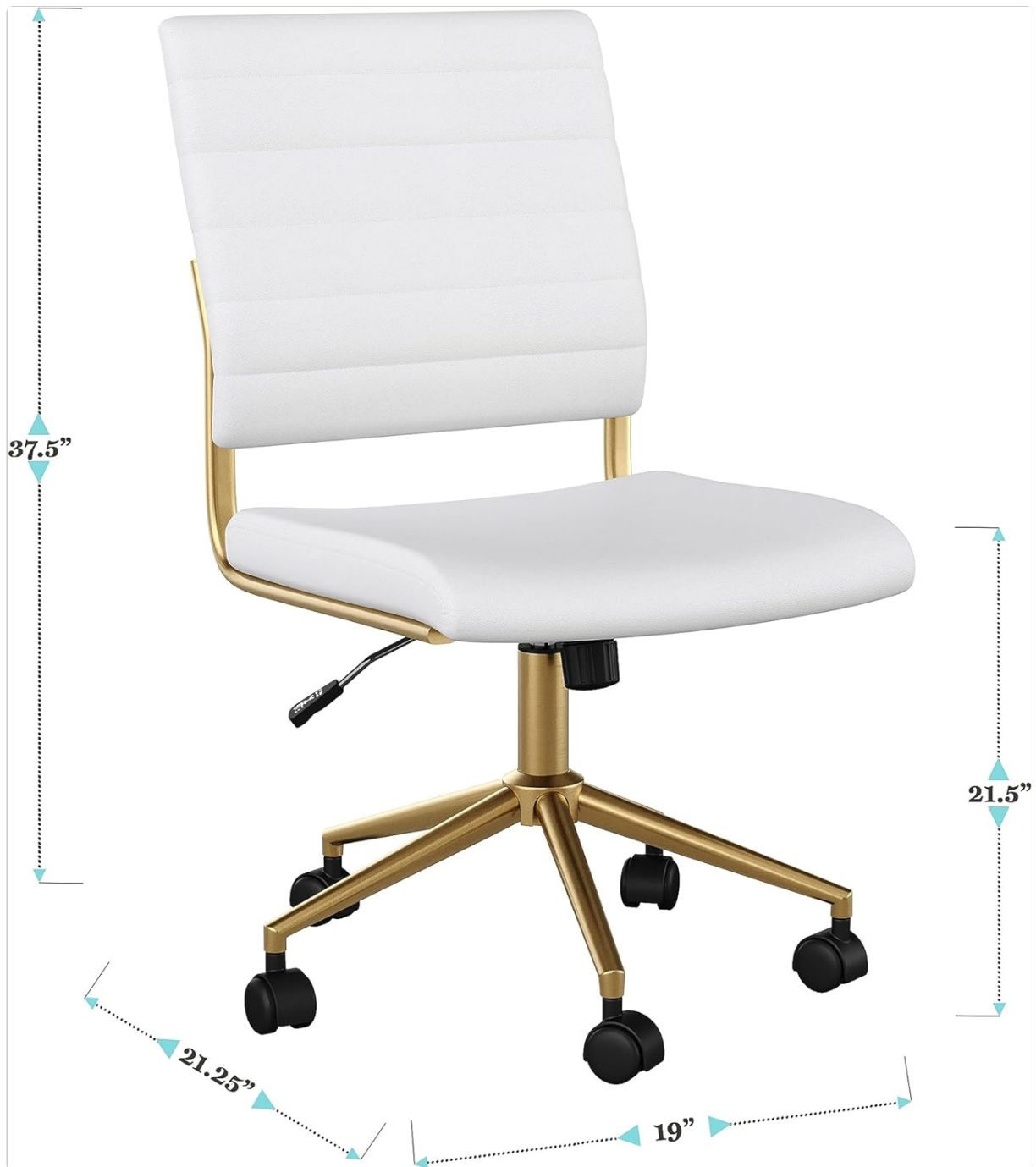
Image 8.1: Detailed dimensions of the chair, including overall height, width, depth, and seat height.