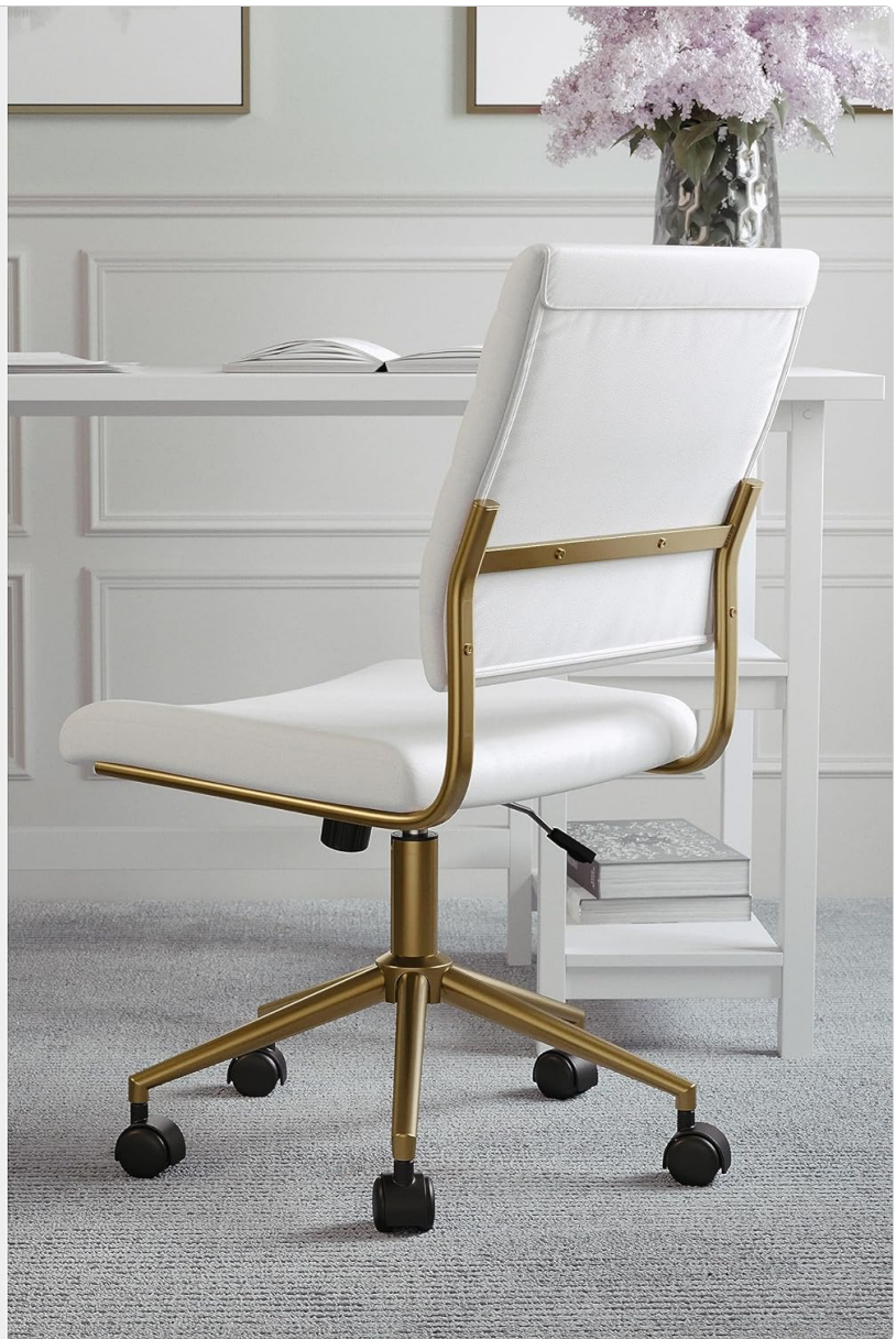
Image 6.1: Features emphasizing the chair's commercial quality, premium faux leather material, and the tilt tension knob, all contributing to its durability and user experience.