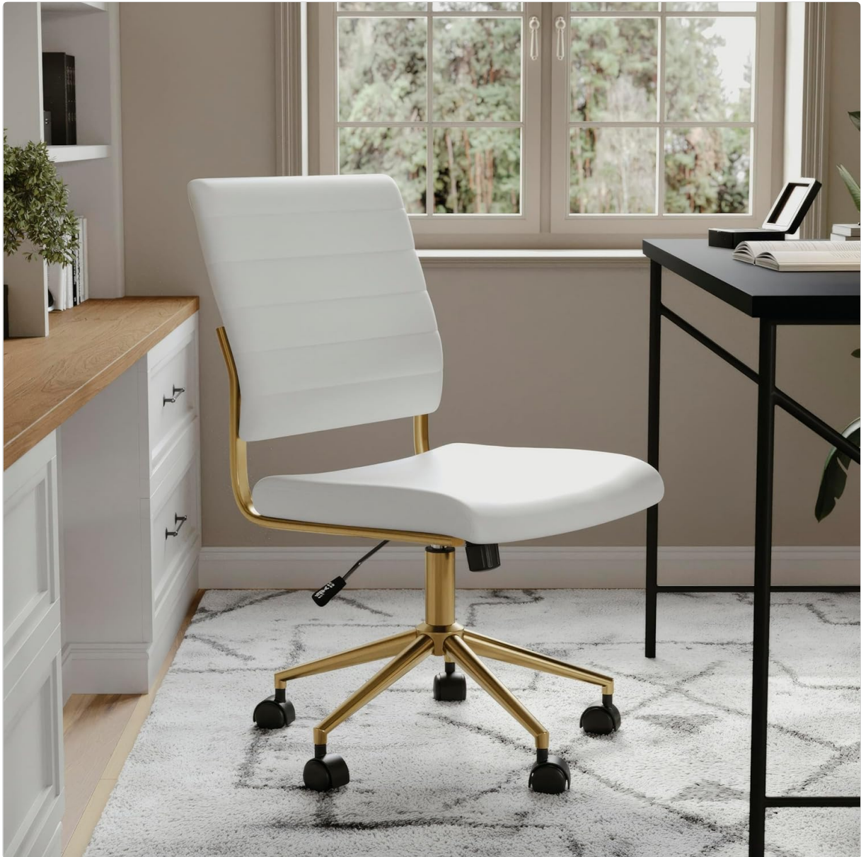
Image 4.1: Key design features including the space-saving armless design, polished frame, and dual wheel casters, which are important for assembly and function.