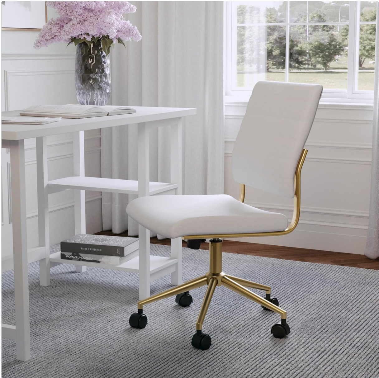
Image 1.1: The Martha Stewart Ivy Armless Swivel Task Chair, showcasing its design in a home office environment.