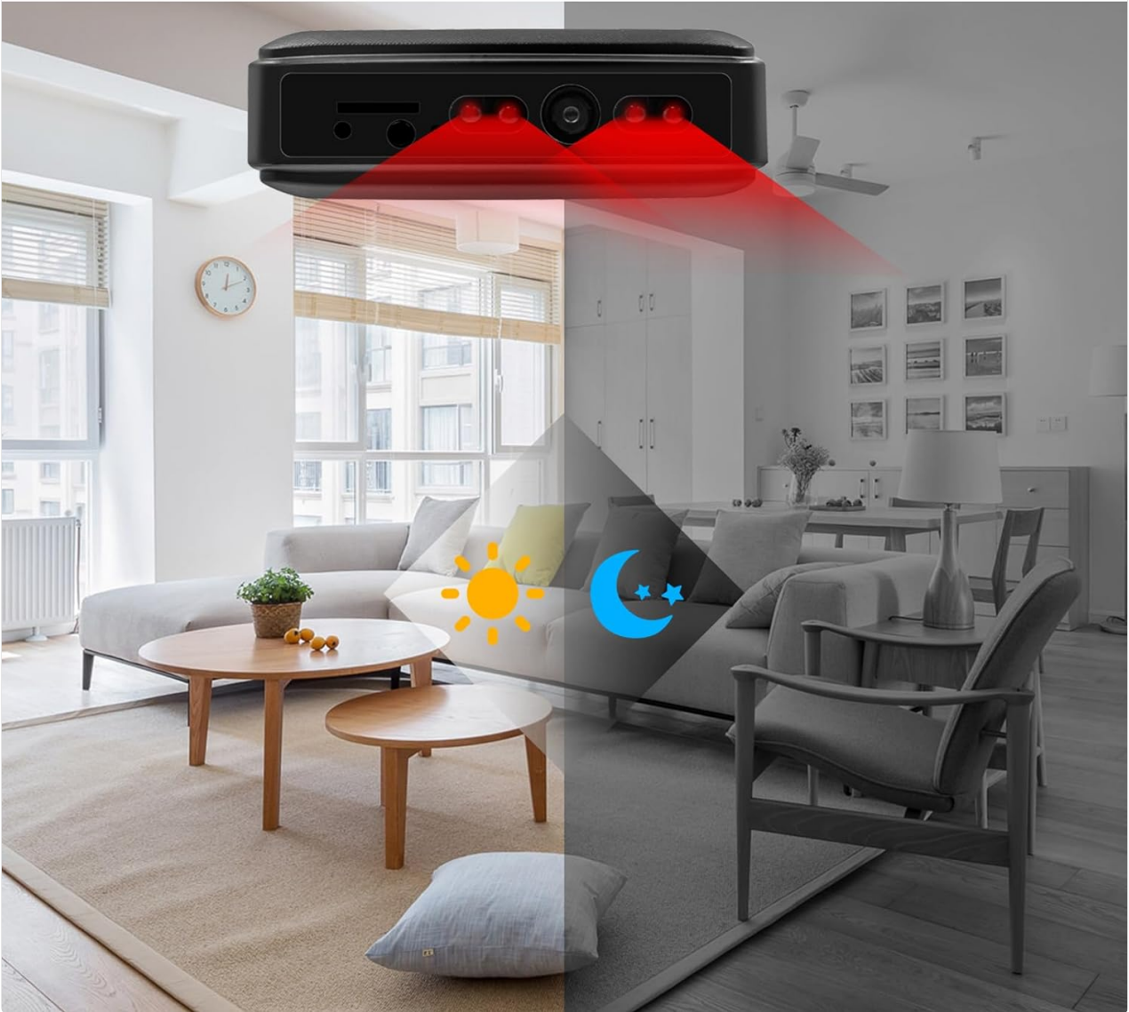
Image: A split image demonstrating the camera's night vision capability, showing a room in daylight on one side and the same room in darkness with infrared illumination on the other.