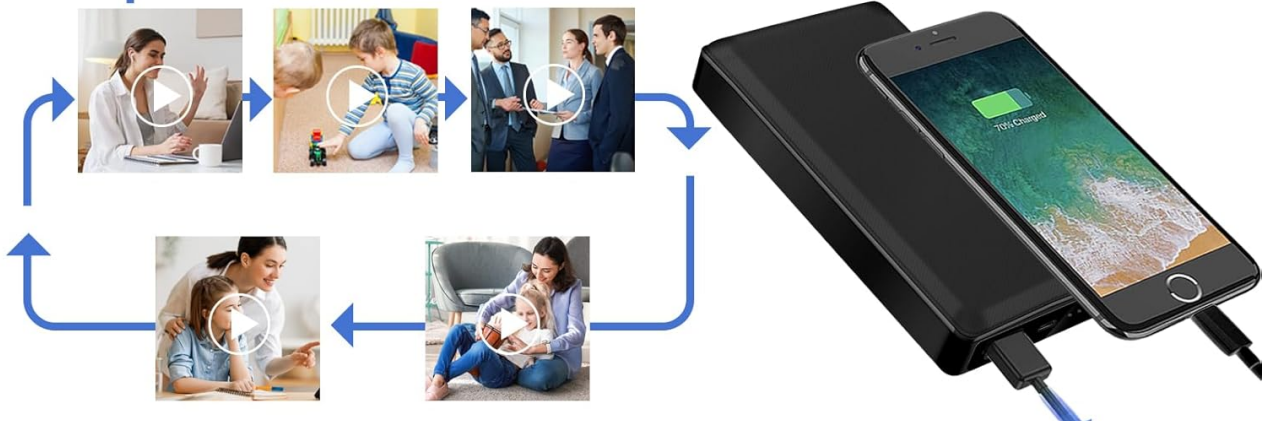
Image: A visual representation of the power bank camera streaming live HD 1080P video to a smartphone, with a family scene in the background.