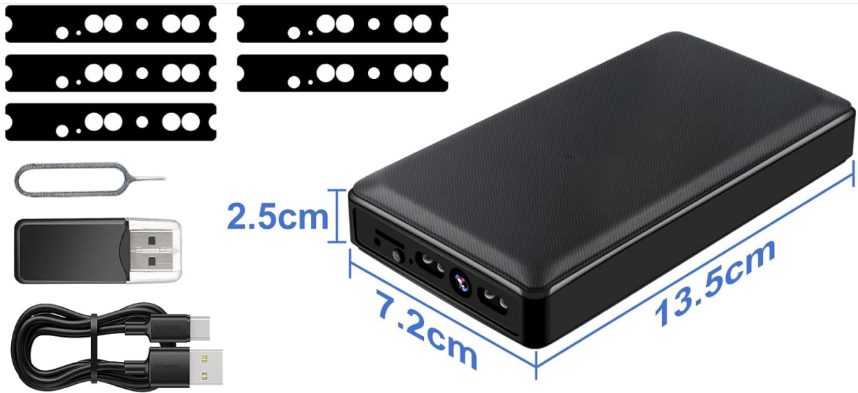
Image: The power bank camera, showing its dimensions (13.5cm x 7.2cm x 2.5cm), and accessories including a USB cable, reset pin, and lens cover stickers.