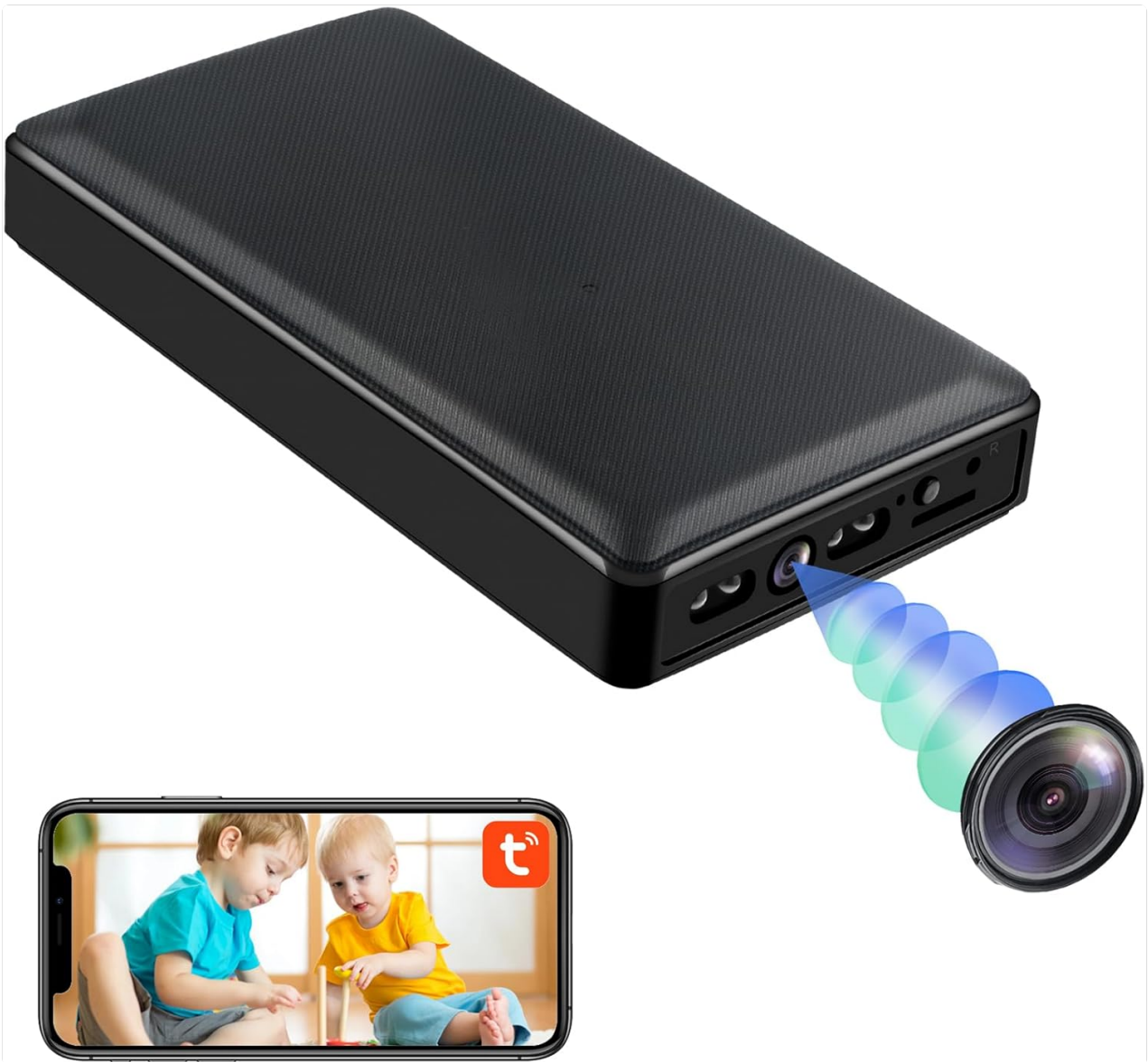
Image: The Nisanmoon power bank camera, illustrating the hidden camera lens and a smartphone displaying a live video feed from the camera.