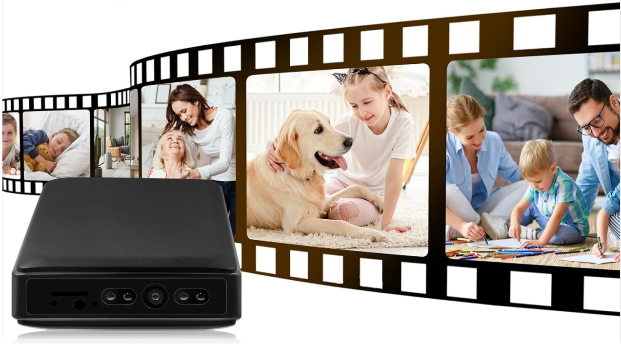
Image: Icons representing Micro SD card storage (up to 256GB) and cloud storage, accompanied by a film strip illustrating continuous recording and various captured moments.

Carte micro sd max jusqu'à 256gb (non inclus) 30 jours de stockage dans le nuage payants