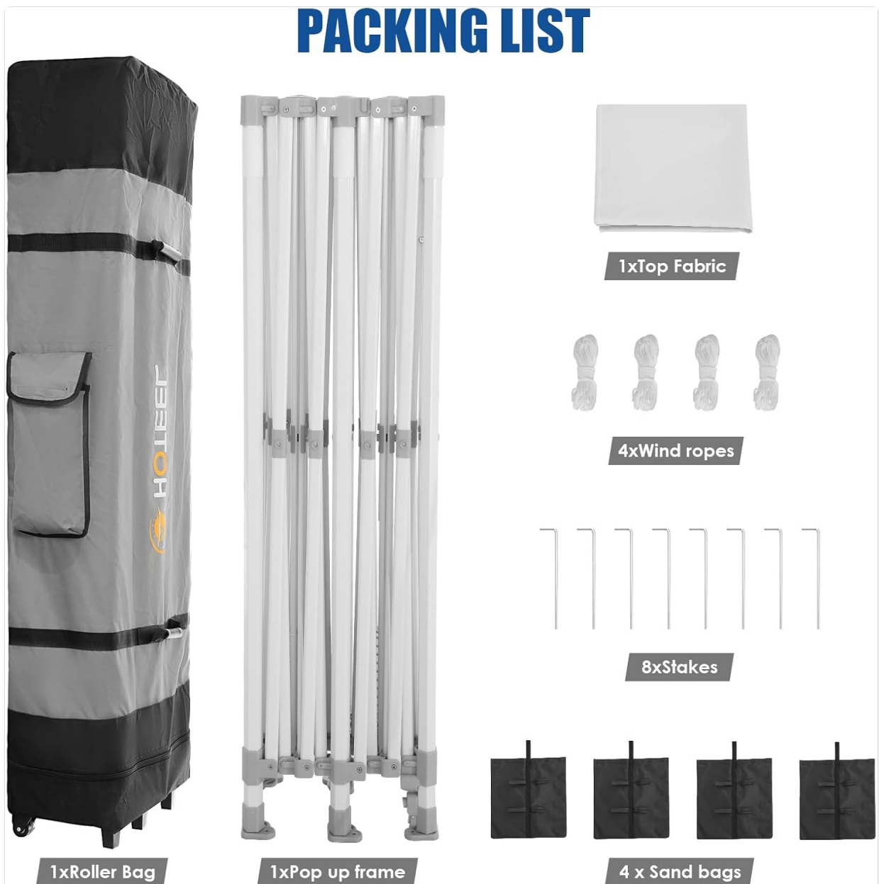
Figure 2.1: Included components and dimensions of the HOTEEL 10x20 Pop-Up Canopy Tent.