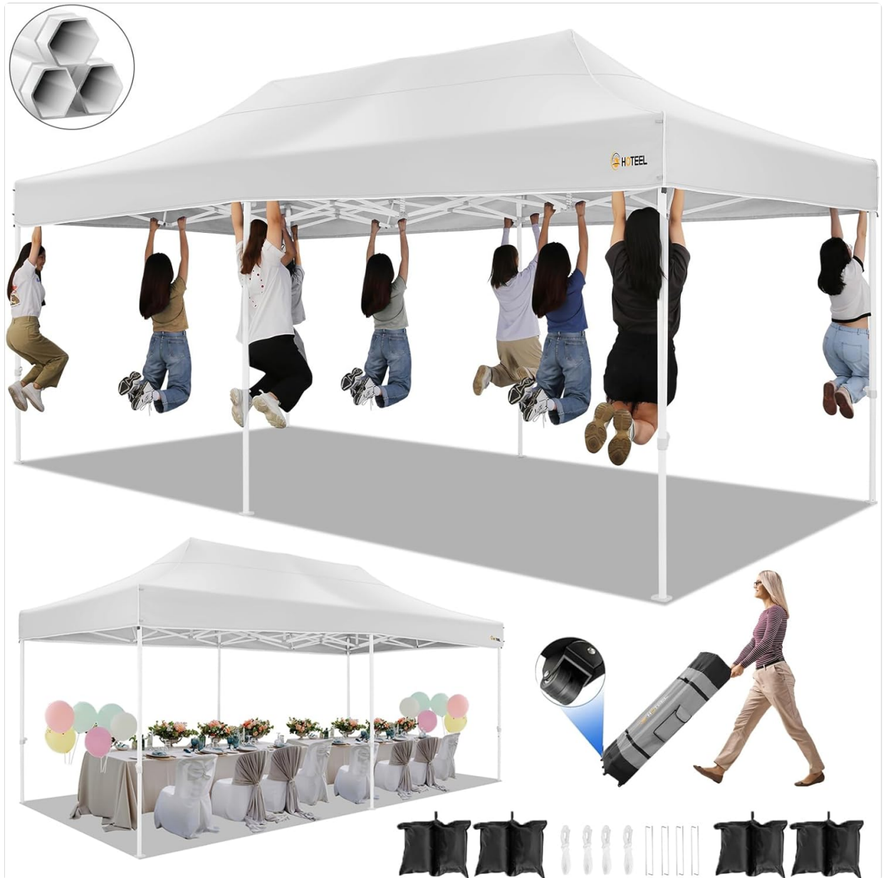
Figure 7.1: The HOTEEL 10x20 Pop-Up Canopy Tent in use, highlighting its spacious design and robust construction.