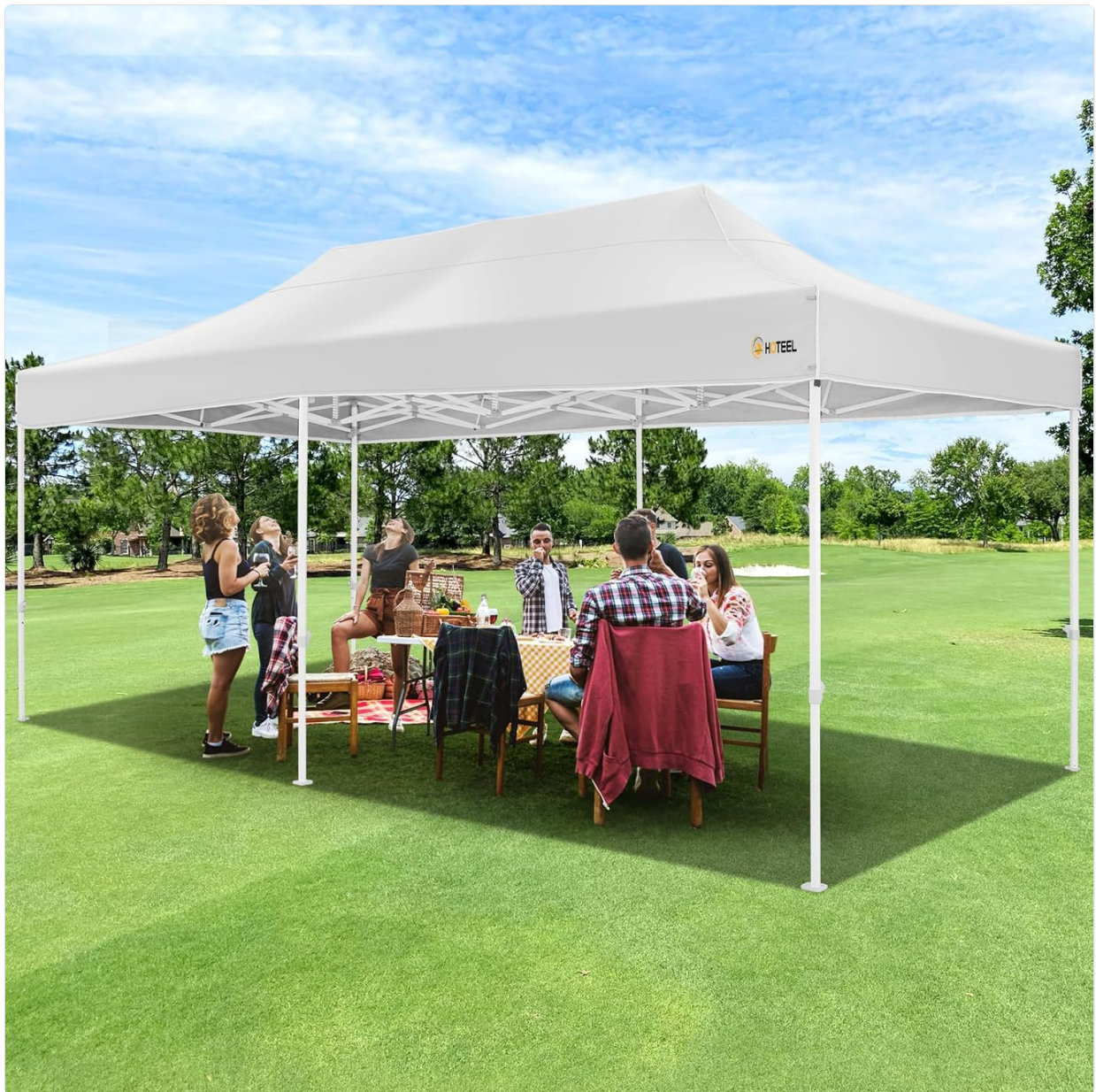
Figure 3.2: The HOTEEL 10x20 Pop-Up Canopy Tent providing shade and shelter for an outdoor gathering.