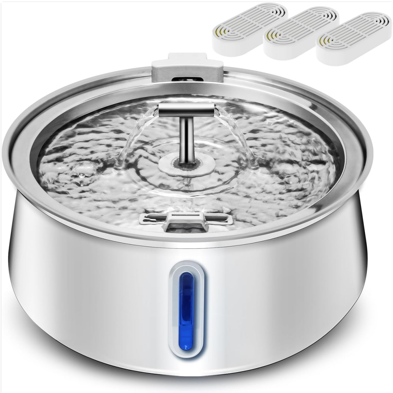
The fully assembled Vekonn Cat Water Fountain, ready for use.