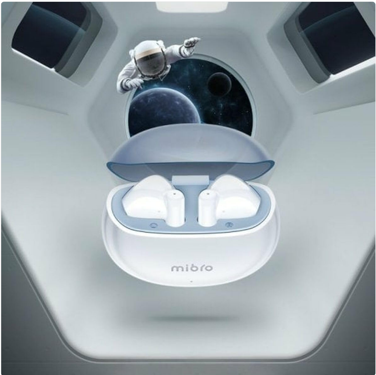
Figure 2.1: The Mibro 2 Earbuds and charging case, highlighting their compact and modern design.