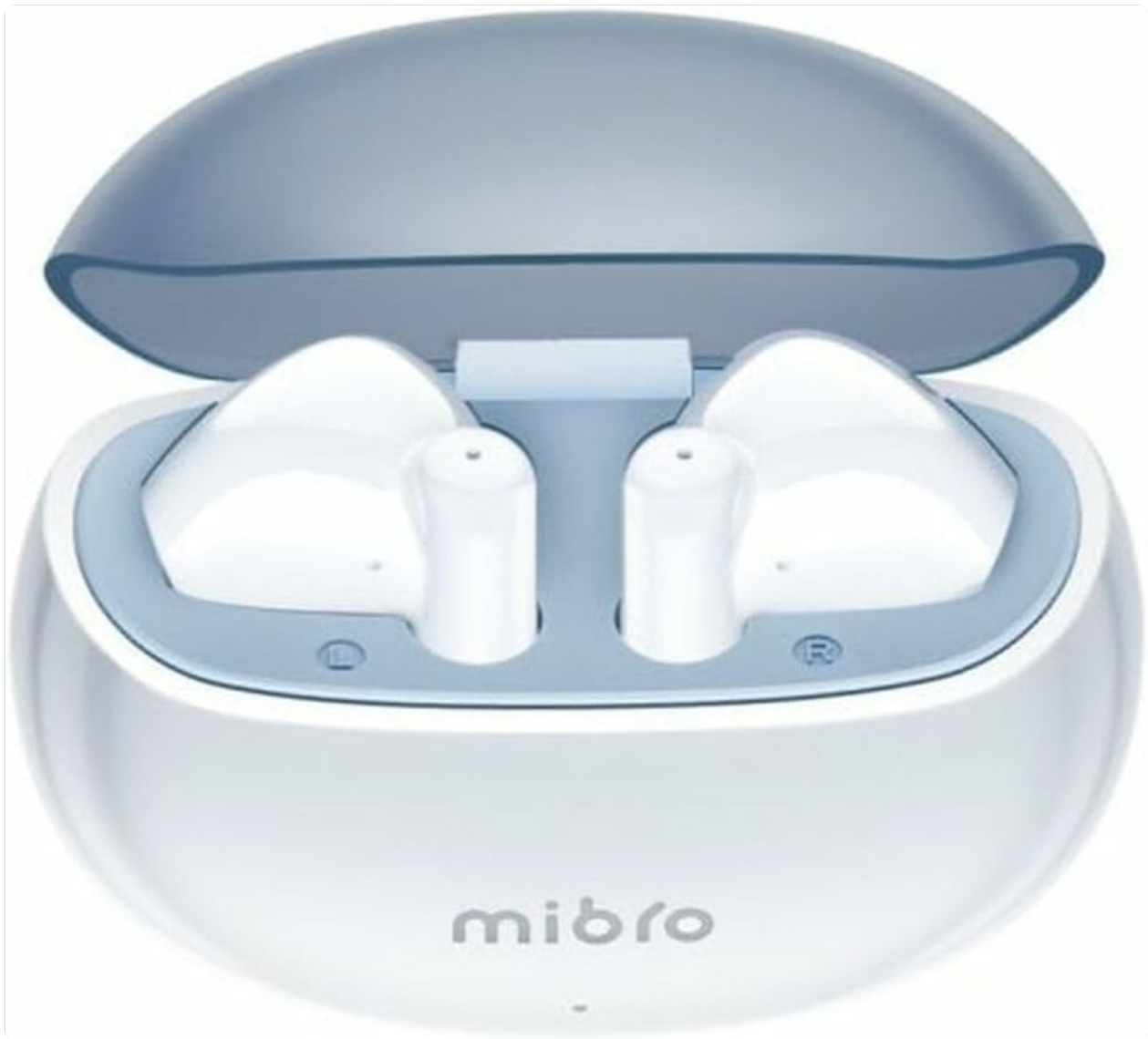
Figure 1.1: Mibro 2 Earbuds in their charging case, showcasing the sleek white design.