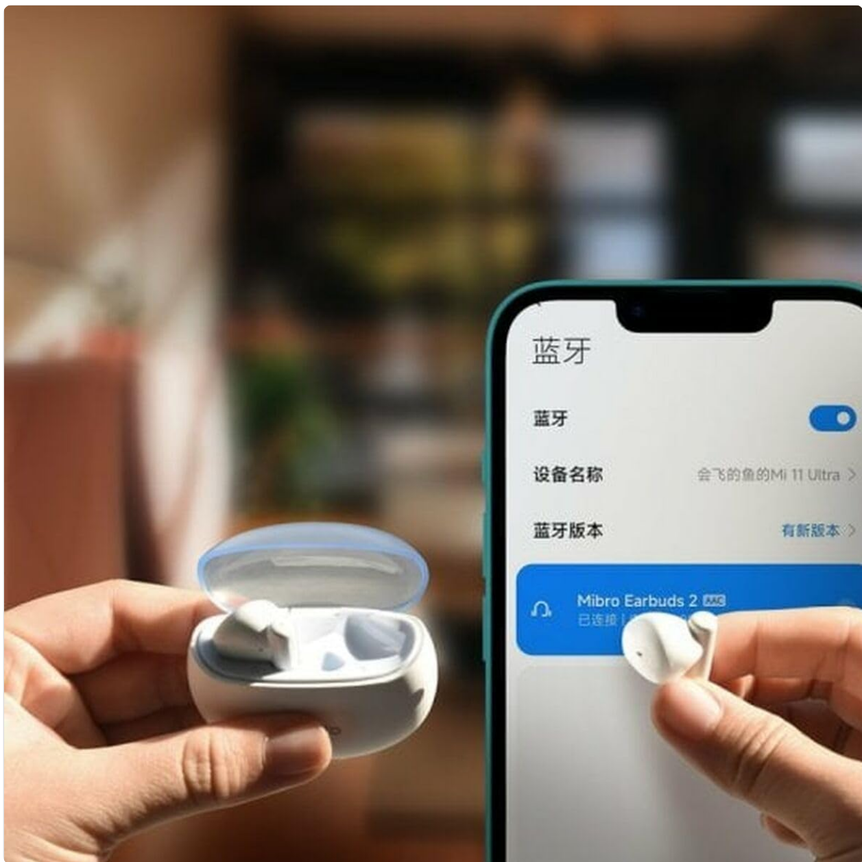
Figure 3.2: Pairing the Mibro 2 Earbuds with a mobile device.