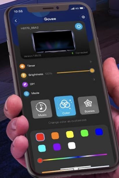
Image: A hand holding a smartphone showing the Govee Home app, with icons for colors, brightness, scene modes, and timers, demonstrating easy control of the TV backlight.