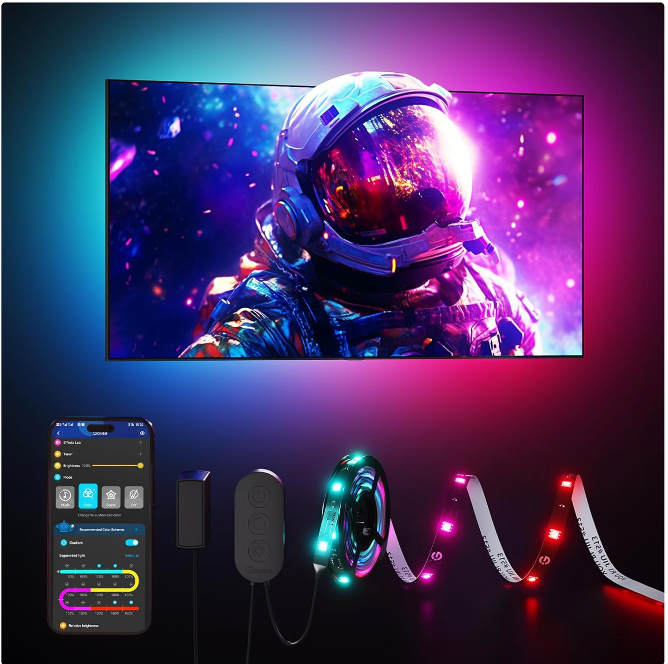
Image: Govee TV LED Backlight Strip components including the strip, controller, power adapter, and a smartphone displaying the Govee Home app, positioned in front of a TV with vibrant backlighting.