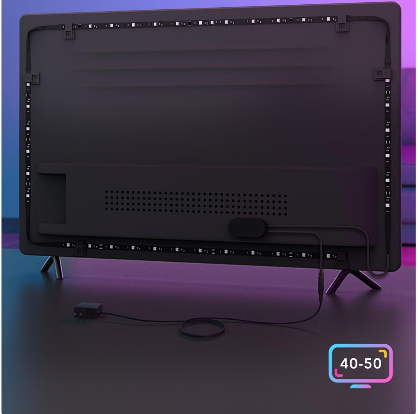
Image: The back of a television with the Govee LED backlight strip neatly installed along all four edges, demonstrating proper placement for optimal lighting coverage on 40-50 inch TVs.