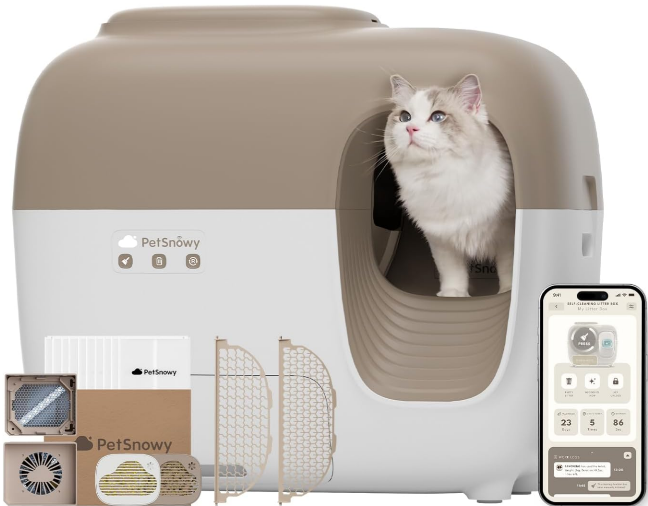
The PetSnowy SNOW+ automatic cat litter box with included accessories and a cat using the entrance.