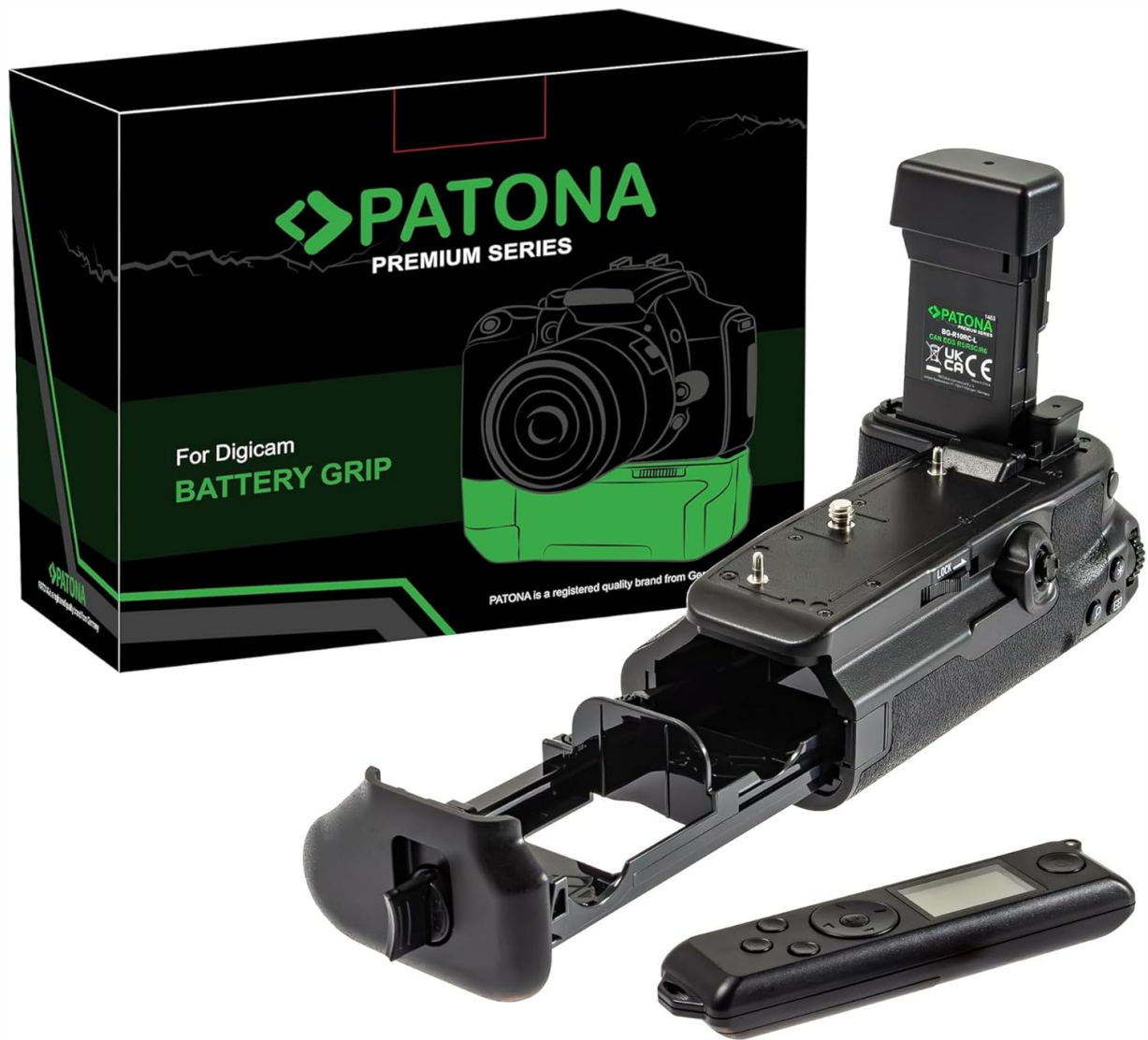
Figure 1: PATONA BG-R10 Power Grip and 2.4G remote control, shown with its packaging. This image provides a general view of the product and its accessories.