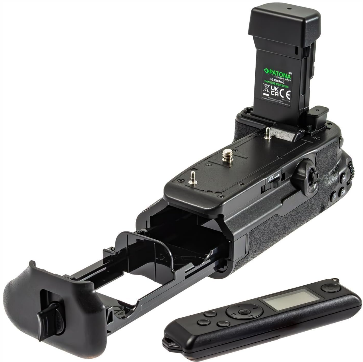
Figure 2: The power grip detached from its battery tray, alongside the 2.4G wireless remote control. This view highlights the grip's structure and the separate battery compartment.