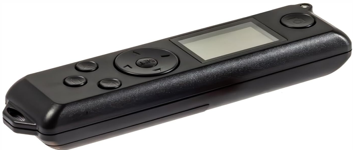
Figure 5: Close-up of the 2.4G wireless remote control, featuring an LCD screen and various control buttons for adjusting shooting parameters.