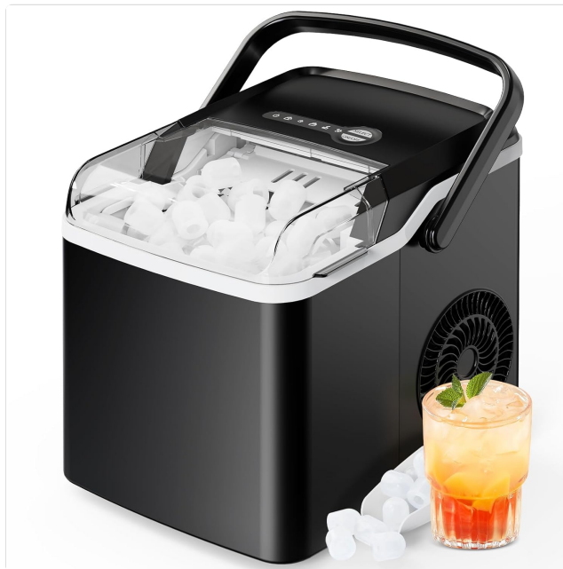
Figure 1: The Silonn Countertop Ice Maker, showcasing its sleek black design and a refreshing iced beverage.

Thank you for choosing the Silonn Countertop Ice Maker. This portable and efficient appliance is designed to provide you with fresh ice quickly, producing 9 bullet-shaped ice cubes in just 6 minutes and up to 26 lbs of ice in 24 hours. Its compact design and self-cleaning function make it ideal for home use, parties, or even RVs. Please read this manual thoroughly before operation to ensure safe and optimal performance.