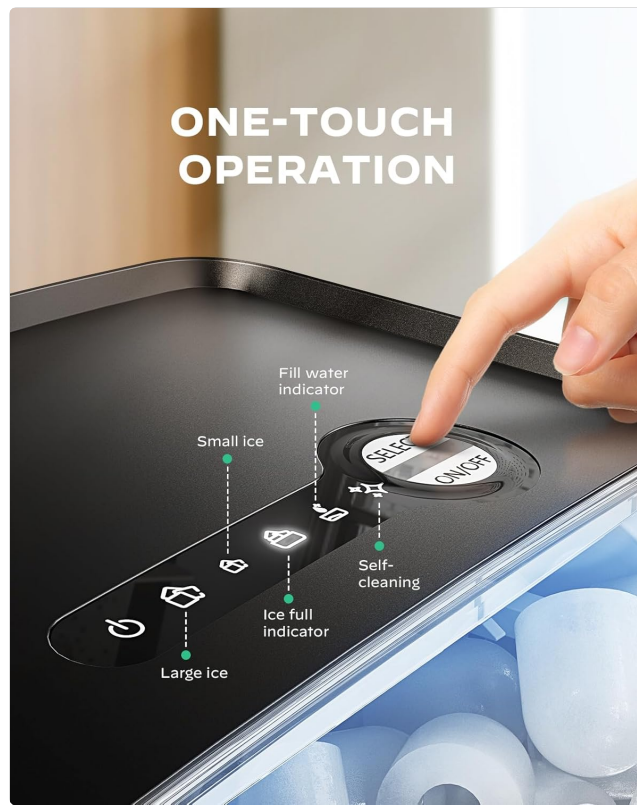
Figure 2: The intuitive control panel of the Silonn Ice Maker, showing various indicator lights and buttons for easy operation.