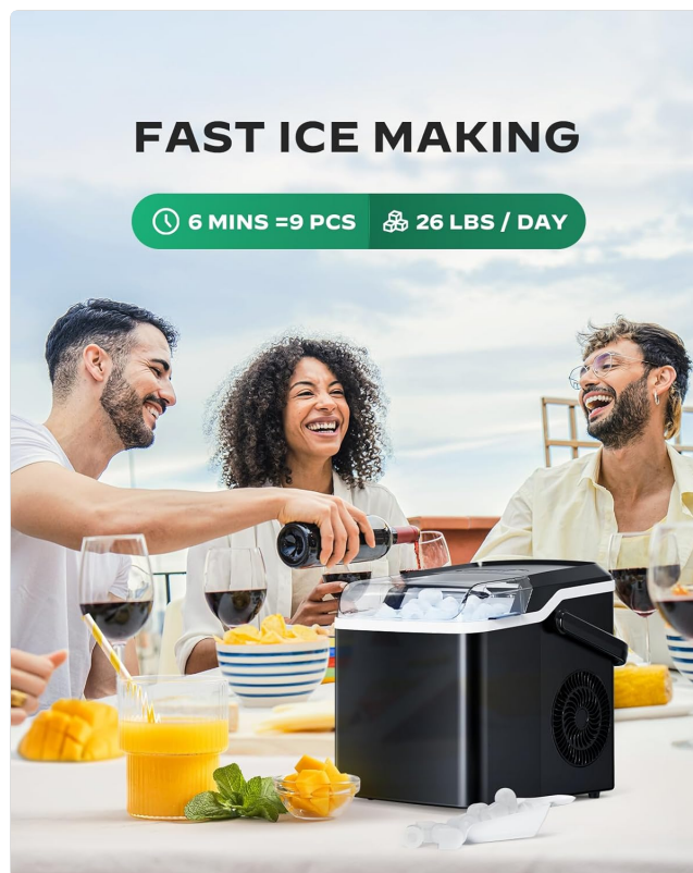
Figure 3: The Silonn Ice Maker provides a continuous supply of ice for various occasions.