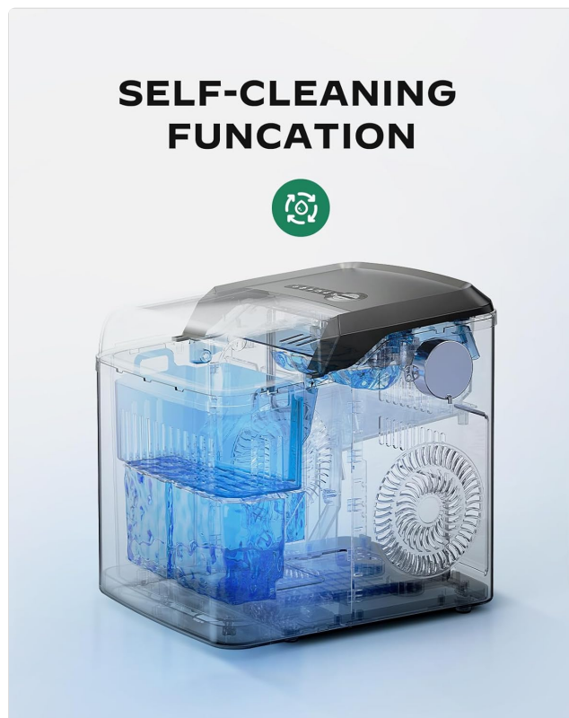
Figure 5: The internal mechanism of the Silonn Ice Maker during its self-cleaning cycle, ensuring thorough sanitation.