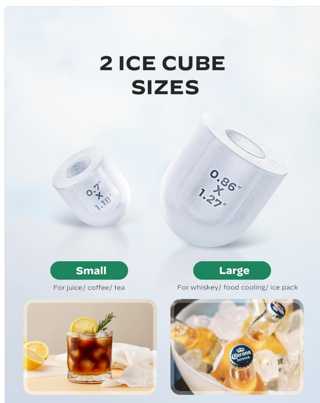
Figure 4: The two available ice cube sizes: Small (0.7" x 1.18") for juice/coffee/tea, and Large (0.86" x 1.27") for whiskey/food cooling/ice pack.