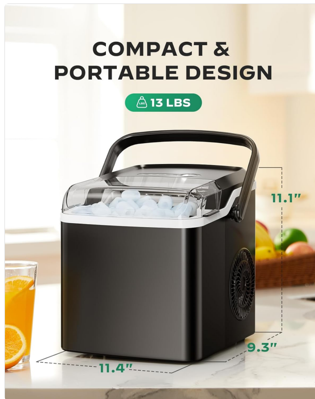
Figure 6: Dimensions of the Silonn Countertop Ice Maker, highlighting its compact and portable design.