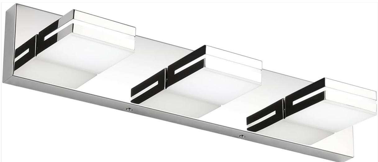
Image 1: SineRise 3-Light, 24-Inch Chrome Dimmable Vanity Light Fixture.

Thank you for choosing the SineRise LED Modern Bathroom Vanity Light Fixture. This manual provides essential information for the safe installation, operation, and maintenance of your new lighting fixture. Please read these instructions thoroughly before installation and retain them for future reference.