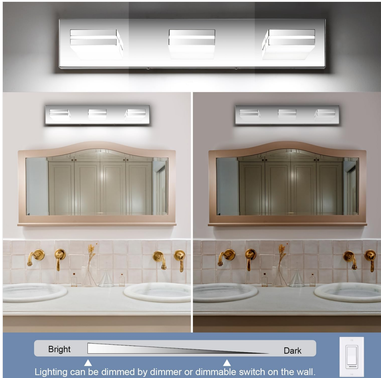
Image 3: Illustration of the dimmable functionality, showing the light intensity adjustable from bright to dark using a dimmer switch.

This fixture is dimmable. To utilize the dimming feature, connect it to a compatible dimmer switch (not included). Adjust the dimmer switch to achieve your desired brightness level.