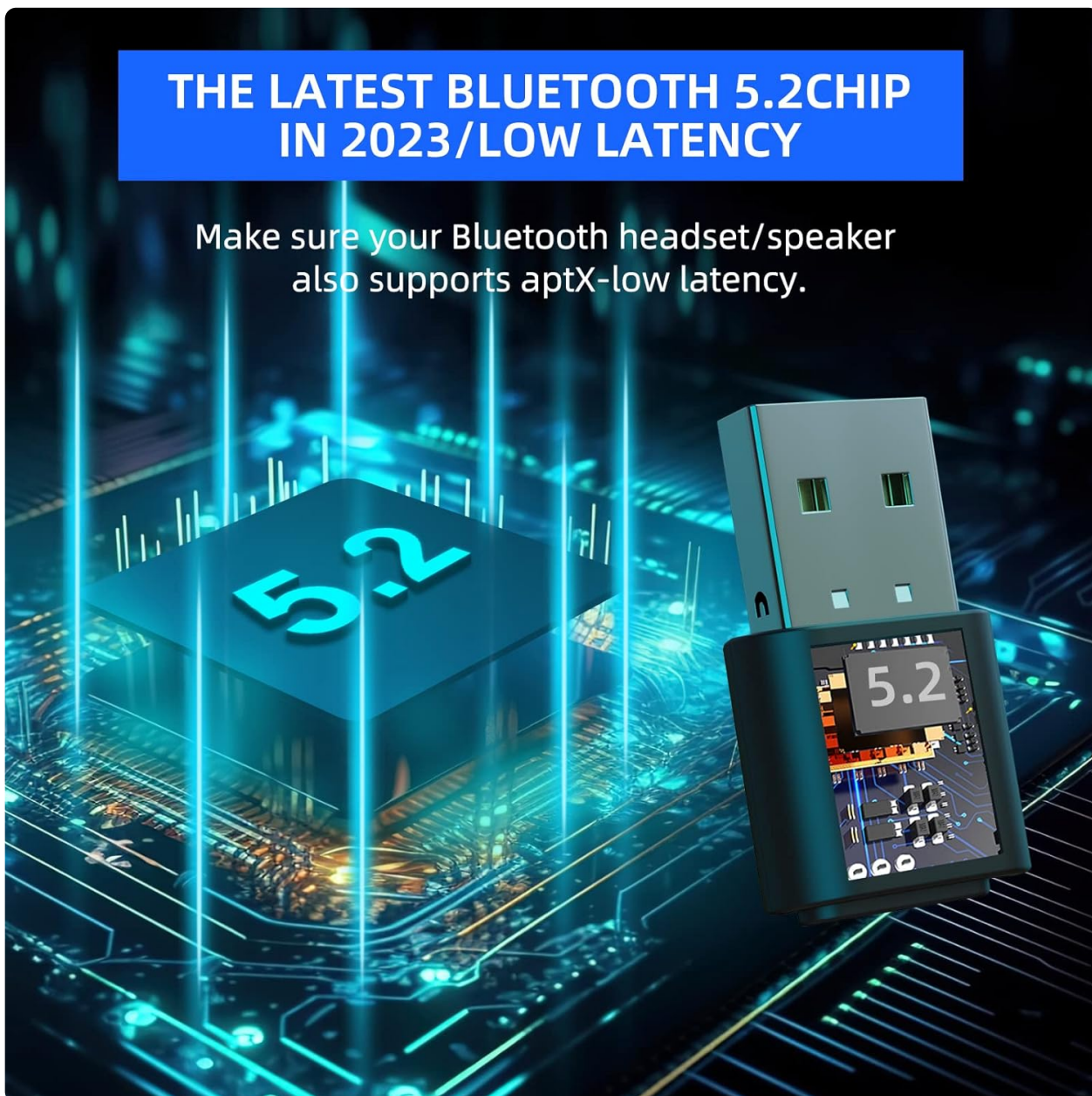
Image: Visual representation of the Bluetooth 5.2 chip highlighting low latency technology.