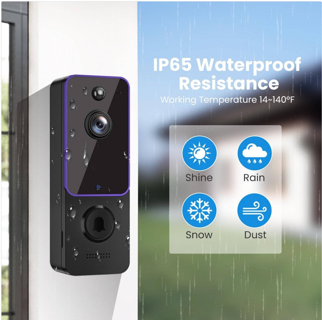
Image: The doorbell camera shown with water droplets, illustrating its IP65 waterproof resistance and ability to withstand various weather conditions like shine, rain, snow, and dust.