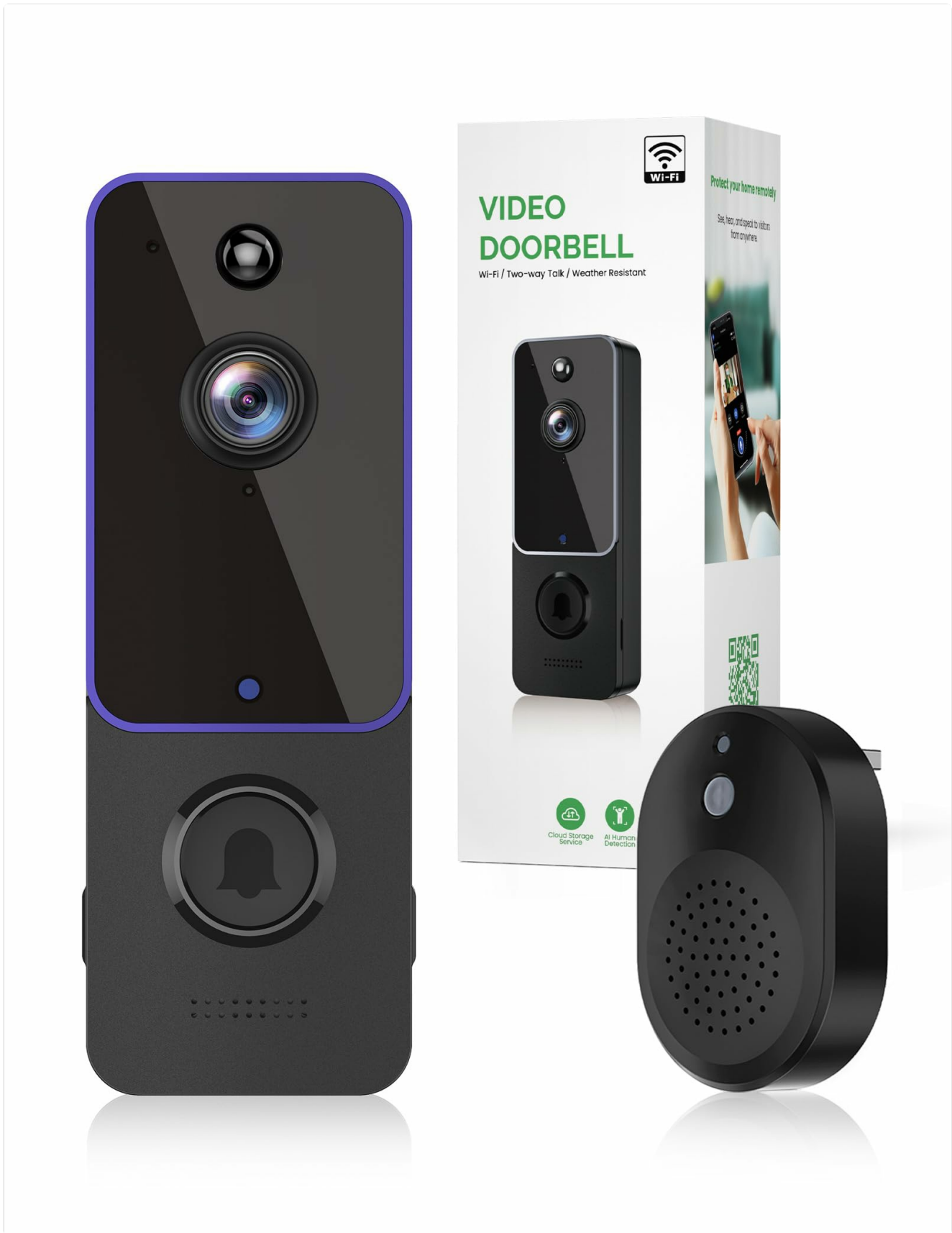
Image: The BITEPASS P8 Smart Wireless Doorbell Camera, highlighting features such as AI Human Detection, Night Vision, HD Video, Ultra Wide Angle Lens, Two-way Audio, Instant Alert, Cloud Storage, and Battery Powered.

Your browser does not support the video tag.