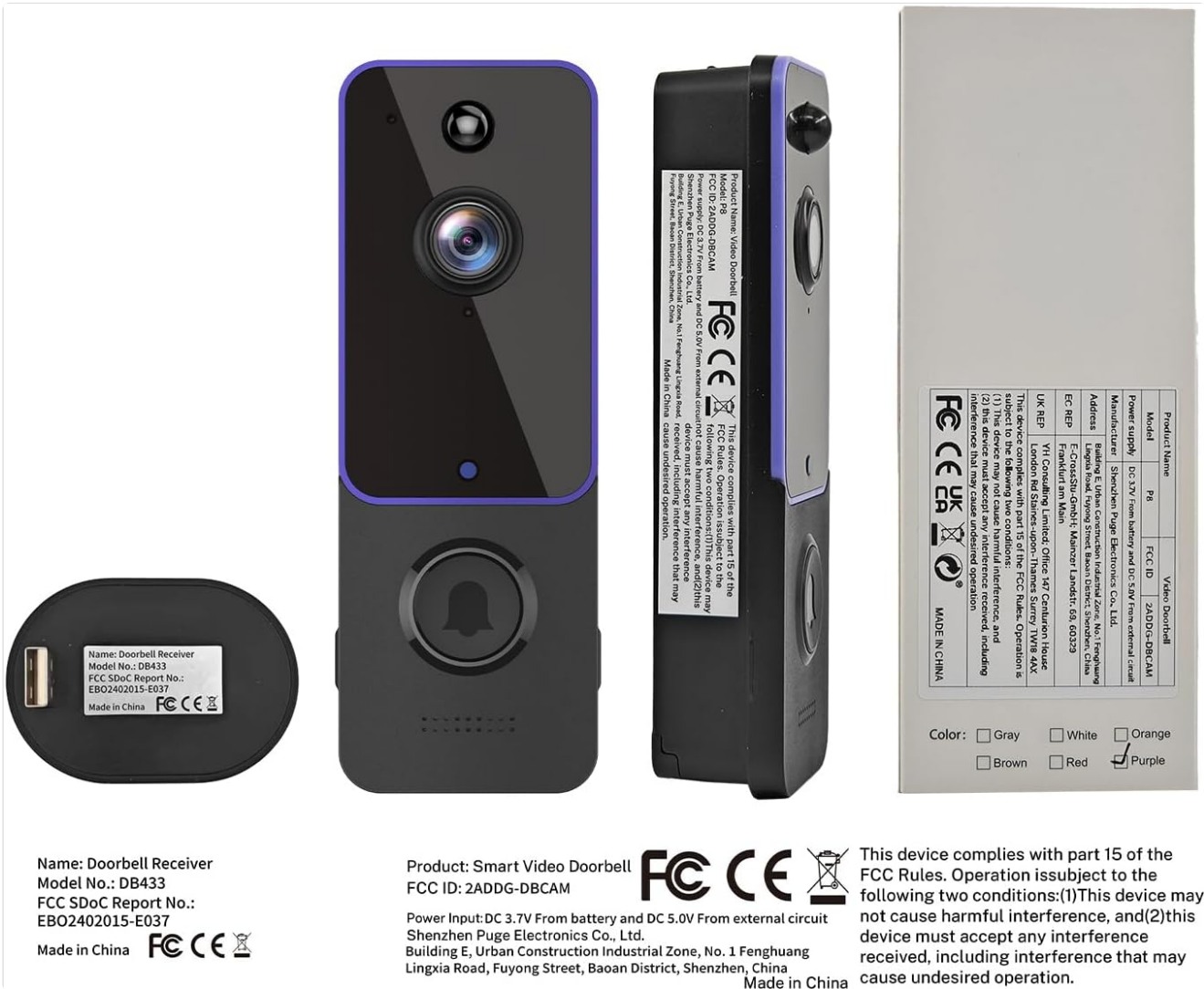
Image: A detailed view of the doorbell camera and its components, including the doorbell receiver and product labels.