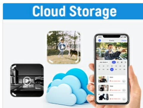
Image: An illustration of the cloud storage feature, showing recorded video clips accessible via a smartphone app.

Recorded video clips are stored securely in the cloud (subscription may be required). You can access, view, download, and share these recordings through the Aiwiit app. This ensures you never miss important events at your door.