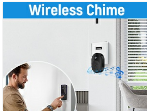
Image: The wireless chime unit plugged into a wall outlet, indicating it's producing sound when the doorbell is pressed.

The included wireless chime plugs into any standard wall outlet and provides an audible alert inside your home when the doorbell button is pressed. Pair the chime with the doorbell according to the instructions in the app.