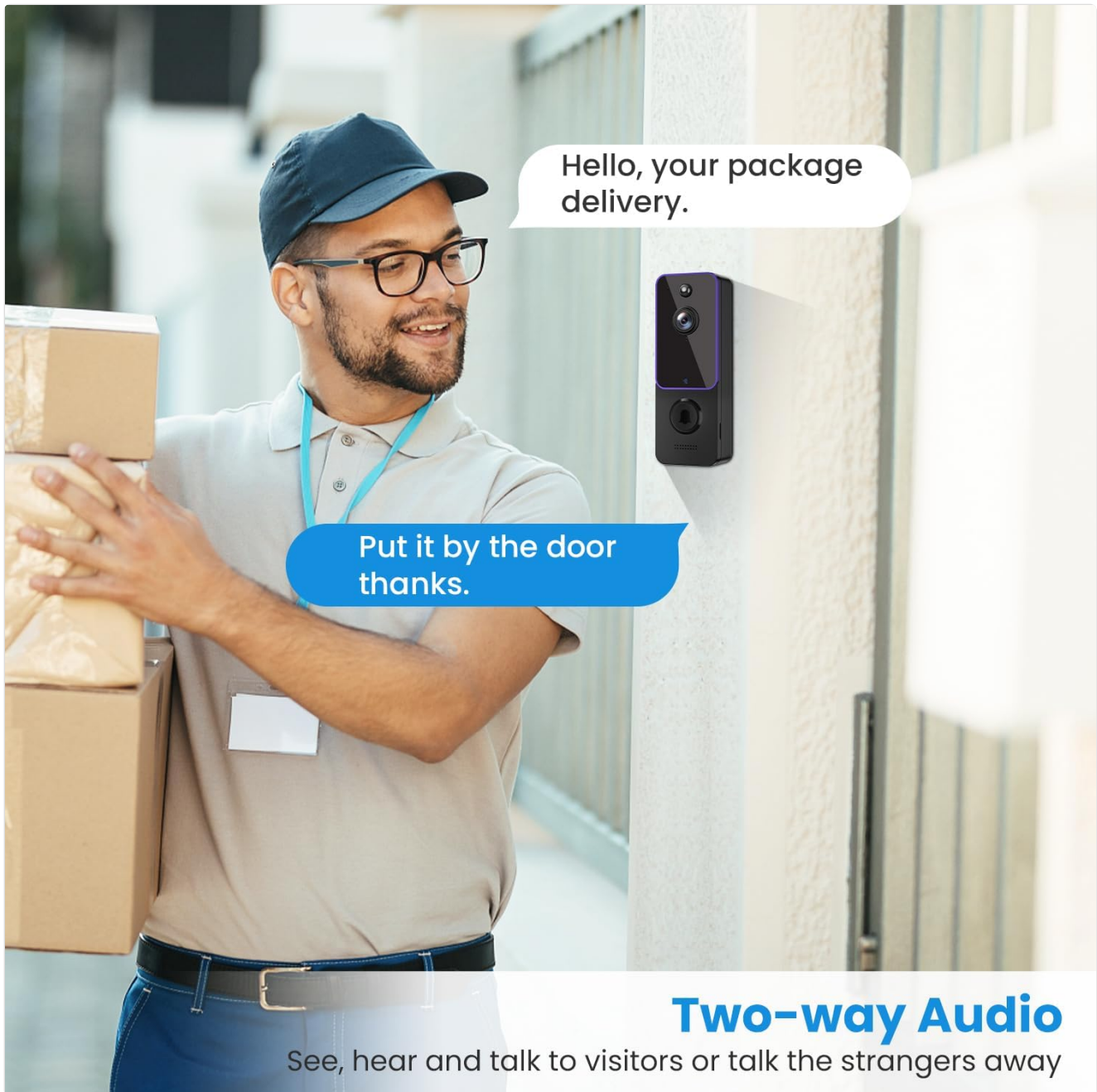
Image: A delivery person at the door and a user communicating via the doorbell's two-way audio feature through a smartphone app.

When a visitor presses the doorbell or motion is detected, you will receive a notification on your smartphone. Tap the notification to open the live view and use the two-way audio feature to speak with your visitor. This allows for clear communication with guests or delivery personnel.