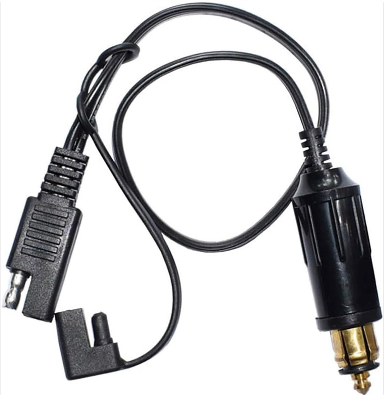
Figure 1.1: ZYNCUE Motorcycle Connection Cable with SAE Plug.