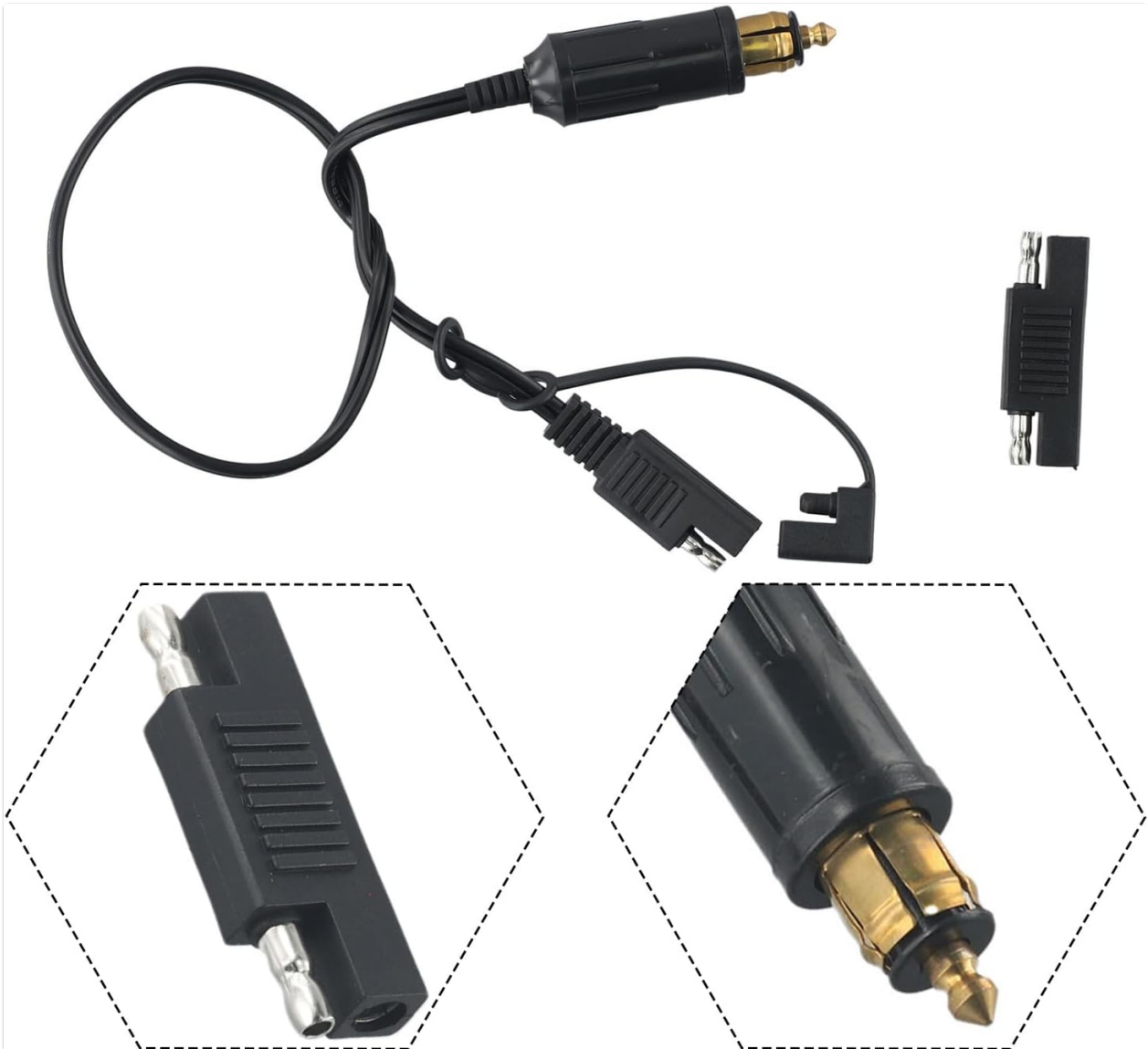
Figure 3.1: Overview of the cable components, including the main cable and the separate SAE plug.