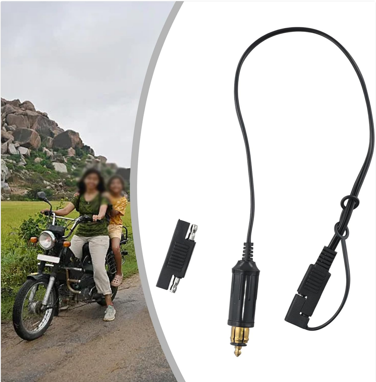
Figure 4.2: Another view showing the cable connected to a motorcycle.