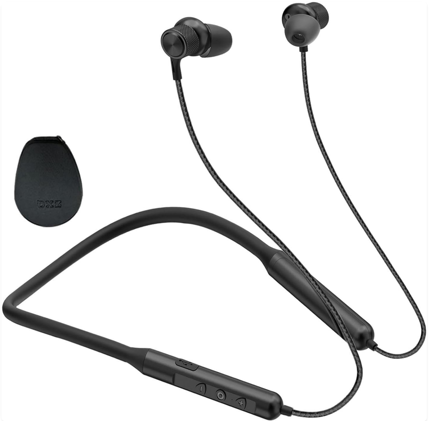
Figure 1: Overview of the ZXQ Neckband Bluetooth Headphones, showcasing the neckband, earbuds, and in-line controls.