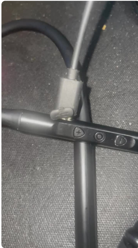
Figure 8: The IPX5 waterproof rating ensures the headphones can withstand sweat and light splashes.