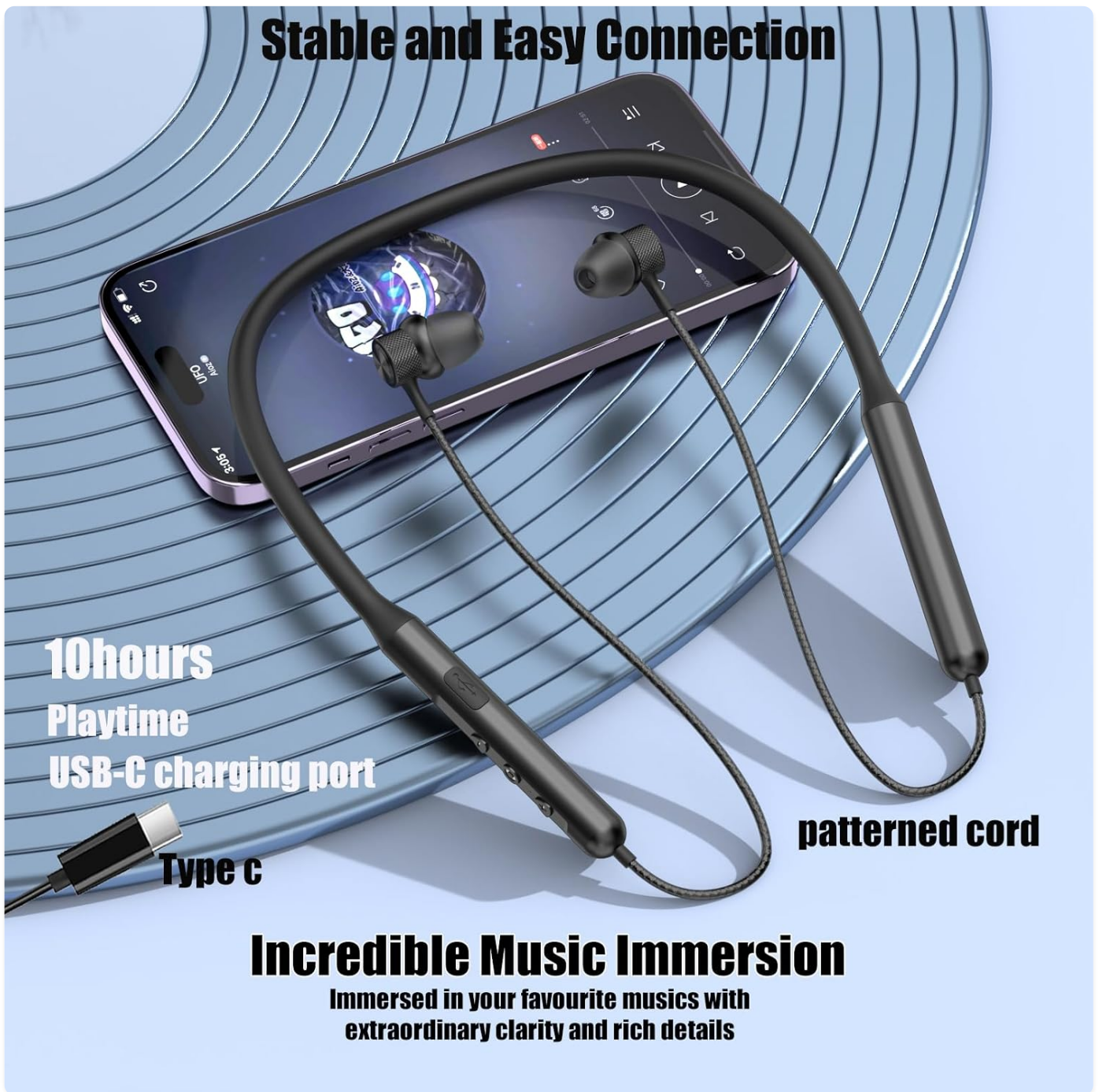
Figure 3: The USB-C charging port and in-line controls on the ZXQ Neckband Bluetooth Headphones.