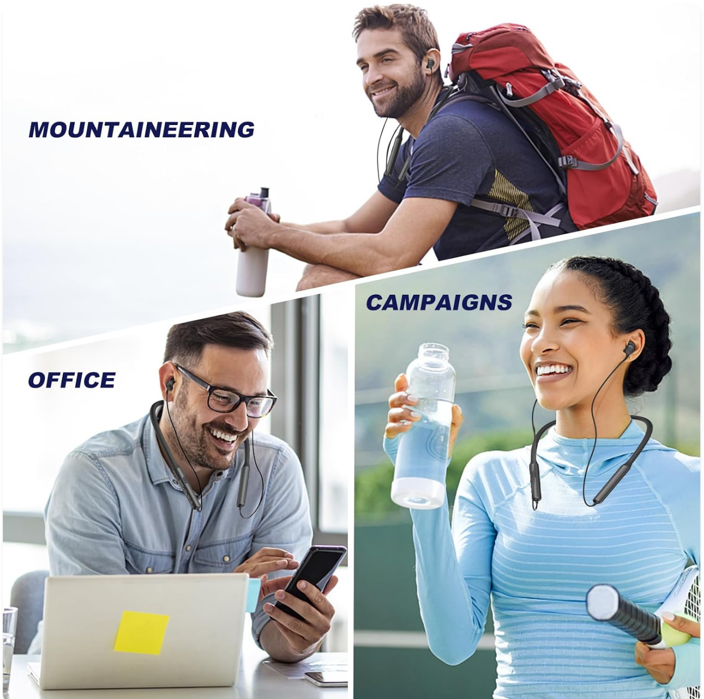
Figure 7: The ZXQ headphones are suitable for diverse environments, from active sports to quiet office work.

Your browser does not support the video tag.