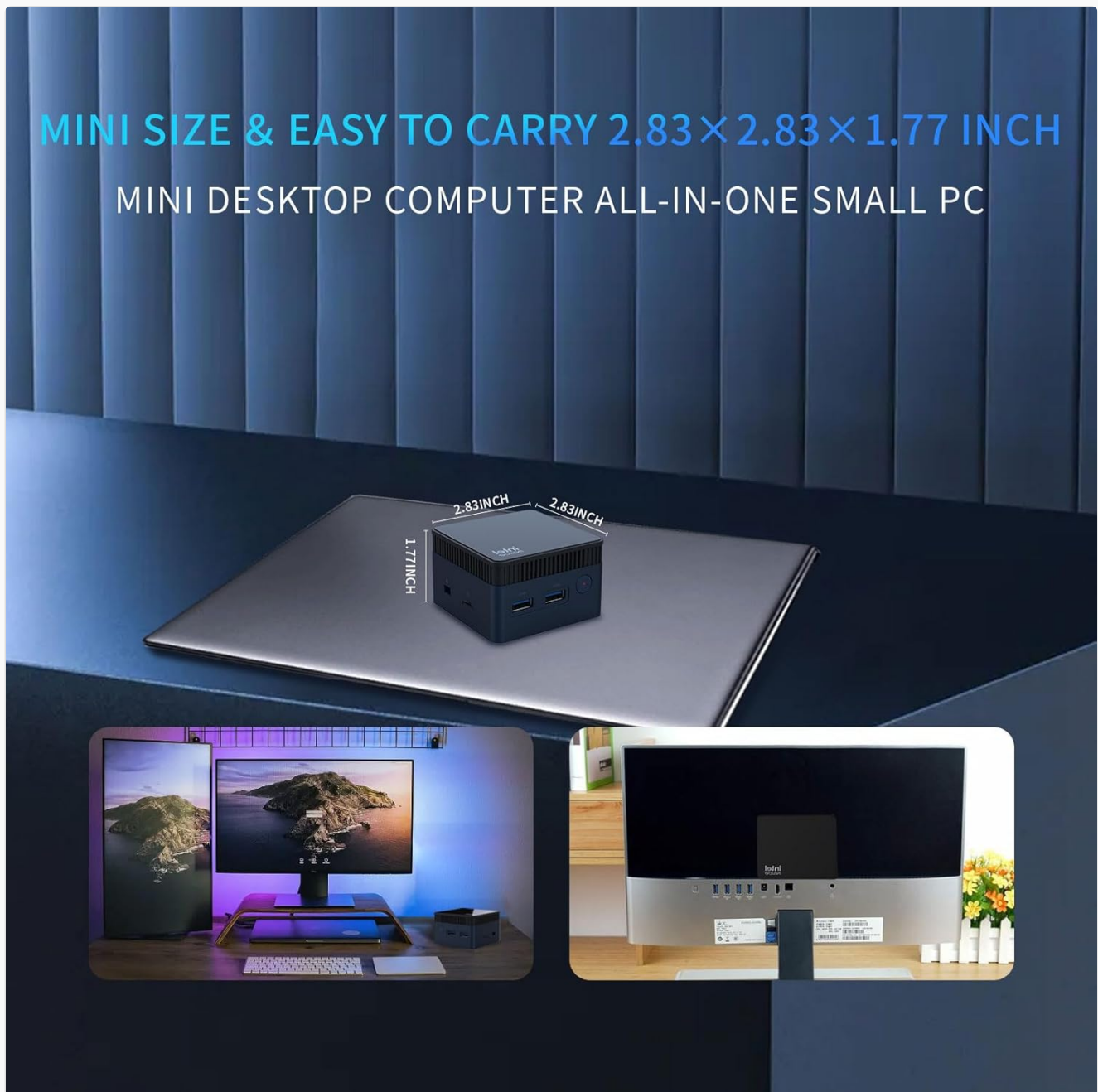
Image: The MOREFINE M6S Mini PC shown next to a laptop, illustrating its compact dimensions of 2.83 x 2.83 x 1.77 inches.

The MOREFINE M6S Mini PC is designed for minimal desk space, measuring approximately 2.83 x 2.83 x 1.77 inches. Its small footprint allows for easy placement in various environments.