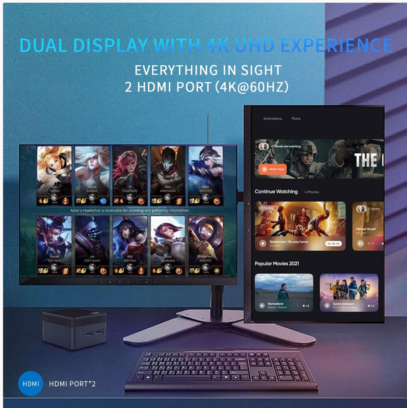
Image: The MOREFINE M6S Mini PC facilitating a dual display setup with two monitors, demonstrating its 4K UHD capability.

The MOREFINE M6S supports dual 4K UHD displays via its two HDMI ports. Connect two monitors to the available HDMI ports. Windows 11 Pro will automatically detect the displays, and you can configure their arrangement and resolution in the Display Settings.