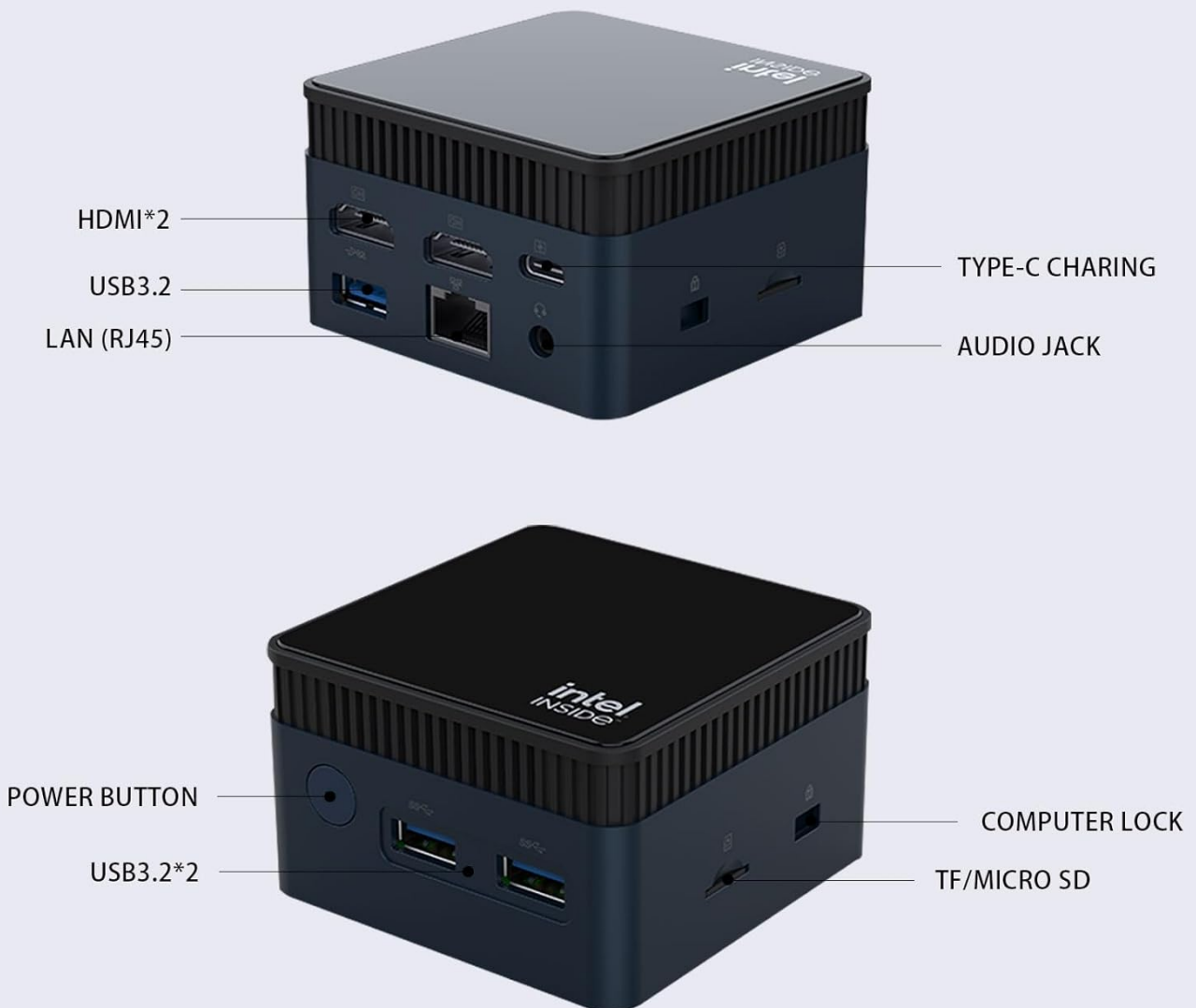
Image: A detailed view of the MOREFINE M6S Mini PC, labeling all available ports including HDMI, USB 3.2, LAN, Type-C, Audio Jack, and TF/Micro SD slot.