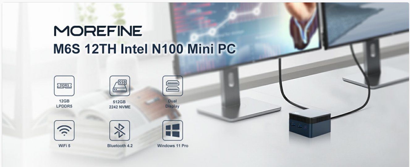
Image: Overview of the MOREFINE M6S Mini PC highlighting its compact design and core specifications.

This manual provides essential information for setting up, operating, and maintaining your MOREFINE M6S Mini PC. The MOREFINE M6S is a compact computing device designed for various applications, from everyday tasks to light productivity and entertainment. It features a 12th Gen Intel Alder Lake N100 processor, 12GB LPDDR5 RAM, and a 512GB NVMe SSD, running on Windows 11 Pro.