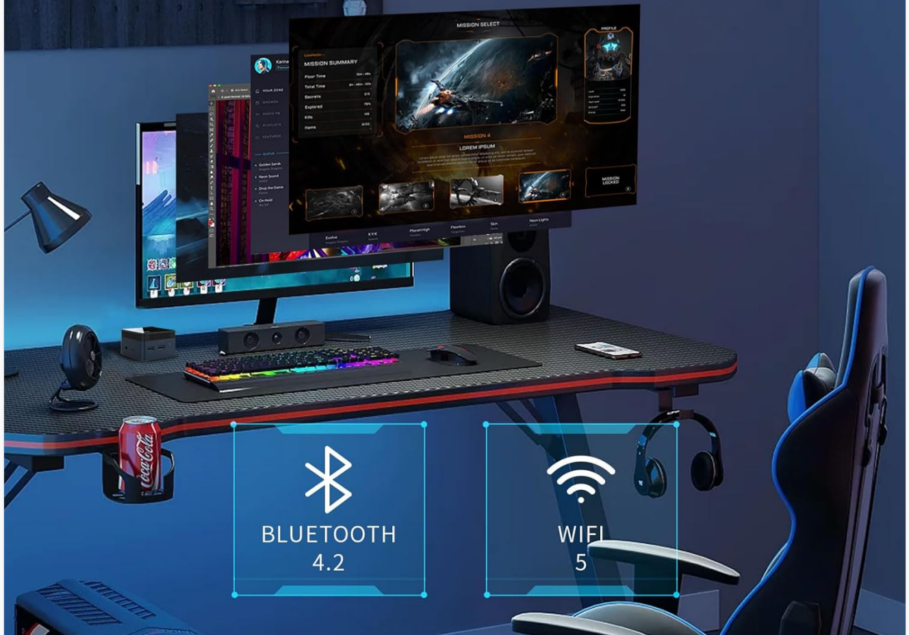
Image: The MOREFINE M6S Mini PC on a desk setup, highlighting its Dual Band Wi-Fi 5 and Bluetooth 4.2 capabilities.

NETWORK GAME, 4K VIDEO, MILD DESIGN, OFFICE SOFTWARE, WEB BORWSING