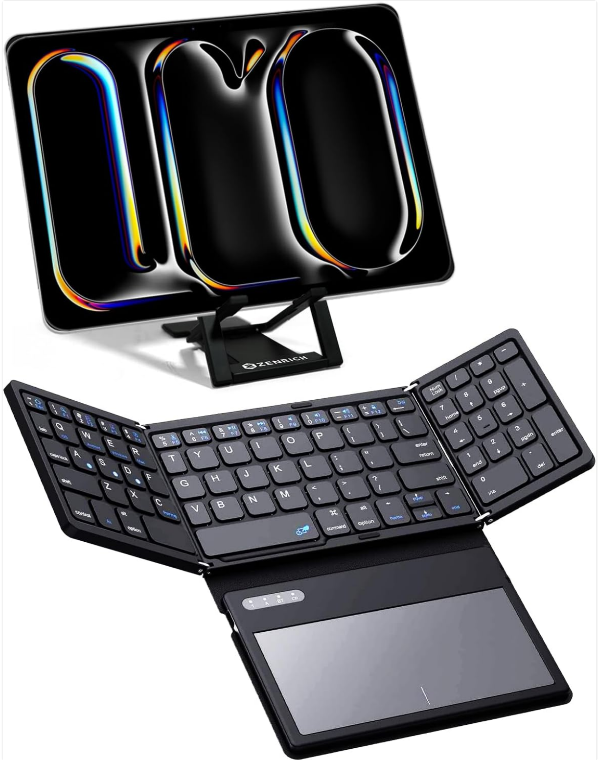
Image 3.1: ZenRich Foldable Bluetooth Keyboard unfolded, shown with the included stand holder supporting a tablet.