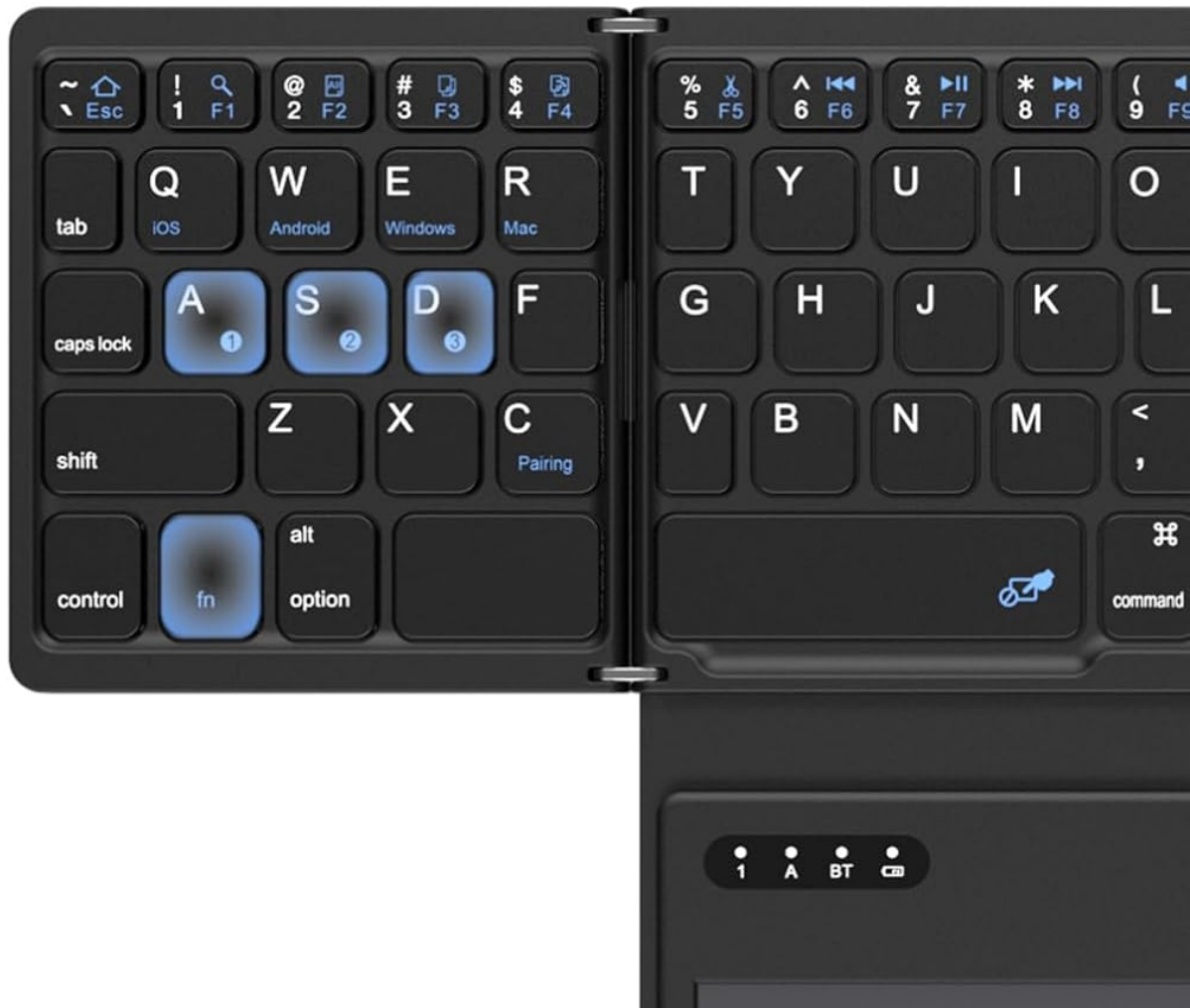
Image 4.2: Diagram illustrating the process of syncing the keyboard with up to three different devices using Fn+1, Fn+2, and Fn+3.