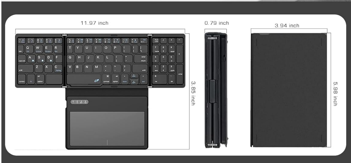
Image 8.1: Detailed dimensions of the ZenRich Foldable Bluetooth Keyboard in both folded and unfolded states.