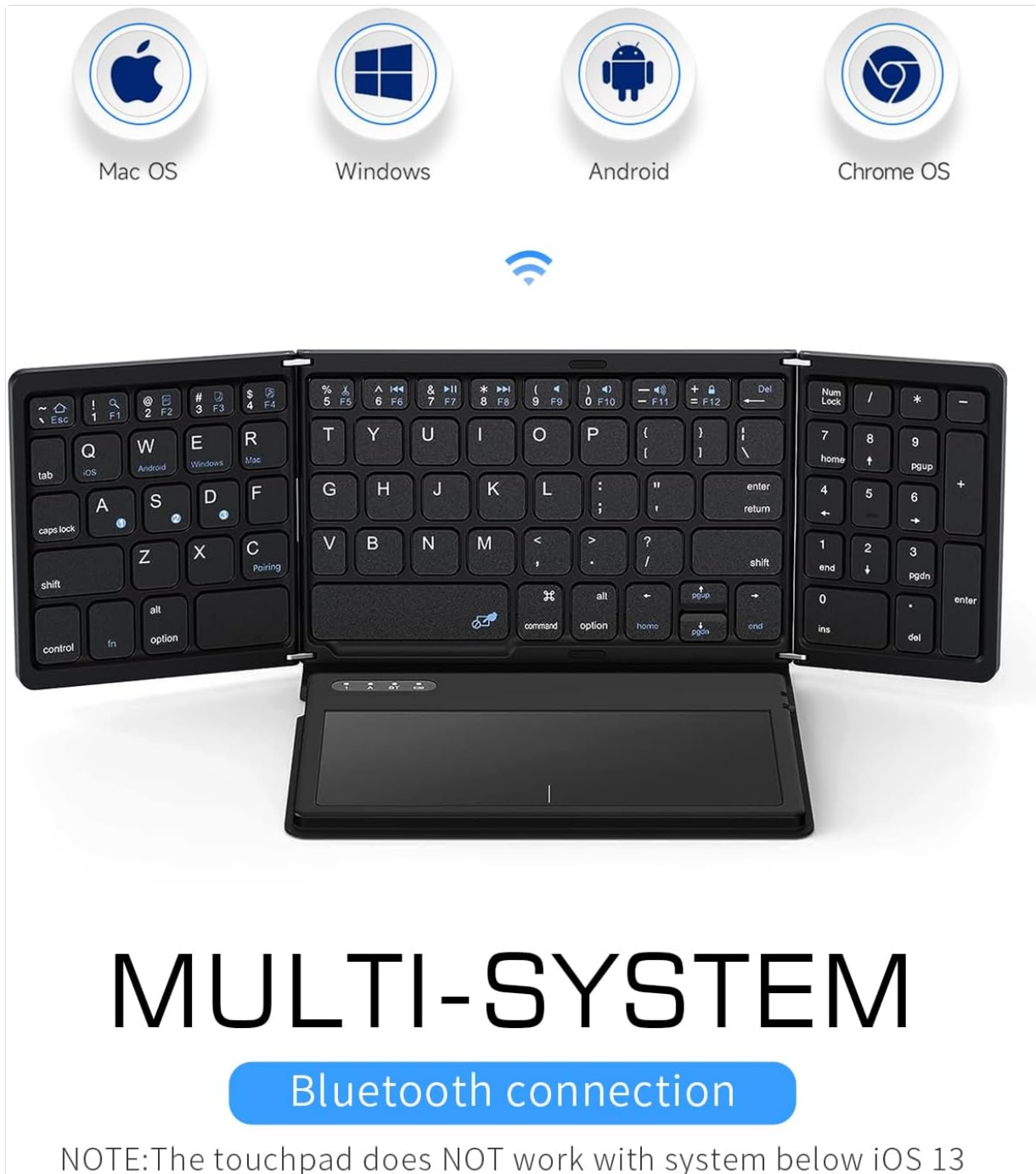
Image 5.1: Visual representation of the keyboard's compatibility with Mac OS, Windows, Android, and Chrome OS, and the note regarding iOS 13+ for touchpad functionality.

Note: The touchpad functionality is not compatible with systems running iOS versions below 13.