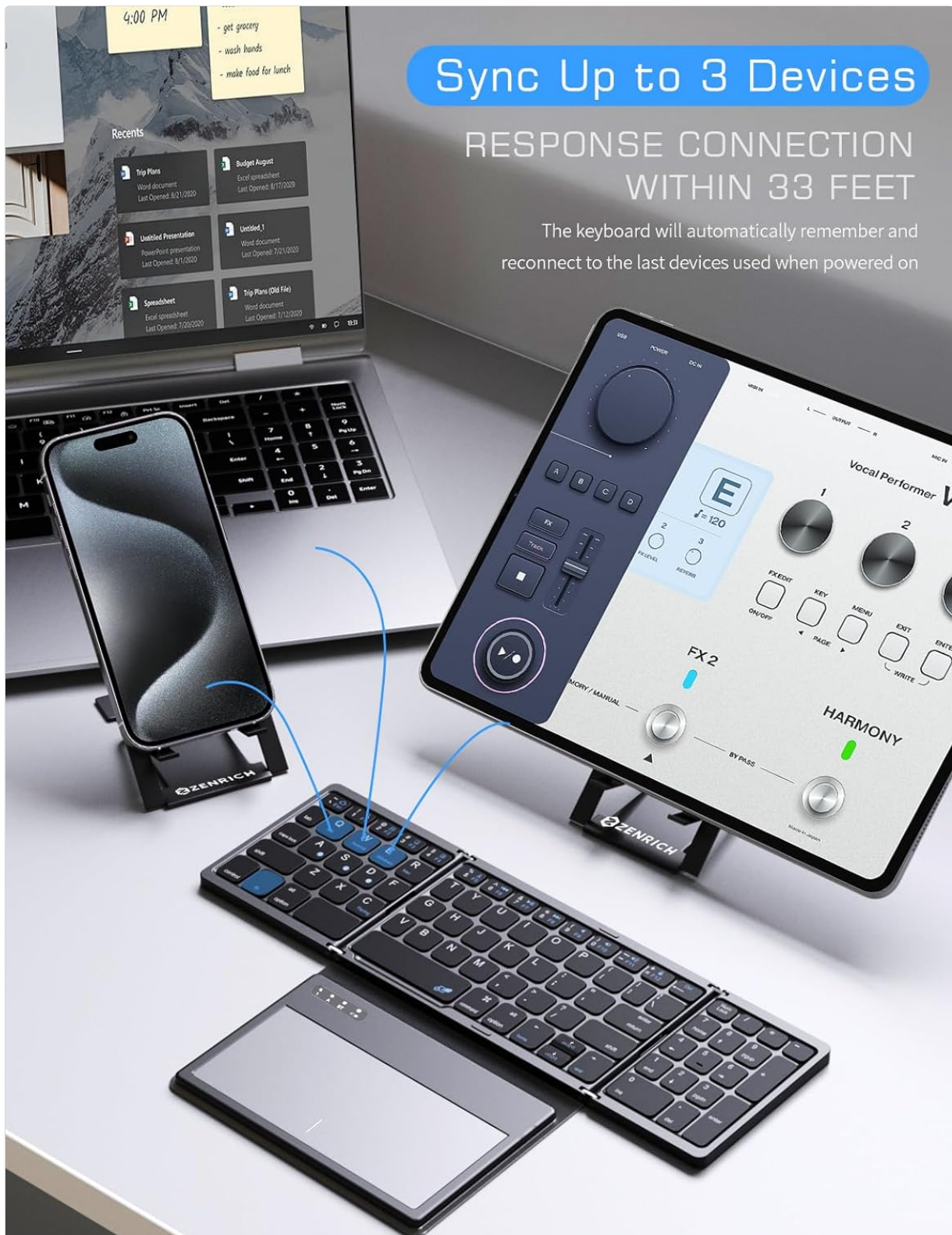
Image 4.3: The keyboard connected to a smartphone, tablet, and laptop, demonstrating its multi-device syncing capability and 33-foot wireless range.