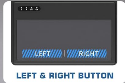
Image 3.2: Close-up view of the keyboard's large touchpad, highlighting the left and right click areas.

Enhanced touchpad provides laptop-like control, improving efficiency without a mouse