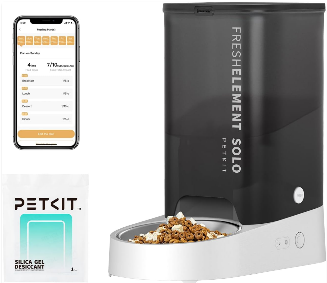
The PETKIT Automatic Pet Feeder unit, ready for initial setup and assembly of its components.