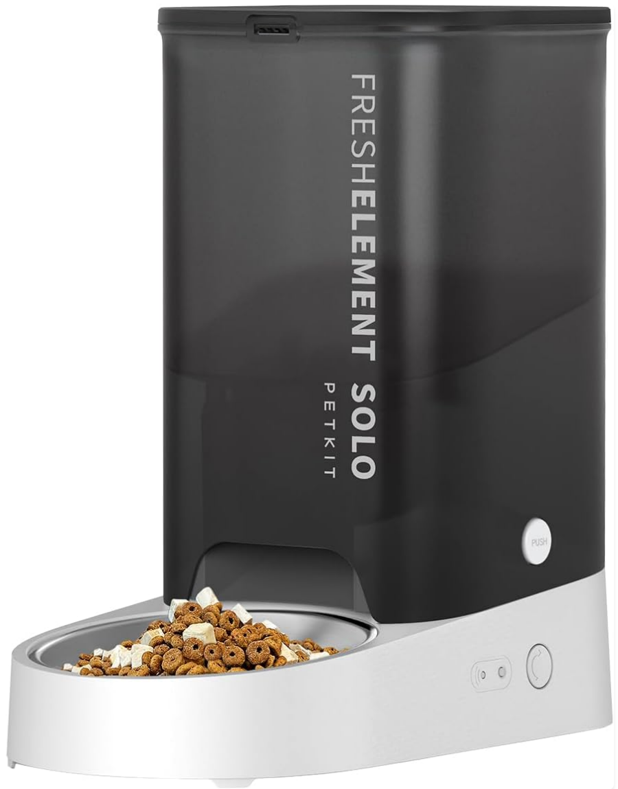
The PETKIT Automatic Pet Feeder in grey, showcasing its sleek design, food reservoir, and stainless steel bowl. An accompanying smartphone screen displays the feeding schedule interface.