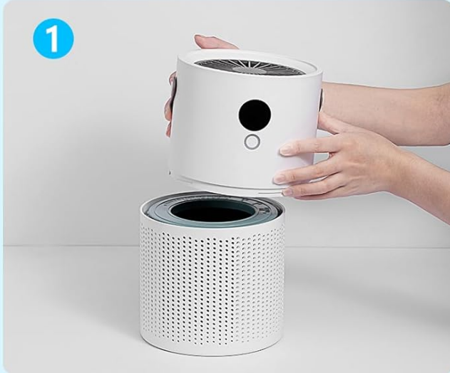
Unscrew the product counterclockwise.