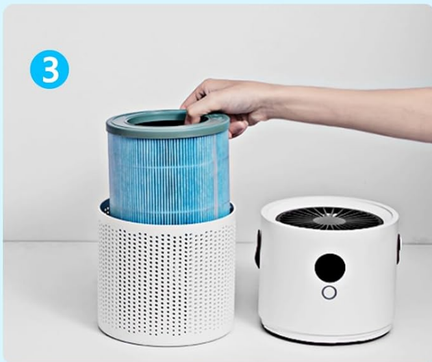
Put into the new filter