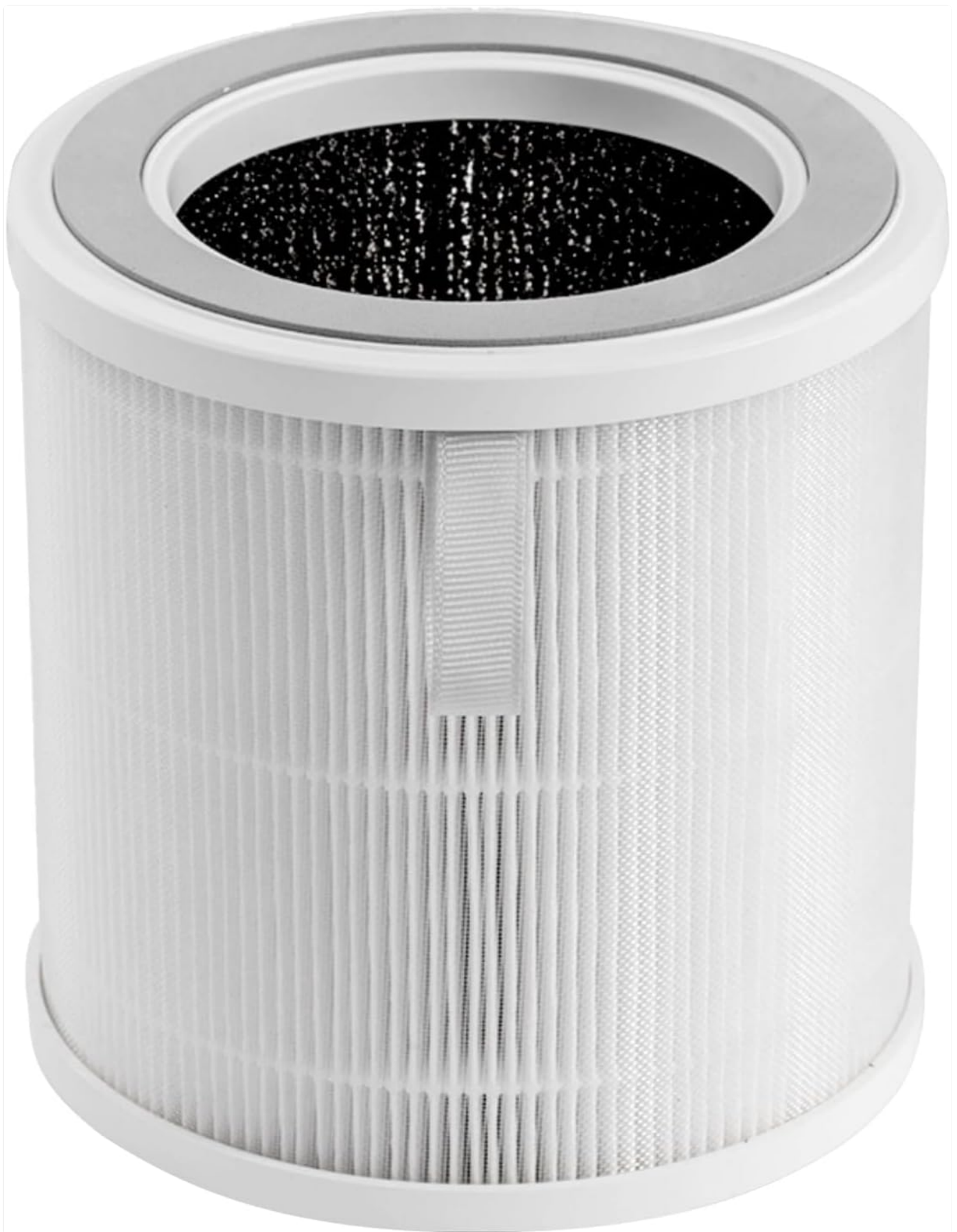
Image: The Sccaty SC-AP012 Replacement Air Filter, showing its cylindrical shape and pleated filter material.