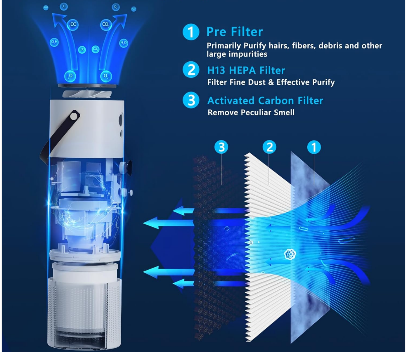
Image: Cross-section diagram of the Sccaty air purifier showing the 360° air intake and the path of air through the multi-layered filter system.

360° Air Purify Cycling & 3-In-1 HEPA Filter