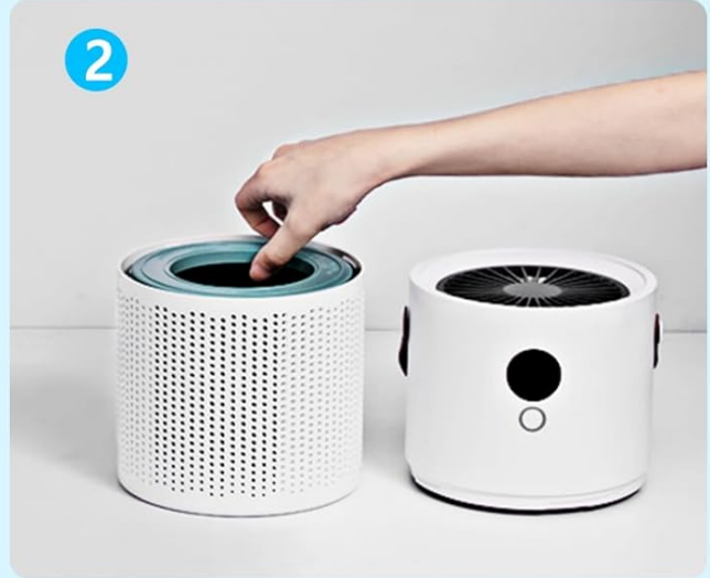
Take out the old filter.