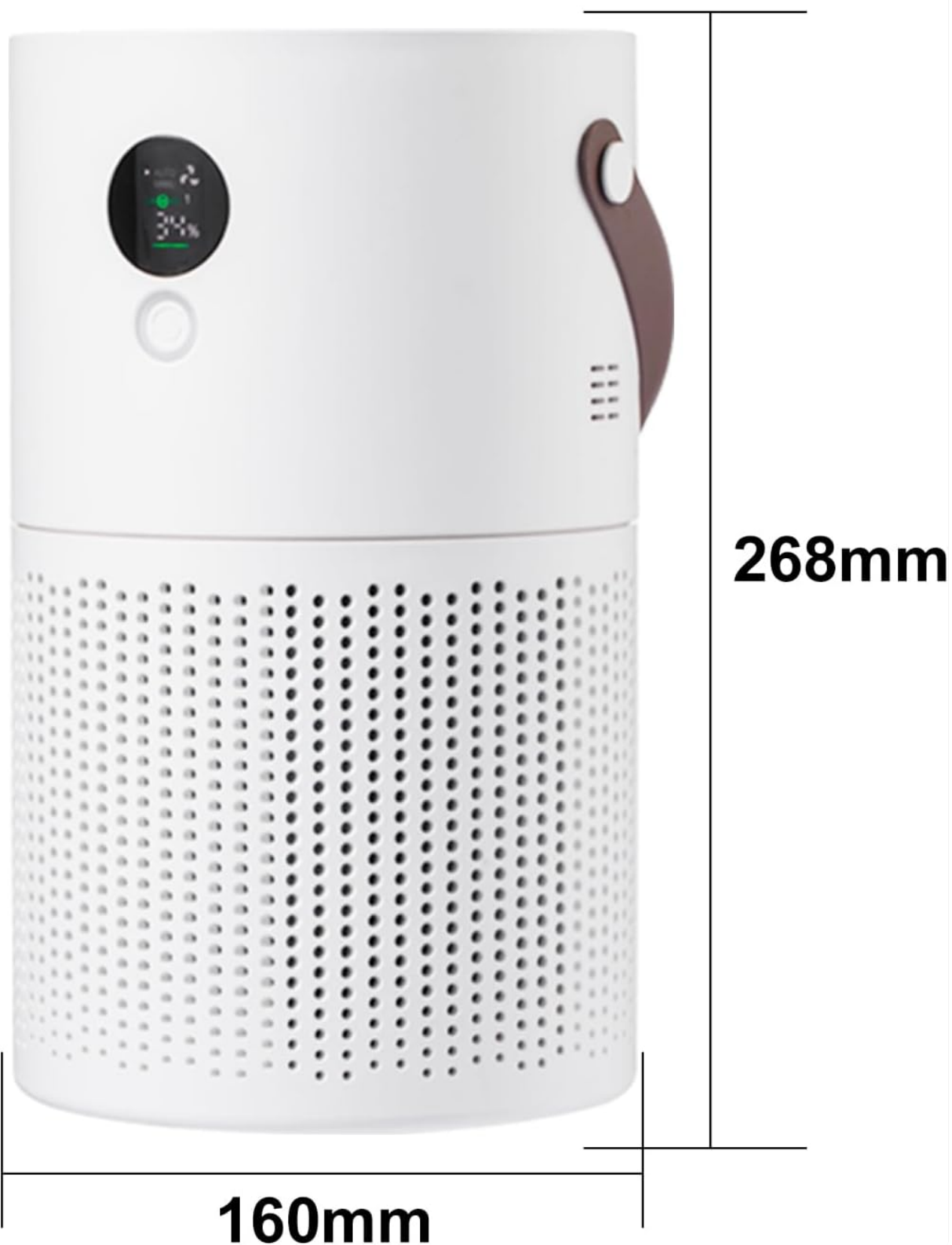
Image: Diagram showing the dimensions of the Sccaty Air Purifier SC-AP002 (160mm width, 268mm height).