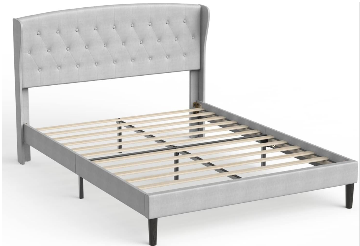
A view of the bed frame's internal structure, highlighting the robust wooden slat system designed to support a mattress without a box spring.