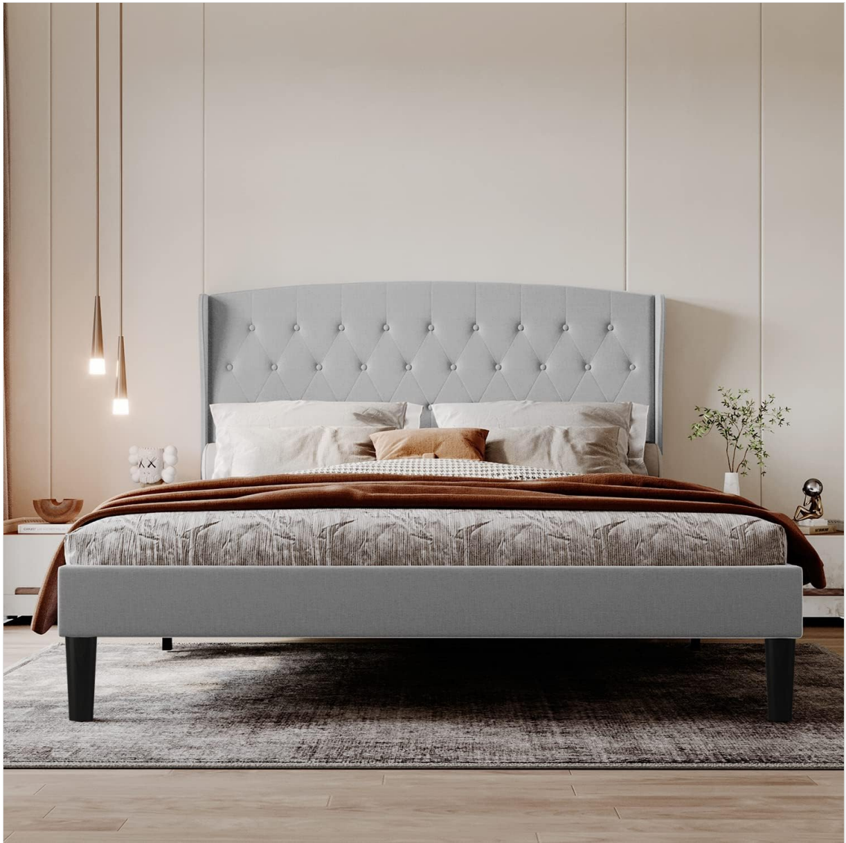
A front perspective of the fully assembled BONSOIR Full Size Bed Frame, illustrating its low-profile design and elegant tufted headboard.