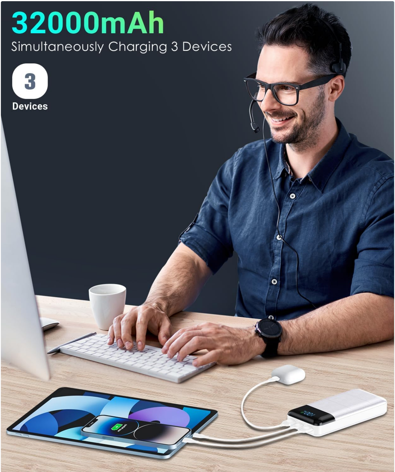
Figure 6.1: Simultaneously charging multiple devices with the power bank.