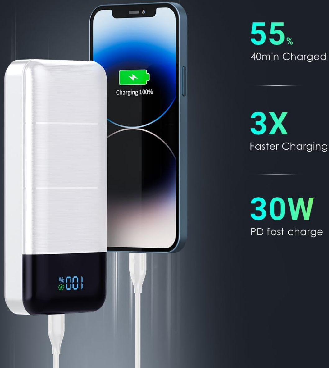
Figure 6.2: Example of 30W PD fast charging performance.

Charge iPhone 14 from 0% to 50% in 30 mins