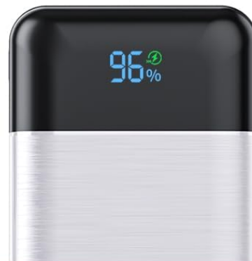
Figure 6.3: The precise LED display showing battery percentage.