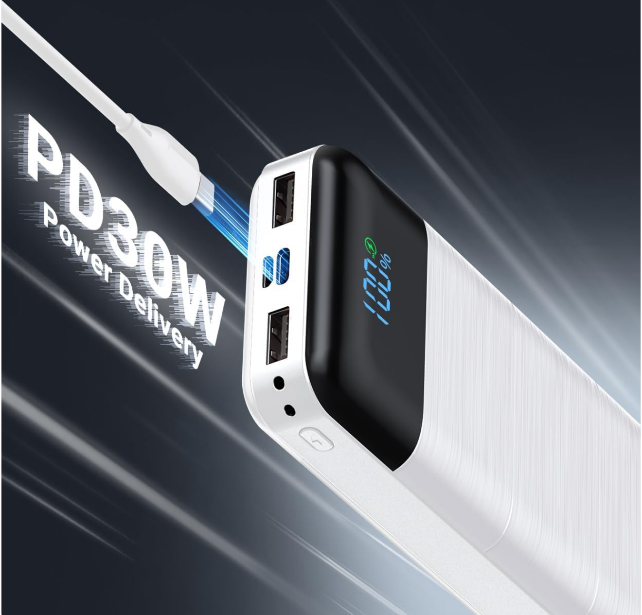
Figure 4.1: Detail of the USB-C input/output port, capable of 30W Power Delivery.

The USB-C port supports both input and output, provides a powerful charge up to 30W