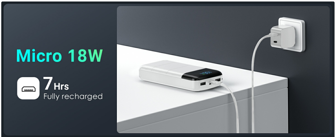
Figure 5.2: Recharging the power bank using the Micro USB port.