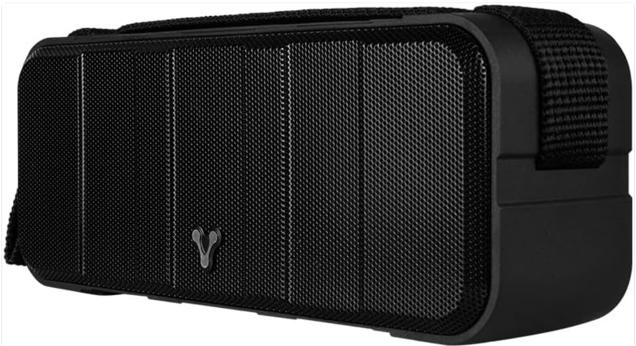
Figure 1.2: Angled view of the speaker, highlighting its robust, rectangular design and integrated carrying strap.