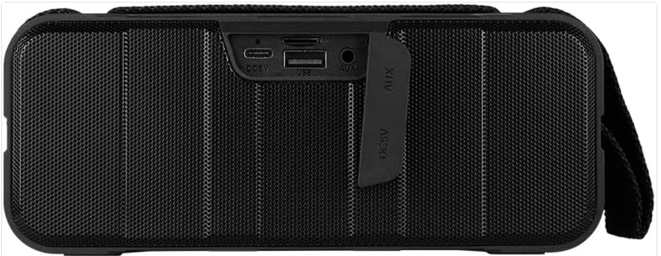
Figure 1.4: Rear view of the speaker, showing the protective flap covering the input ports.