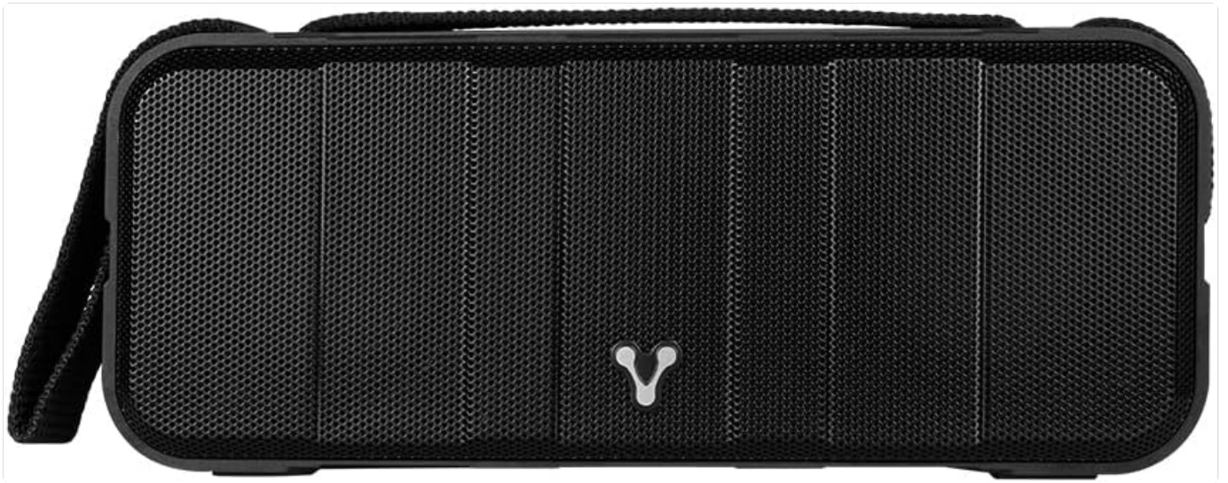
Figure 1.1: Front view of the Vorago BSP-500-V2 Bluetooth speaker, showcasing its mesh grille and central Vorago logo.