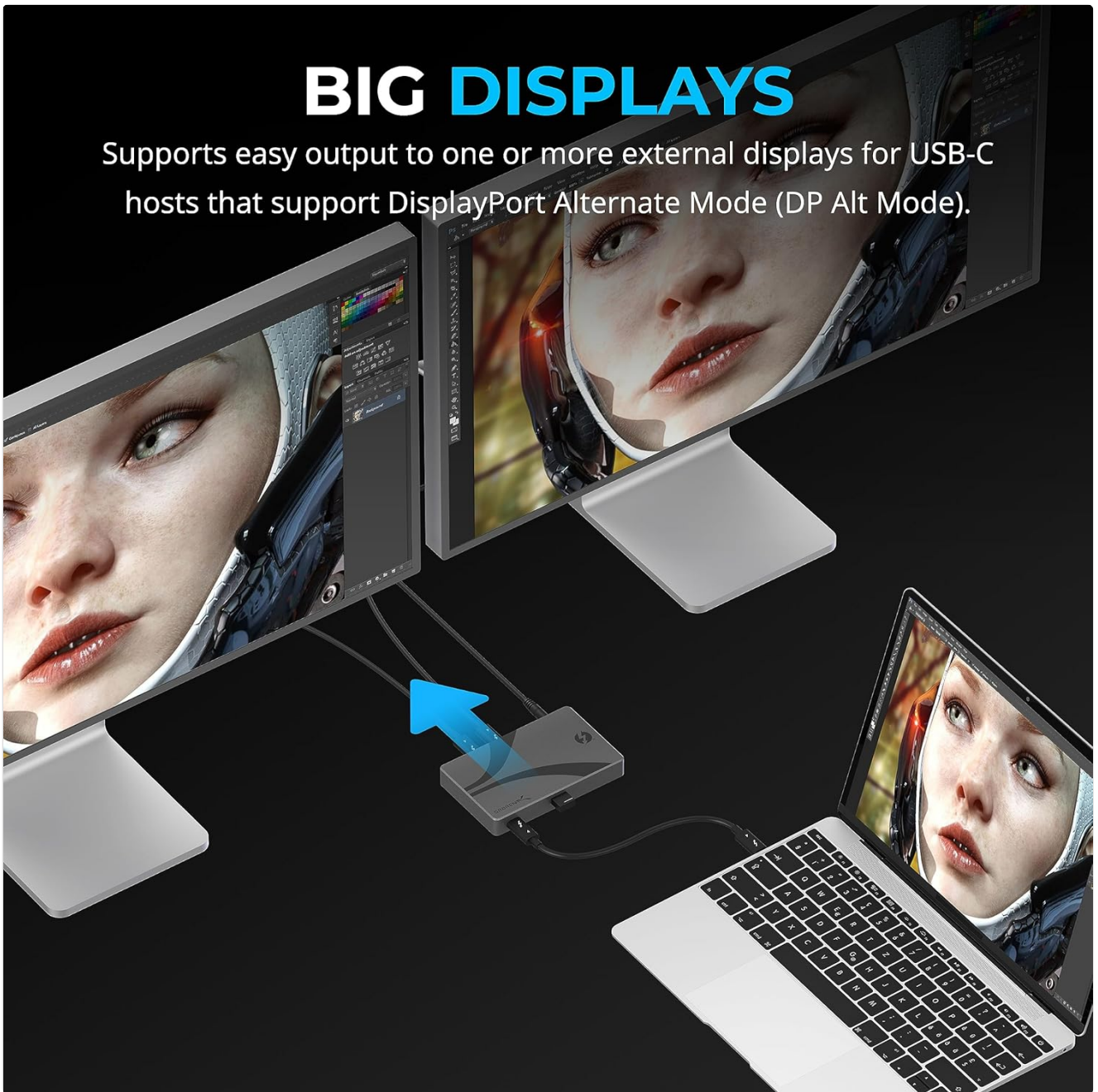
Image: The Thunderbolt 4 Hub connected to a laptop via a Thunderbolt cable, with an external monitor also connected to the hub, demonstrating a typical setup.

Supports easy output to one or more external displays for USB-C hosts that support DisplayPort Alternate Mode (DP Alt Mode).