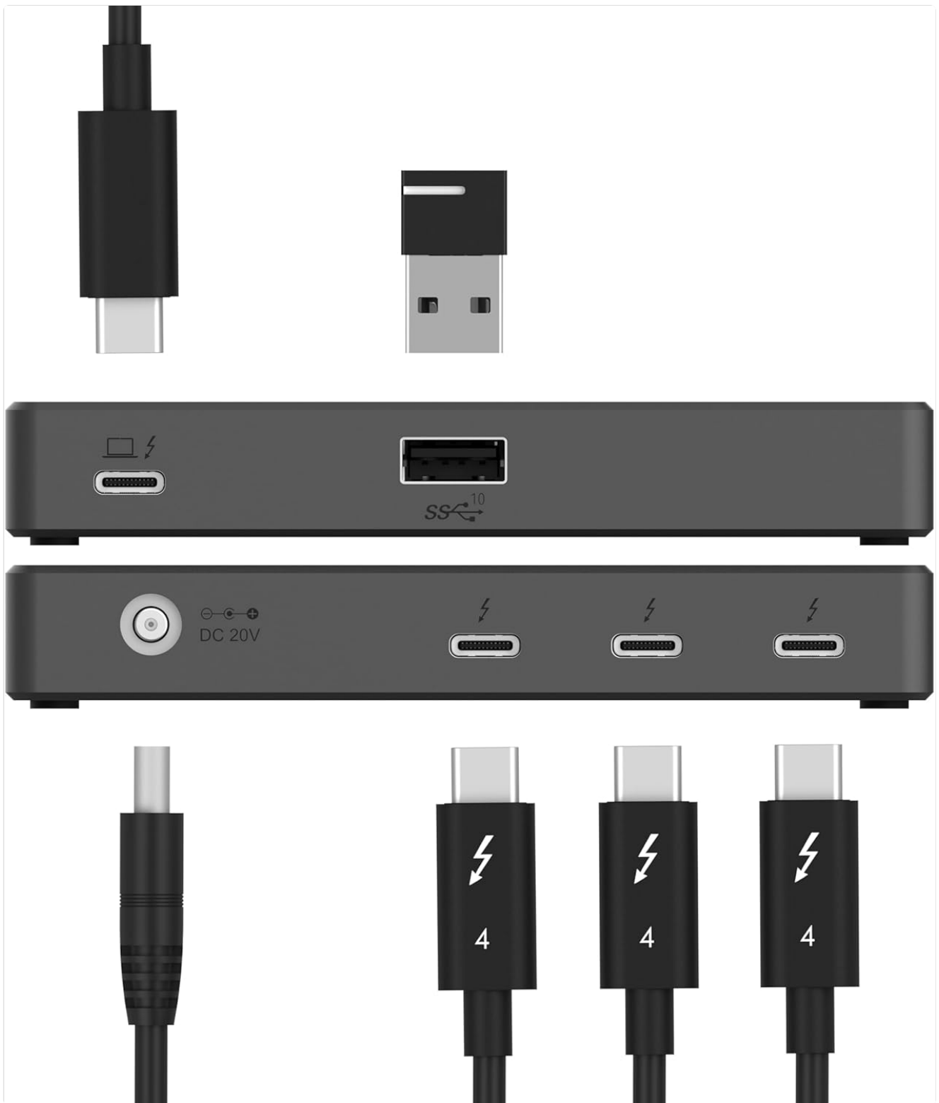
Image: The SABRENT Thunderbolt 4 Hub shown with its included Thunderbolt 4 cable and power adapter, along with a USB-A to USB-C adapter.