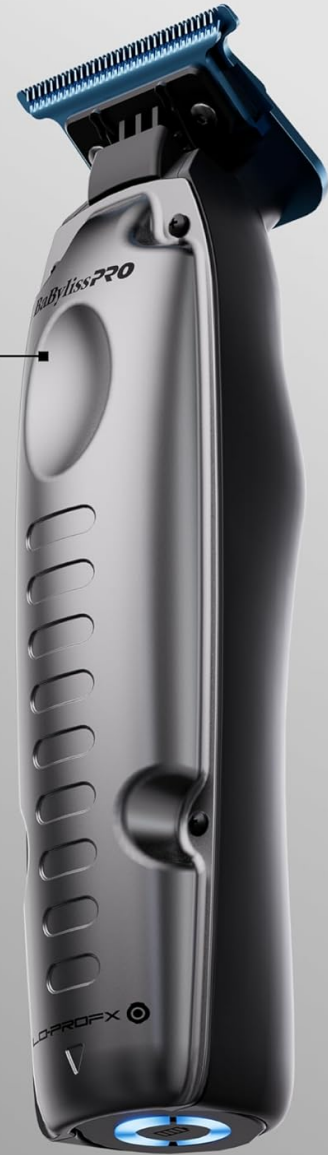
Figure 2.5: Depiction of the Upgraded N1 Brushless Motor