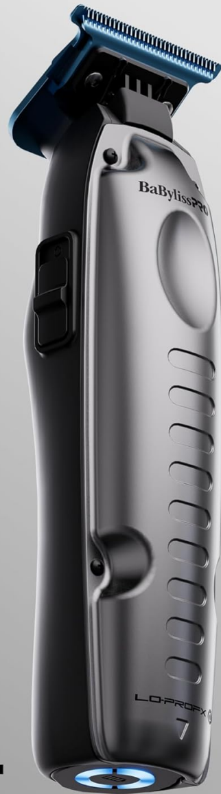
Figure 2.4: Ergonomic Finger Rest and Quick Battery Release Button

Quick battery release button for easy swapping of FXONE batteries