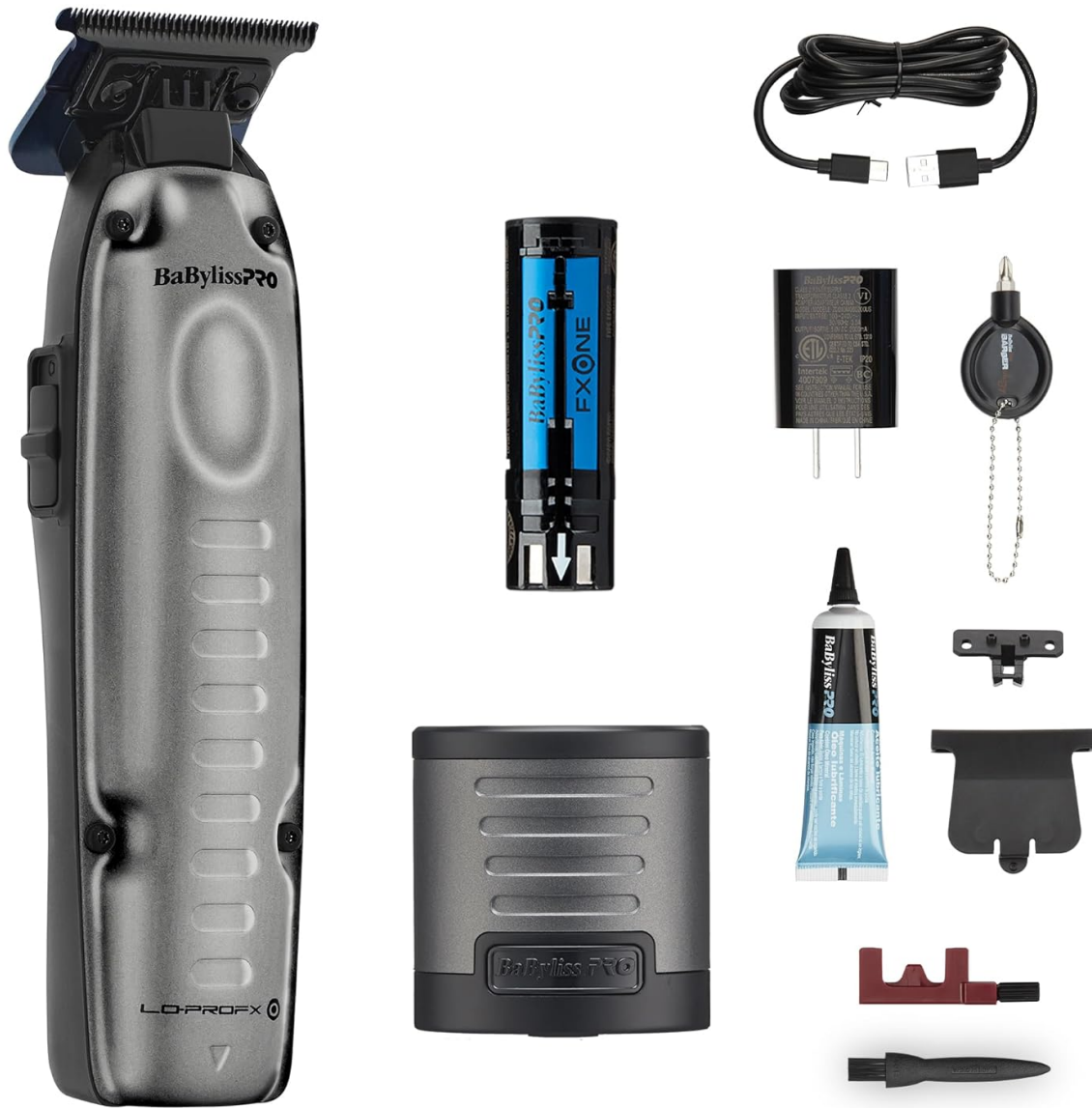
Figure 2.1: BaBylissPRO FXONE LO-PROFX Trimmer and Included Accessories