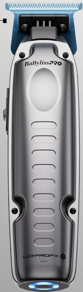
Figure 2.2: Close-up of the Blue DLC/Titanium Standard-Tooth T-Blade