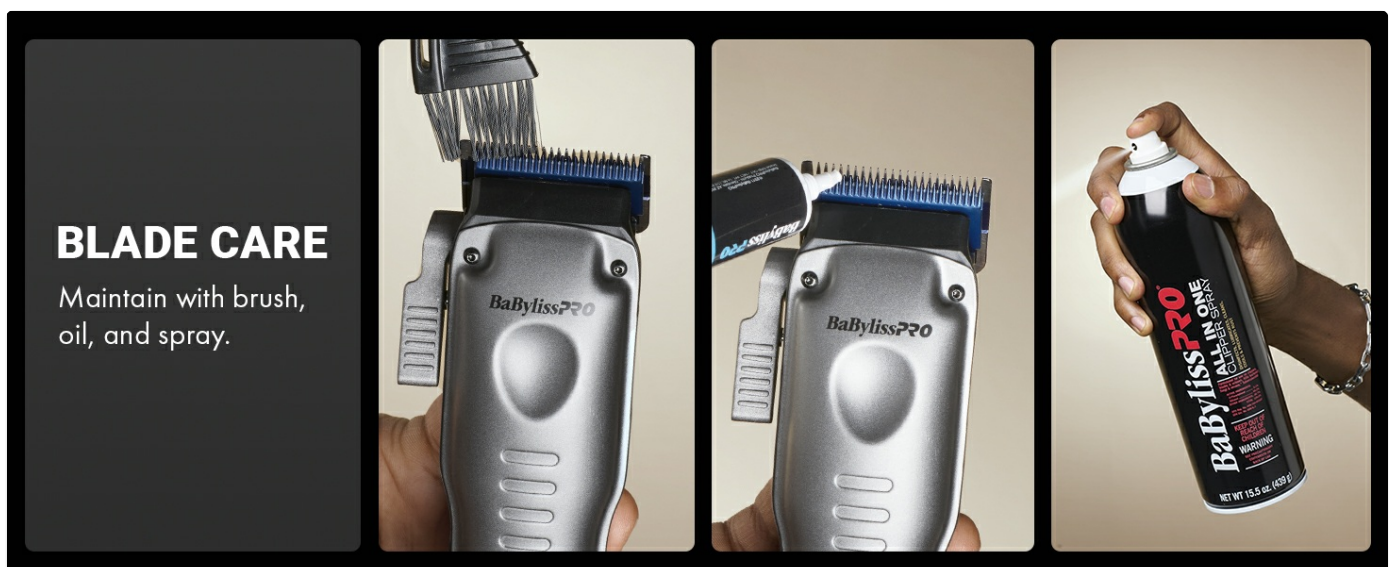
Image: A sequence of images demonstrating blade care: brushing off hair, applying lubricating oil, and using a blade spray.

Regular cleaning and oiling are crucial for maintaining the performance and longevity of your clipper blades. The MIM blade features built-in oil reservoirs to reduce friction and lower blade temperature.