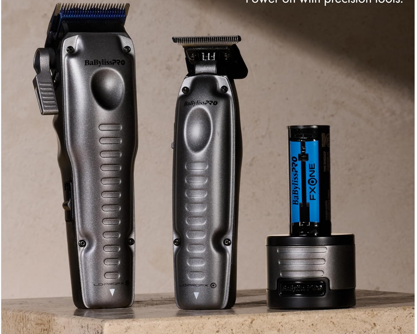
Image: The package contents include the clipper, cleaning brush, 6 clipper guards, screwdriver, lubricating oil, charging cord, battery-charging stand, FXONE battery, and blade cover.