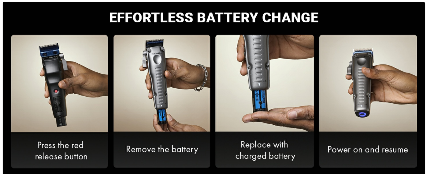
Image: A four-panel image illustrating the steps to change the battery: press the red release button, remove the battery, replace with a charged battery, and power on.

The FXONE LO-PROFX Clippers feature an innovative interchangeable battery system, ensuring continuous operation. The battery can be easily removed and charged separately.