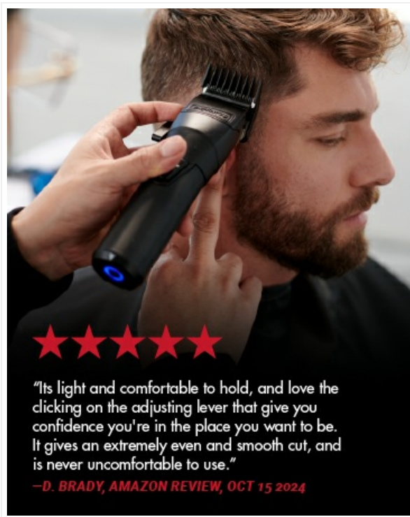
Image: A hand demonstrating the ergonomic design of the BaBylissPRO FXONE clipper, emphasizing the knurled handle and finger rest for comfortable use.