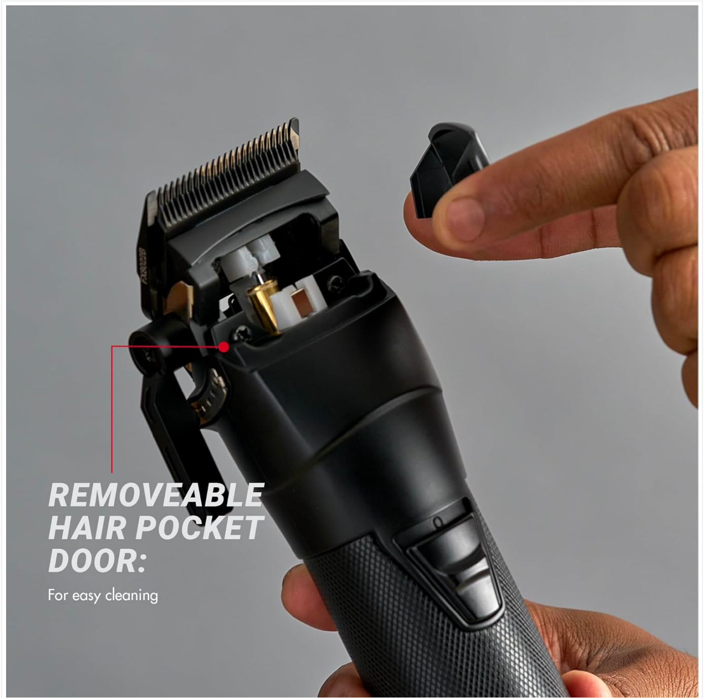
Image: The BaBylissPRO FXONE clipper with its removable hair pocket door opened, illustrating the ease of access for cleaning the internal components and removing trapped hair.