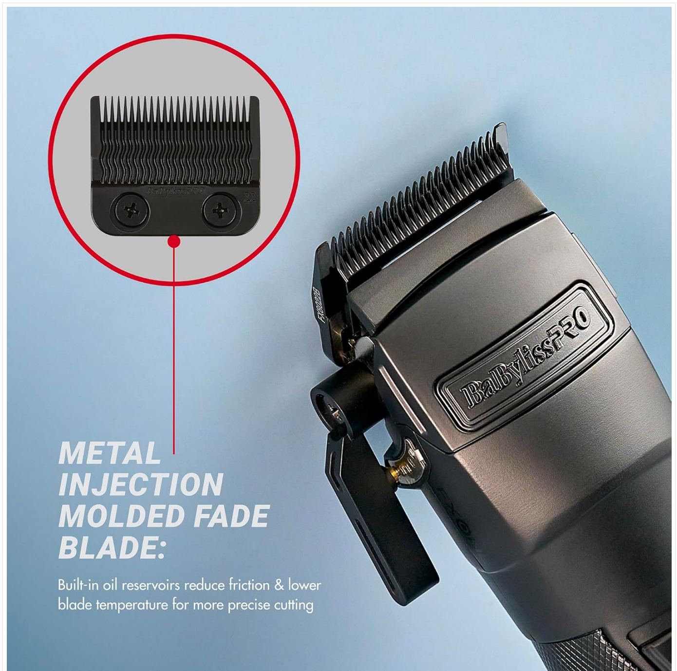
Image: A detailed view of the BaBylissPRO FXONE clipper's metal injection molded fade blade, highlighting its design for precise cutting.