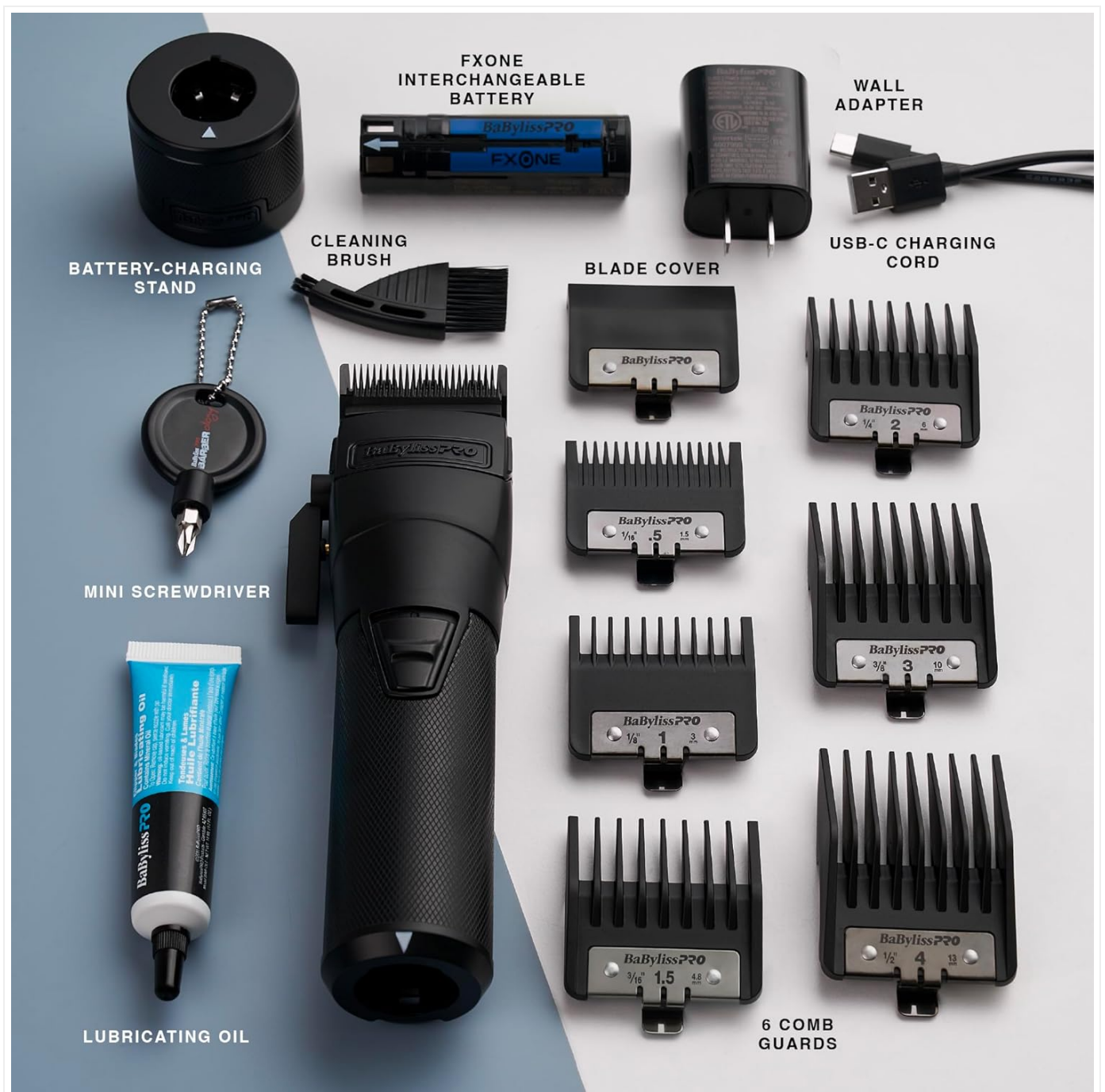
Image: All components included in the BaBylissPRO FXONE Professional Cordless Clipper package, including the clipper, battery, charging stand, various comb guards, and maintenance tools.