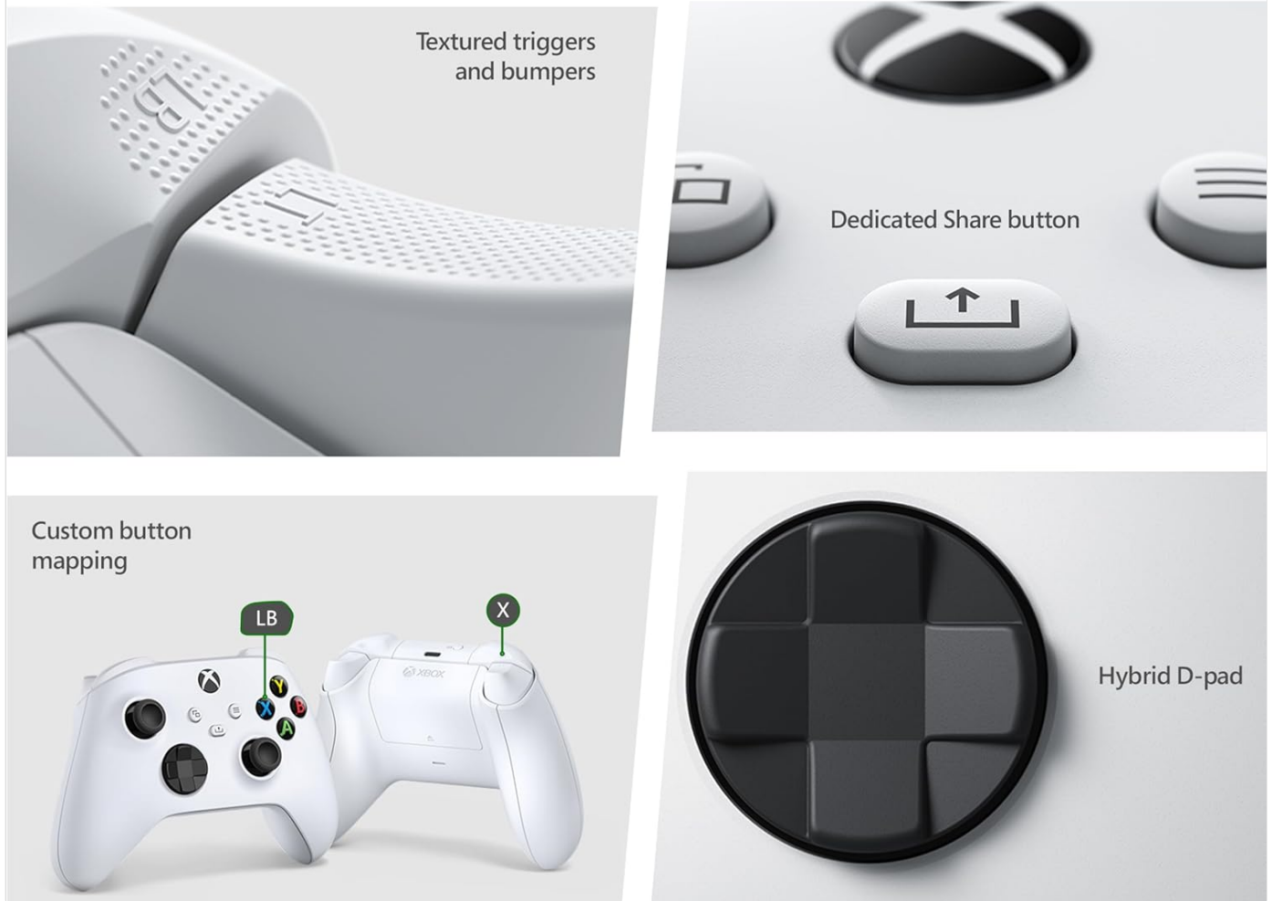
Figure 3: Key features of the included Xbox Wireless Controller.

Elegant design , refined comfort , and instant sharing to a familiar favorite