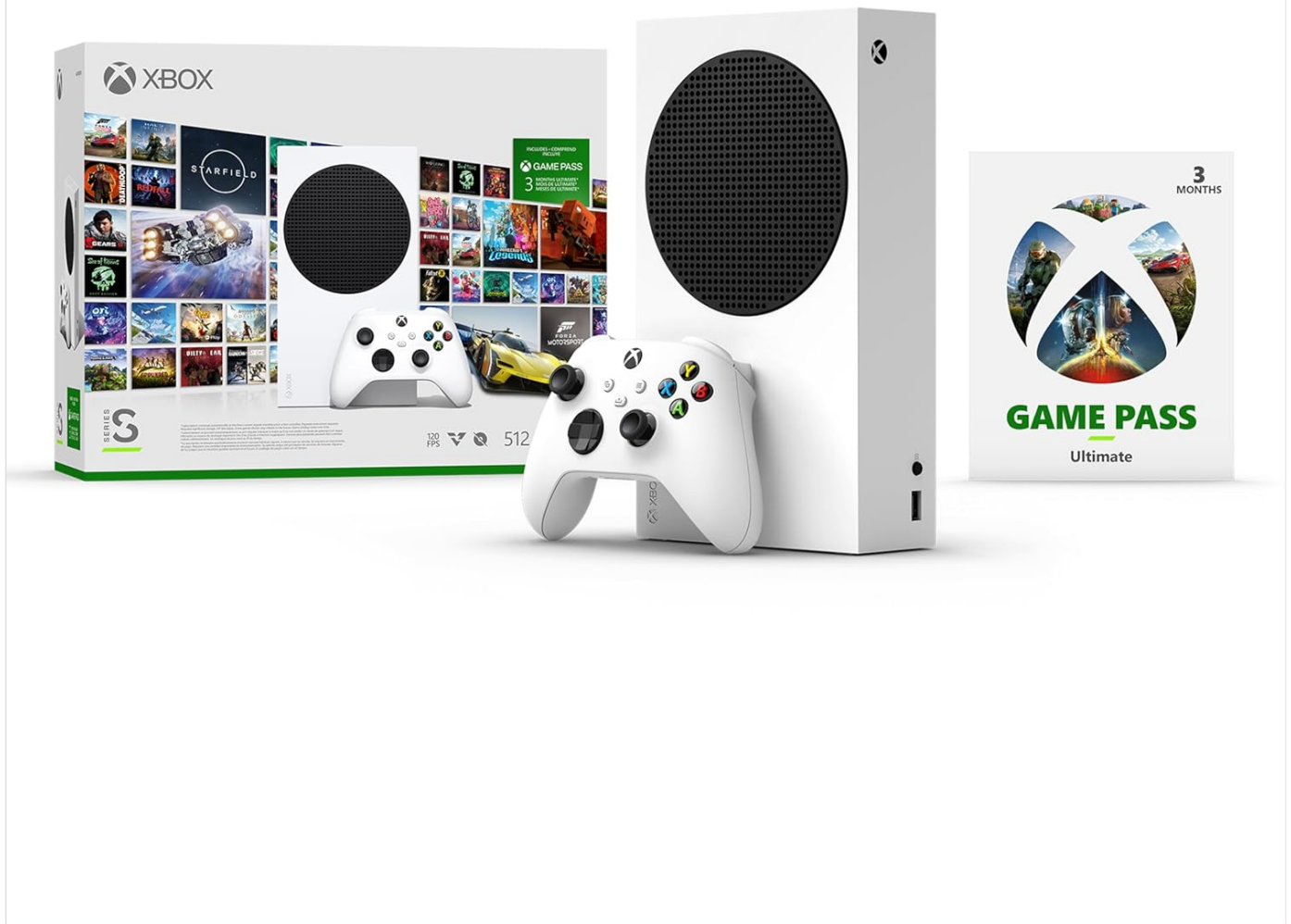
Figure 1: Xbox Series S Starter Bundle contents.