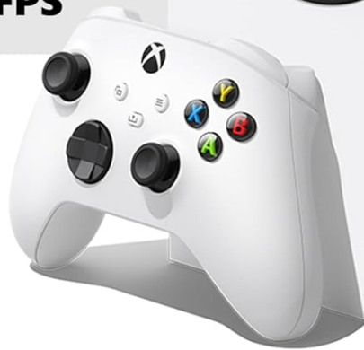
Figure 2: Visual representation of Xbox Series S core features.

The Xbox Series S delivers next-gen speed and performance. It features a 512GB custom SSD, enabling significantly faster load times. Experience gameplay of up to 120 FPS, powered by the innovative Xbox Velocity Architecture, which optimizes game assets for rapid streaming and processing.