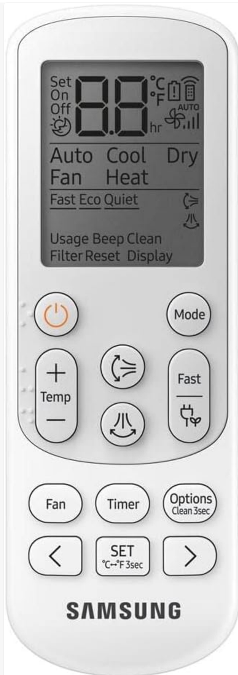
Figure 2: The remote control for your Samsung WindFree Connect Air Conditioner. It allows access to all primary functions and settings.