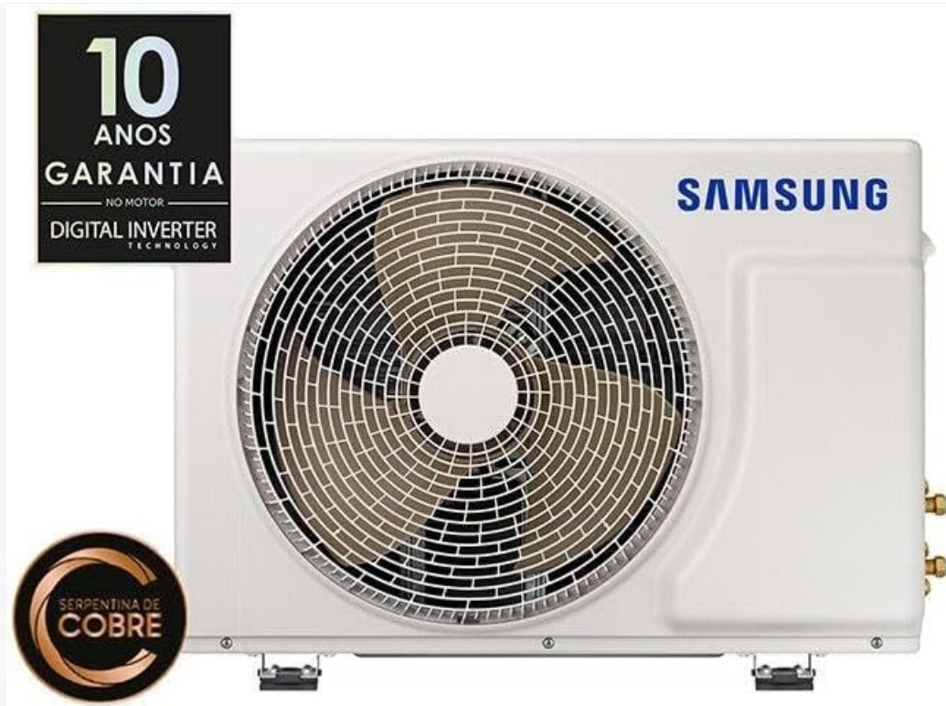
Figure 5: The outdoor unit highlighting the 10-year warranty on the Digital Inverter Motor Technology.

Your Samsung WindFree Connect Air Conditioner comes with a 10-year warranty on the Digital Inverter Motor Technology . For specific warranty terms and conditions, please refer to the warranty card included with your product or visit the official Samsung website.