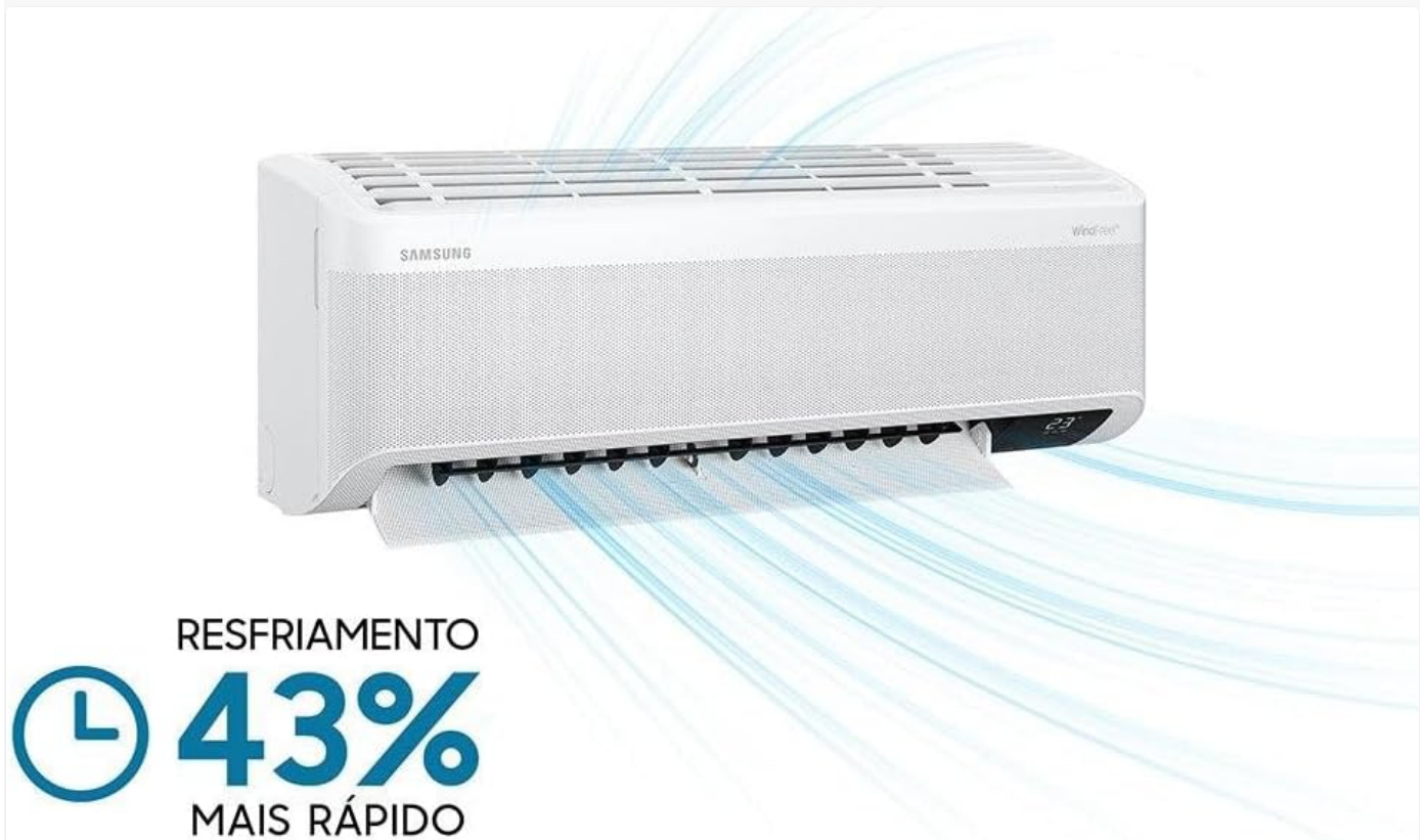
Figure 3: The WindFree Connect unit features fast cooling capabilities, reducing room temperature efficiently.