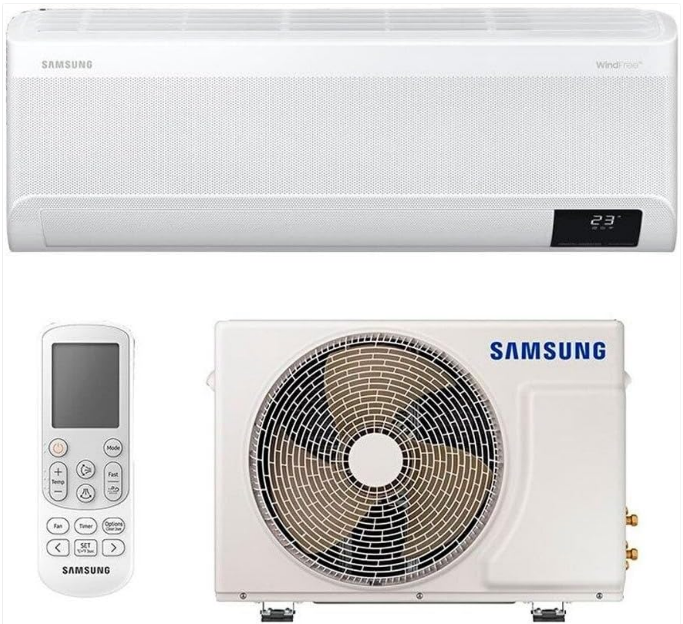
Figure 1: Overview of the Samsung WindFree Connect Air Conditioner, showing the indoor unit, outdoor unit, and remote control.