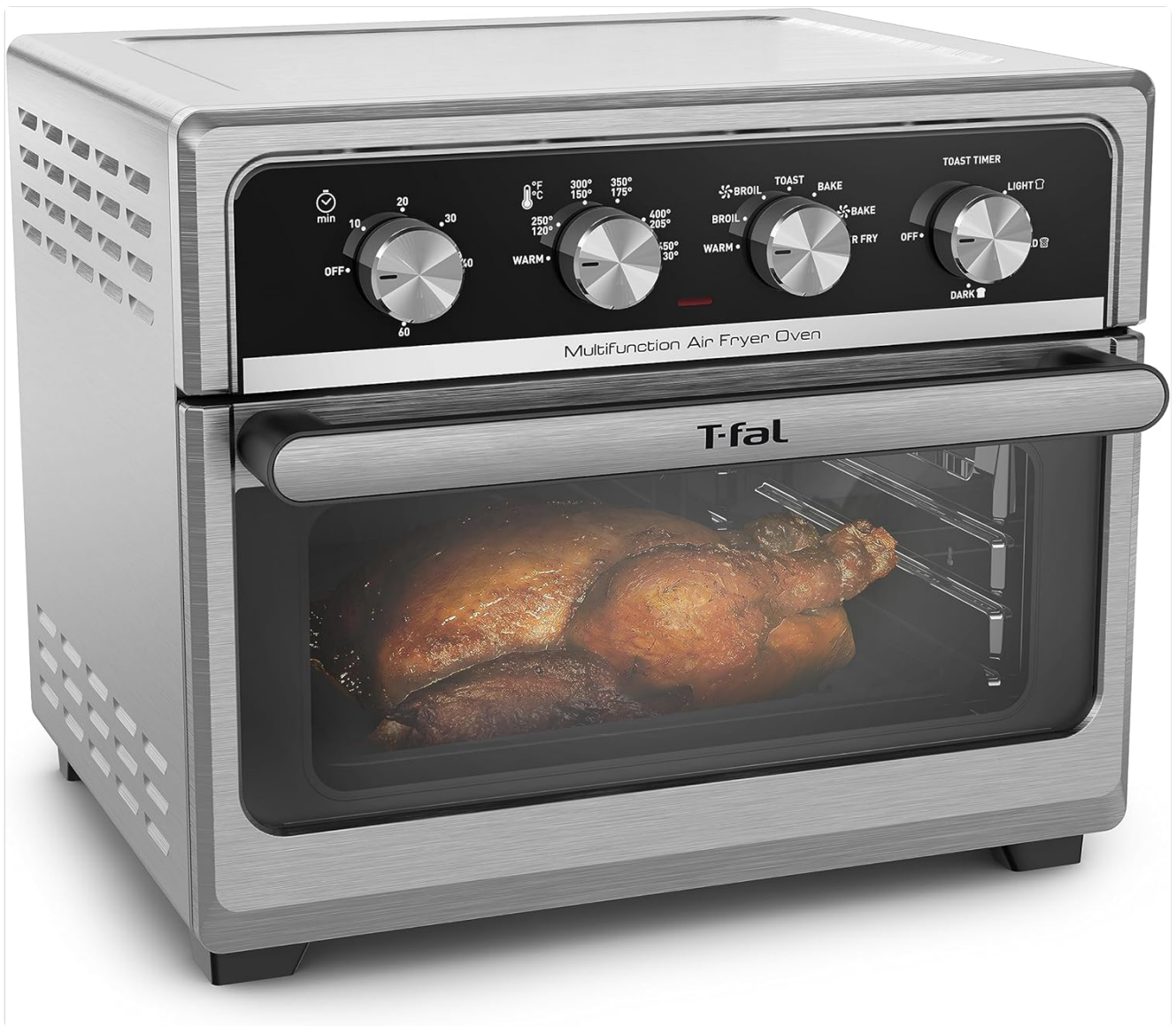
Figure 1: T-fal 9-in-1 Toaster Oven Air Fryer Combo, front view.