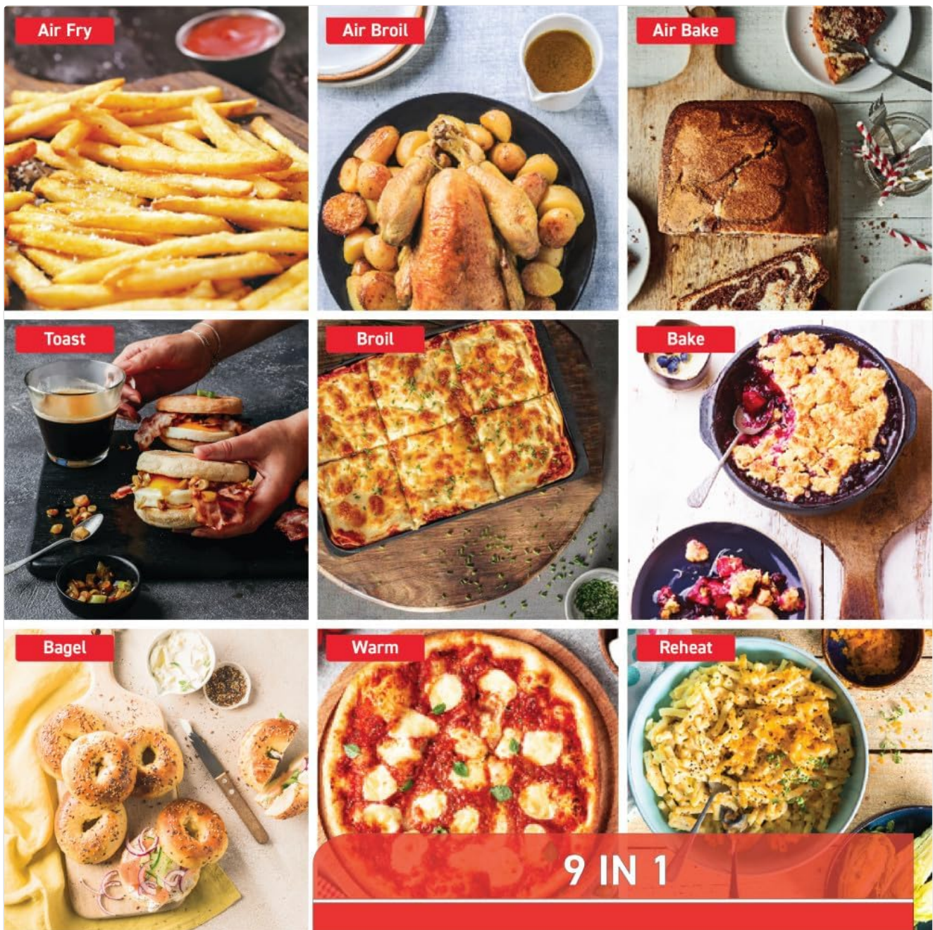
Figure 3: Visual representation of the 9 cooking functions.