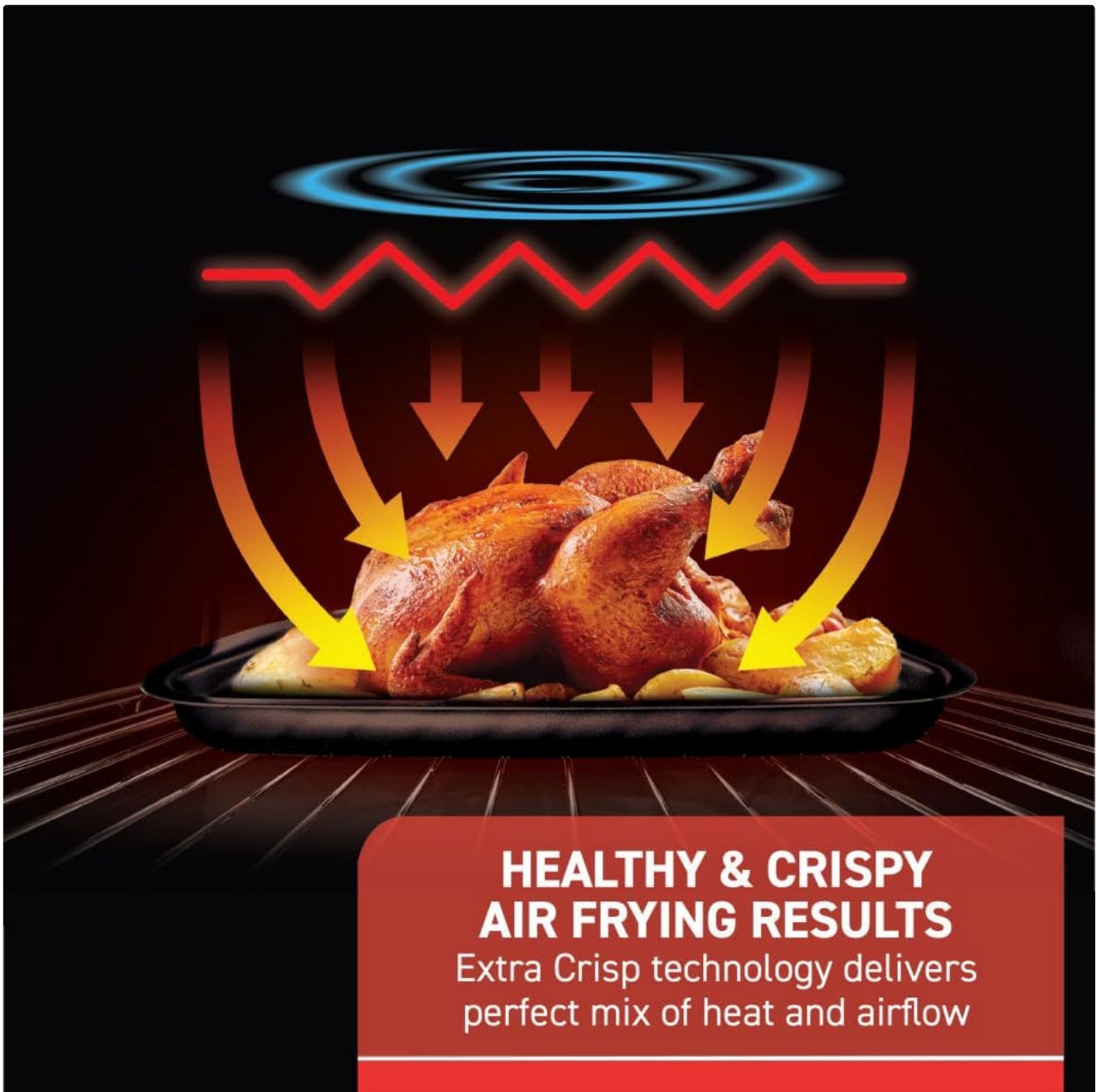
Figure 4: Diagram illustrating the Extra Crisp technology for optimal airflow.