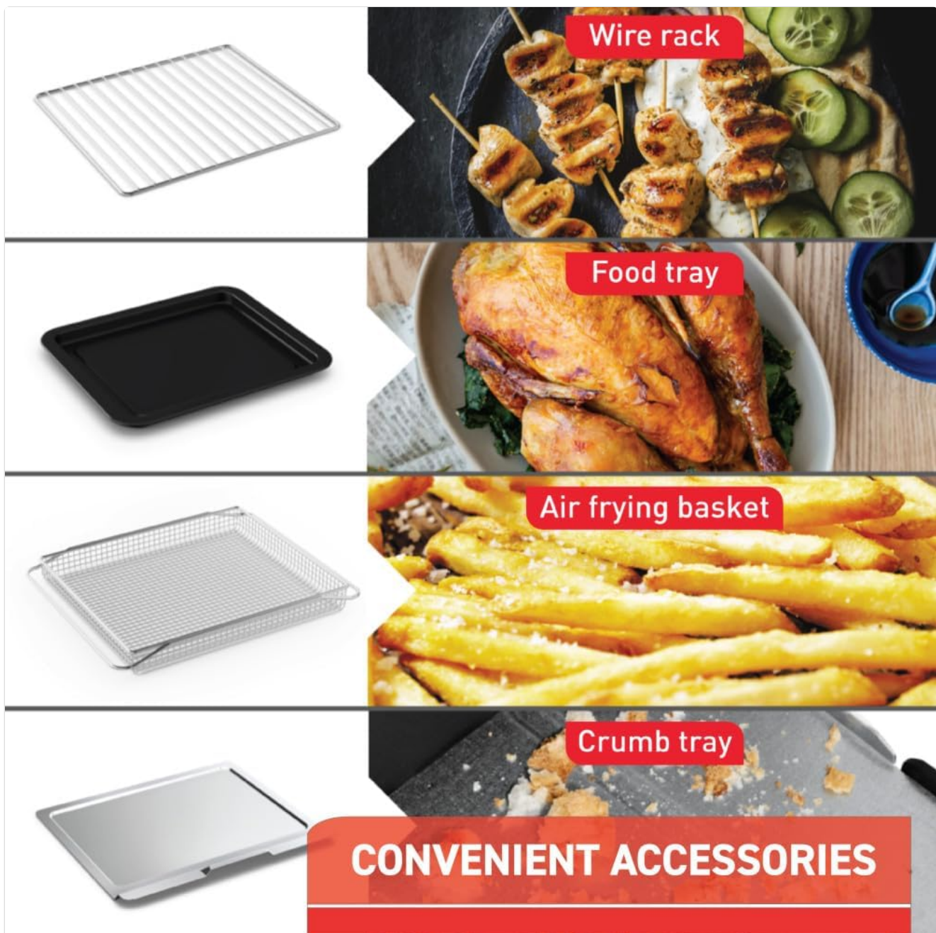
Figure 2: Included accessories: air frying basket, wire rack, food tray, and crumb tray.