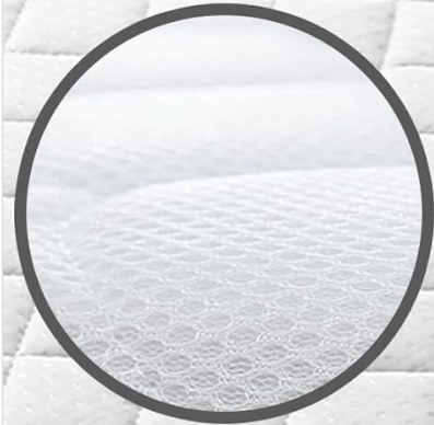
Ice Silk Fabric