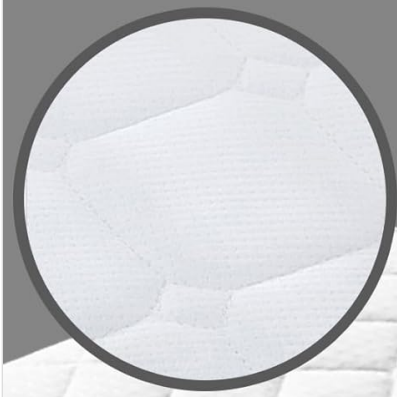
Pure Cotton Fabric

This crib mattress is made from sustainably sourced coconut fiber, breathable and hypoallergenic.