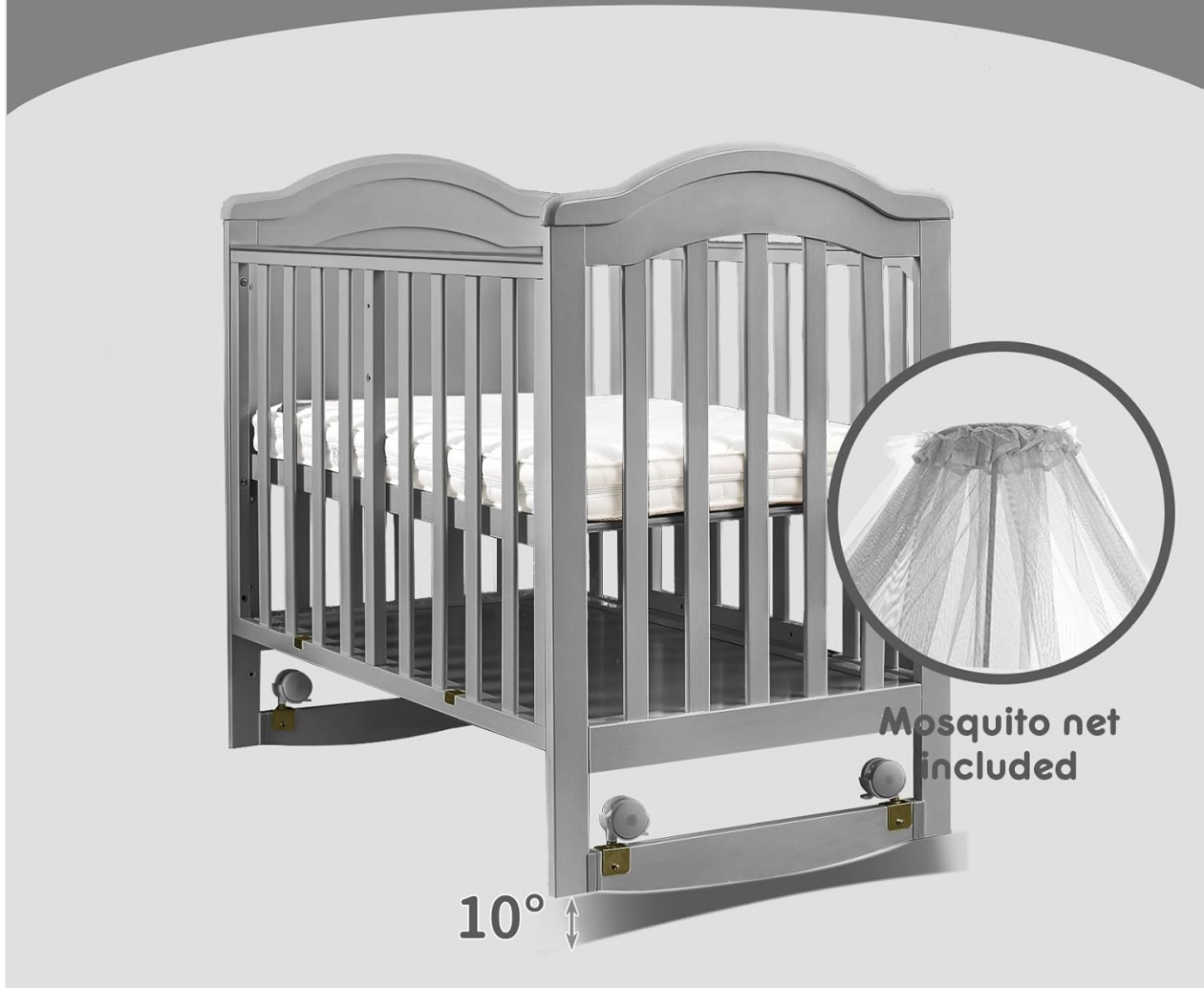
Image: The HARPPA Mini Baby Crib in cradle mode, demonstrating the rocking function and showing the included mosquito net.

Put the wheels up for cradle mode, the side-to-side rocking will help soothe your baby to a sound sleep.