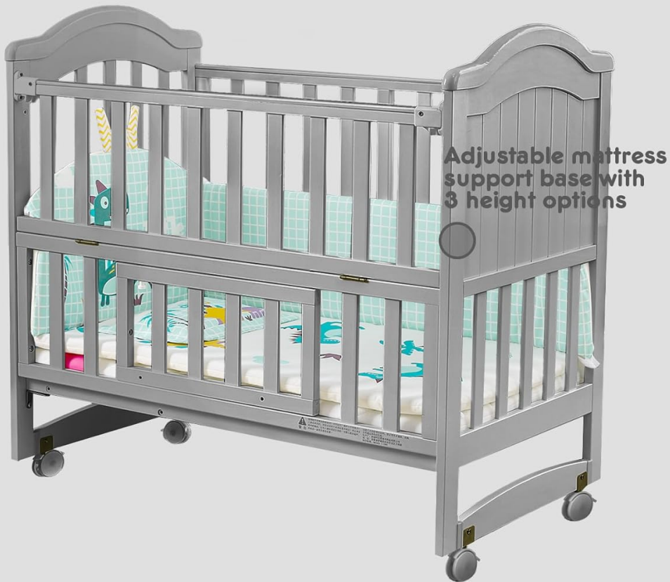
Image: The HARPPA Mini Baby Crib configured as a playpen, with the mattress base at a lower setting and showing the adjustable mattress support base with 3 height options.

Turn this crib into a playpen, it'll be a safe place to play while you work on your hefty to-do list.