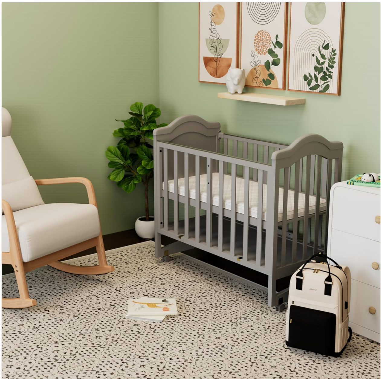
Image: The HARPPA Portable Mini Baby Crib in a nursery, showcasing its compact design and grey finish.

Assembly is required for this product. Please refer to the separate detailed Assembly Instruction booklet included in your package for step-by-step guidance. Ensure you have adequate space and the necessary tools (usually a screwdriver, not always included) before starting.