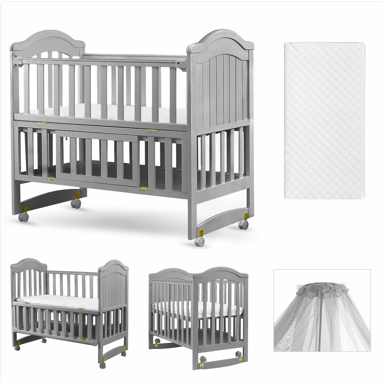
Image: A close-up view of the HARPPA Mini Baby Crib's dual-sided mattress, highlighting the Pure Cotton Fabric and Ice Silk Fabric for comfort.