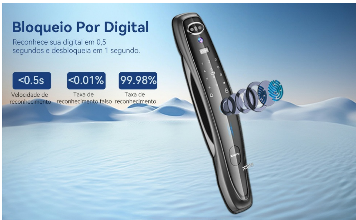
Image: Highlights the speed and accuracy of the fingerprint recognition feature, showing less than 0.5 seconds recognition time and 99.98% success rate.