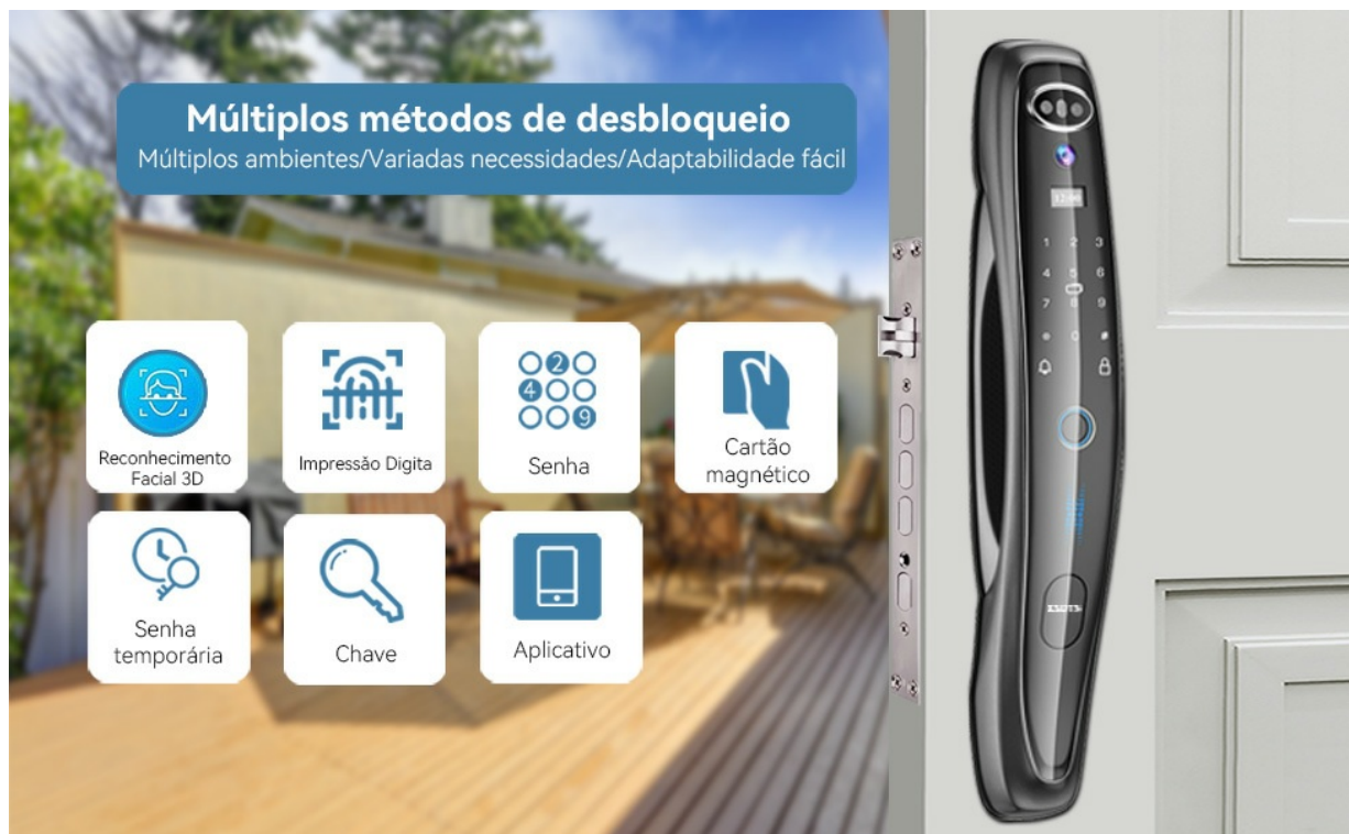
Image: Visual representation of the various unlocking methods: 3D facial recognition, fingerprint, password, smart card, mechanical key, and mobile application.