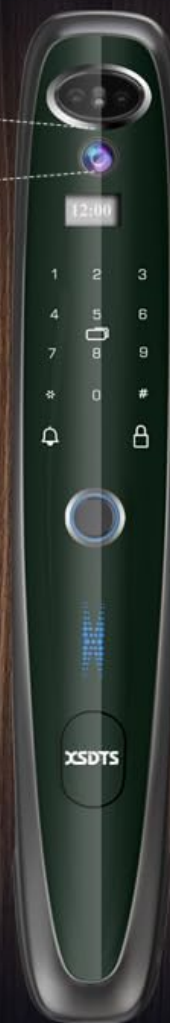
Image: Diagram illustrating the functions of the Tuya WiFi Module, including remote APP unlock, smart scene linkage, doorbell message promotion, and door unlock record viewing.