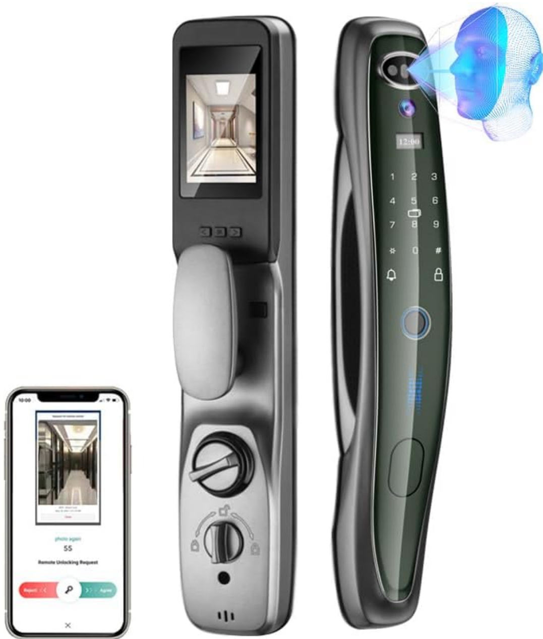
Image: The smart lock displaying its 3D facial recognition capability and the mobile app interface for remote unlocking requests.