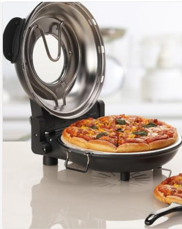
Image 3.1: A Sommertal pizza stone placed inside a pizza oven, ready for baking, with a freshly cooked pizza shown.