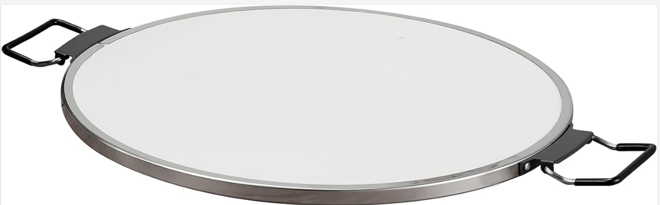
Image 1.1: The Sommertal 39cm Cordierite Pizza Stone, a round baking stone with a smooth surface, designed for high-temperature cooking.

Thank you for choosing the Sommertal 39cm Cordierite Pizza Stone. This instruction manual provides essential information for the safe and effective use of your new pizza stone. Designed for perfect integration with Sommertal pizza ovens, this high-quality cordierite stone ensures even heat distribution and a crispy crust for your pizzas, bread, and other baked goods.