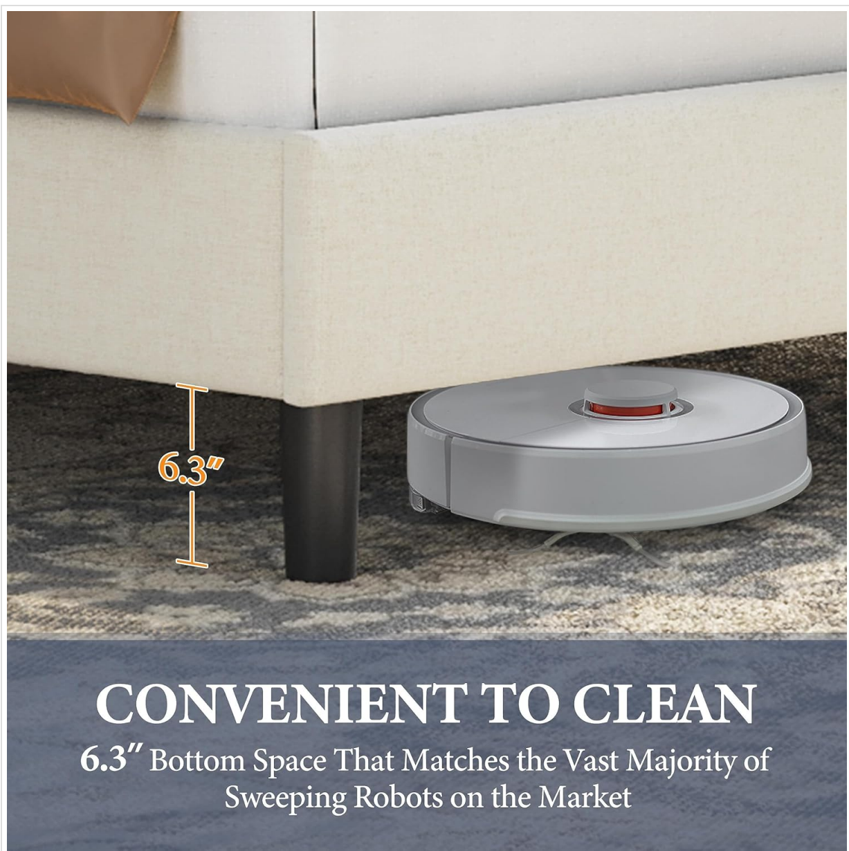
Image: A robot vacuum cleaner operating beneath the bed frame, demonstrating the convenient 6.3-inch underbed clearance for cleaning.