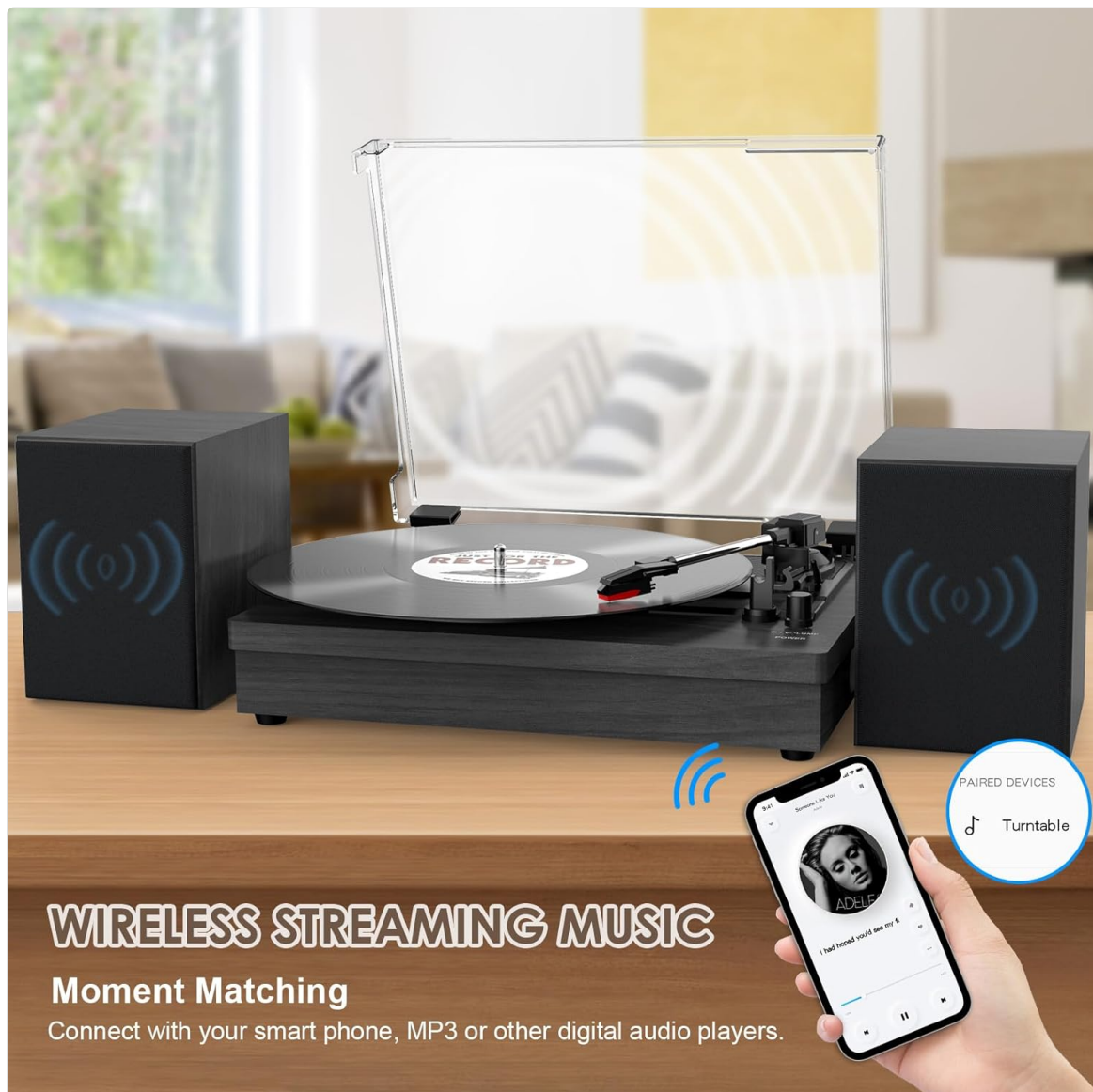
Figure 4: The record player demonstrating wireless music streaming from a smartphone.

This image shows the record player with its speakers, and a hand holding a smartphone displaying a music playback interface. Wireless signals are depicted emanating from the phone to the speakers, illustrating the Bluetooth streaming functionality of the device.