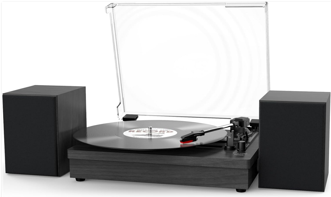
Figure 2: The WOCKODER R612 Record Player with its two external speakers, ready for setup.

This image shows the main record player unit with a vinyl record on the platter, and two separate black stereo speakers positioned on either side. The clear dust cover is open, revealing the tonearm and stylus. This illustrates the typical setup configuration.