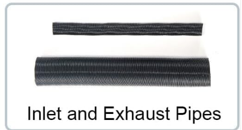
Inlet and Exhaust Pipes