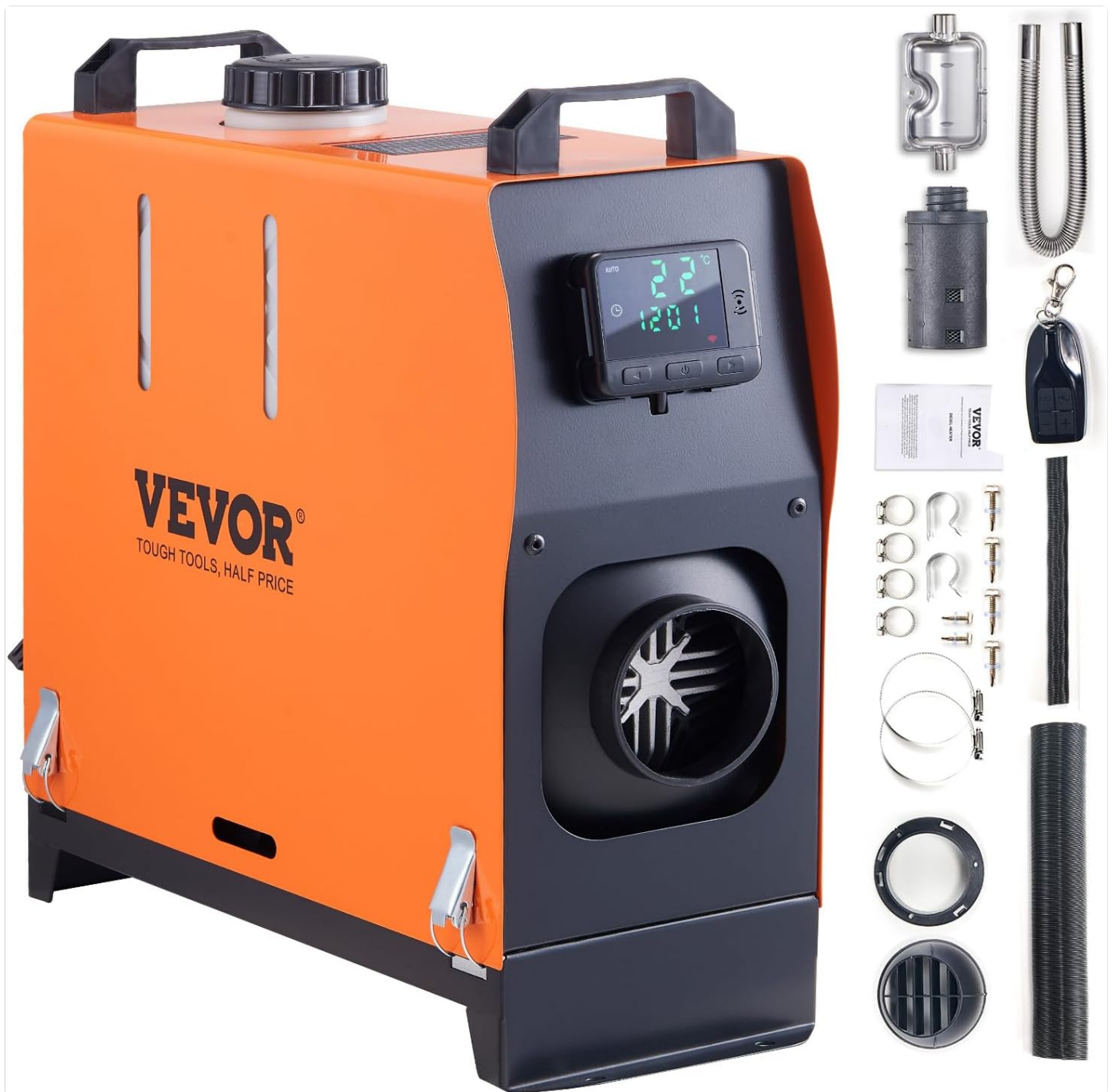
Figure 1: VEVOR 5KW Diesel Heater All in One and its components.