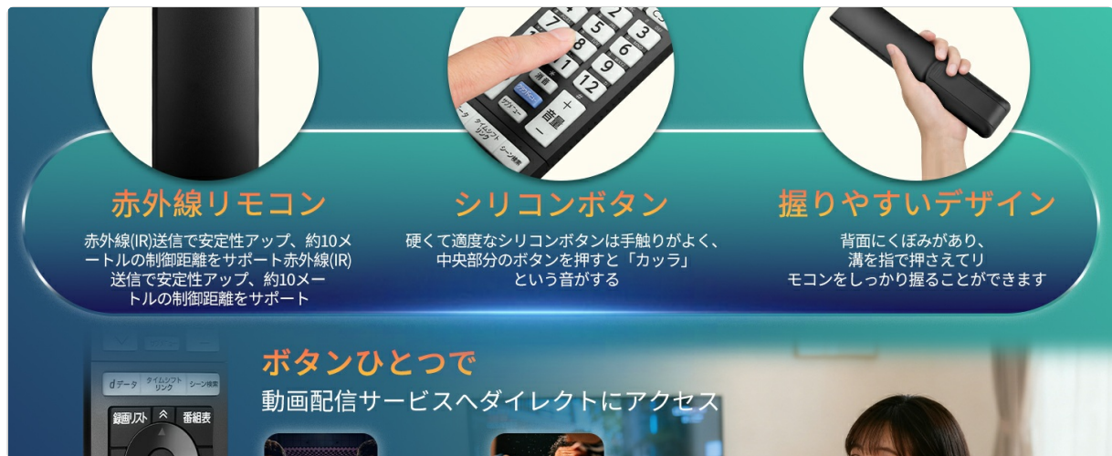
Image: Key features of the OMAIC remote control, highlighting infrared operation, comfortable silicone buttons, and an ergonomic design for easy grip.