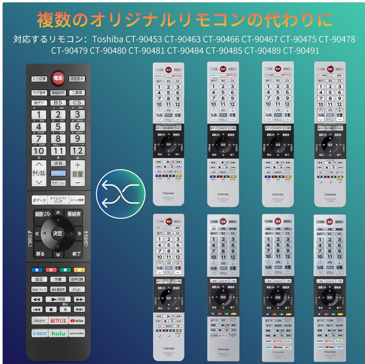
Image: The OMAIC remote shown alongside several original Toshiba REGZA remote controls it is designed to replace, illustrating its broad compatibility.