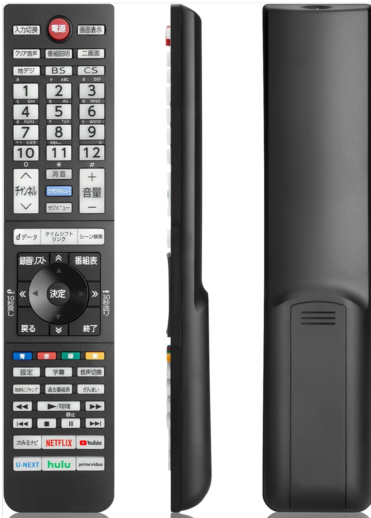
Image: Front, side, and back views of the OMAIC OM479B replacement remote control.