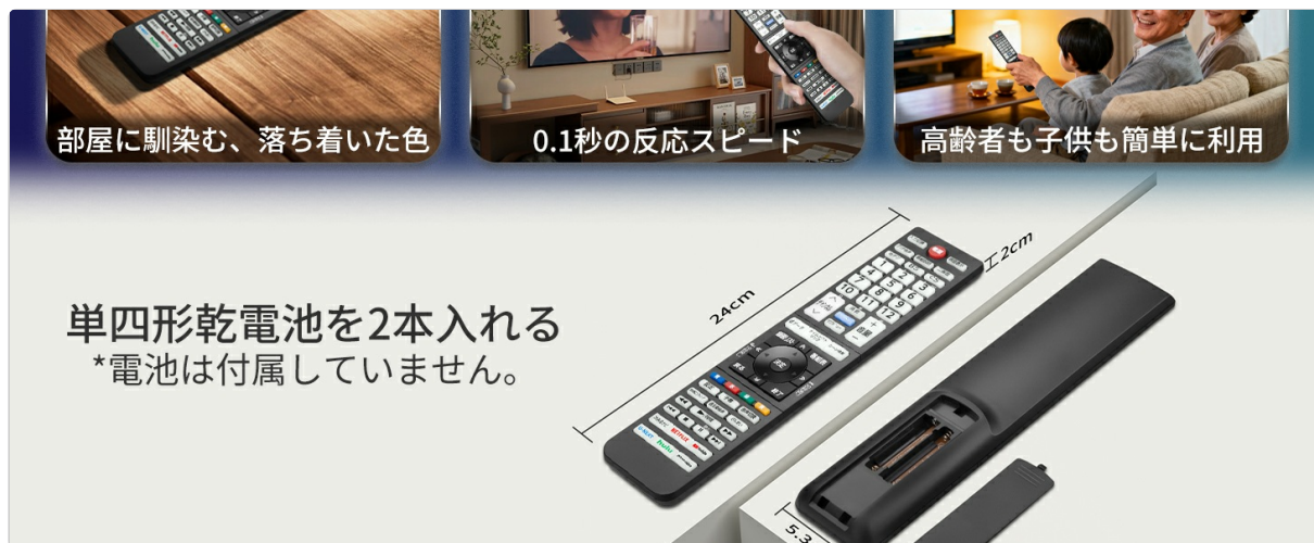
Image: A diagram illustrating the battery compartment and the correct orientation for inserting two AAA batteries into the OMAIC remote control.