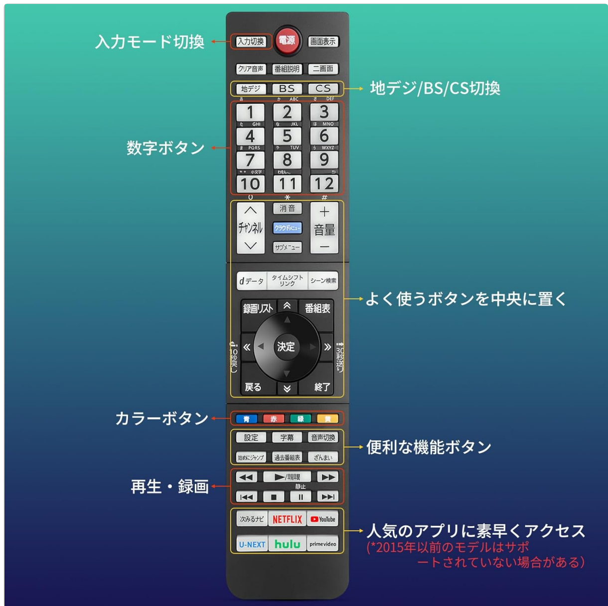
Image: A detailed view of the OMAIC remote control's button layout, indicating functions such as input switching, channel/volume controls, navigation, and dedicated streaming service buttons.