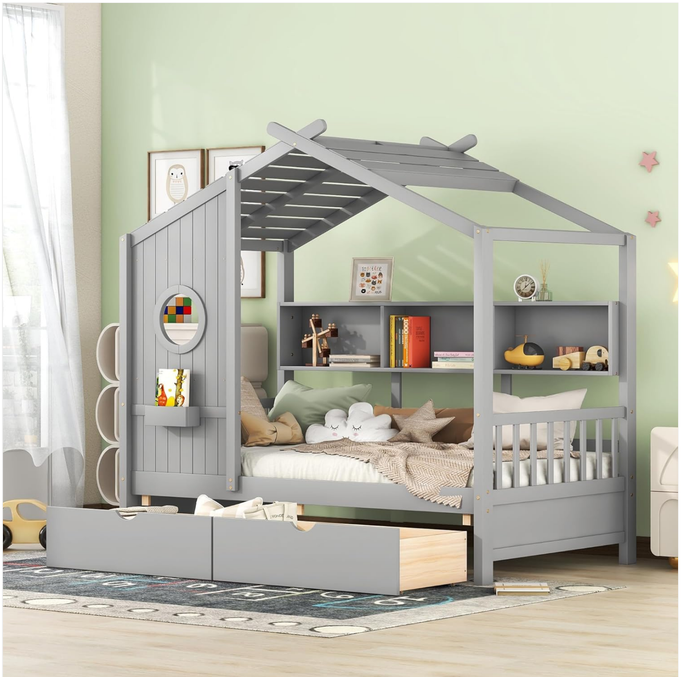
Image: Fully assembled Linique Twin Size Wooden House Bed in grey, featuring a pitched roof, integrated shelving, and two pull-out storage drawers.