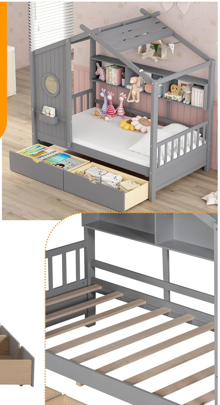
Image: Detailed view of the bed's sturdy construction, highlighting the wooden slats for mattress support and the pull-out drawers.