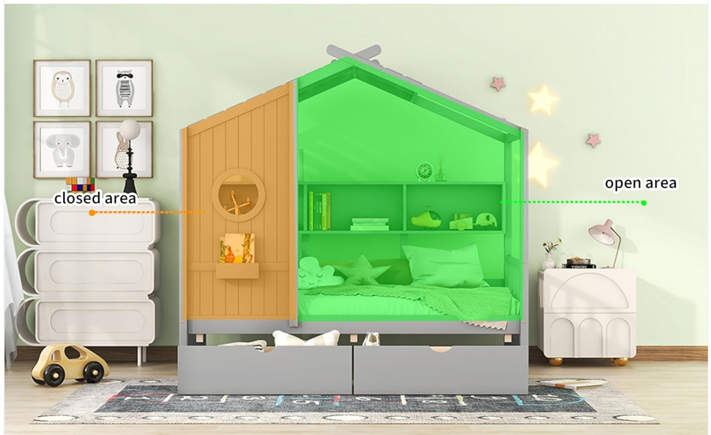
Image: Illustration showing the semi-enclosed sleeping area of the house bed, highlighting the distinction between closed and open sections for comfort and air circulation.

Thanks to the semi-enclosed space, your kids will have their own sleeping space that affords a comforting atmosphere for better sleep while not sacrificing air circulation