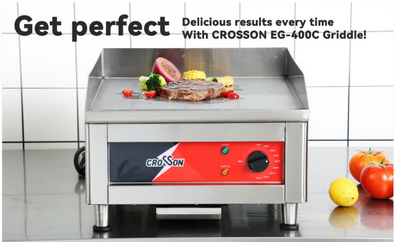
Image 3: The griddle cooking various foods, demonstrating the even heat distribution across the cooking surface.

Plug the griddle into a grounded 120V/1750W outlet. Turn the temperature control knob to your desired cooking temperature, ranging from 190°F to 575°F. The 'Heating' indicator light will illuminate. Allow the griddle to preheat for approximately 10-15 minutes until the indicator light turns off, signaling that the set temperature has been reached. The 2/5" thick iron cooking plate ensures even and consistent heat distribution.