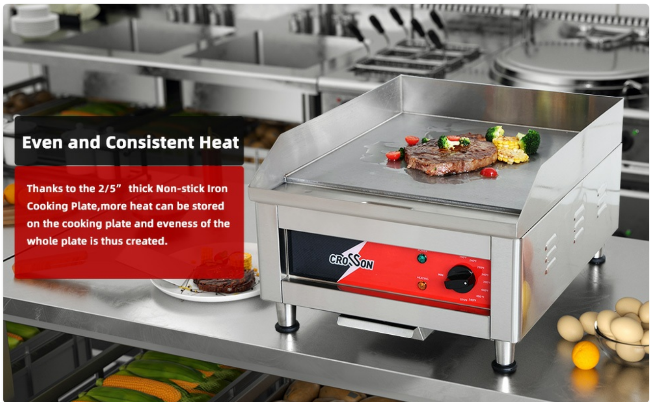
Image 5: The griddle is suitable for cooking a variety of items including steaks, burgers, pancakes, grilled cheese, and scrambled eggs.