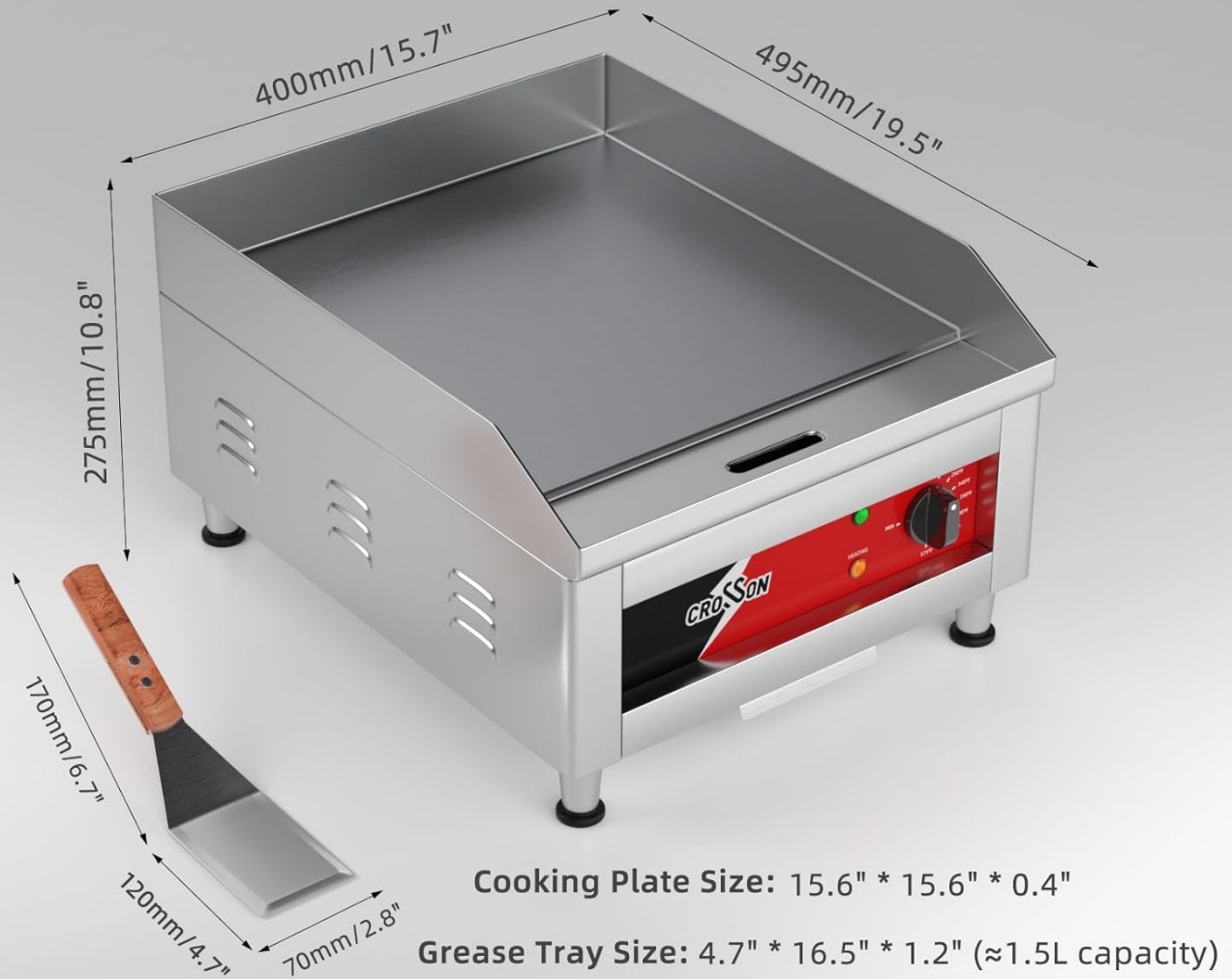
Image 6: Dimensional diagram of the griddle, including cooking plate size and grease tray size.