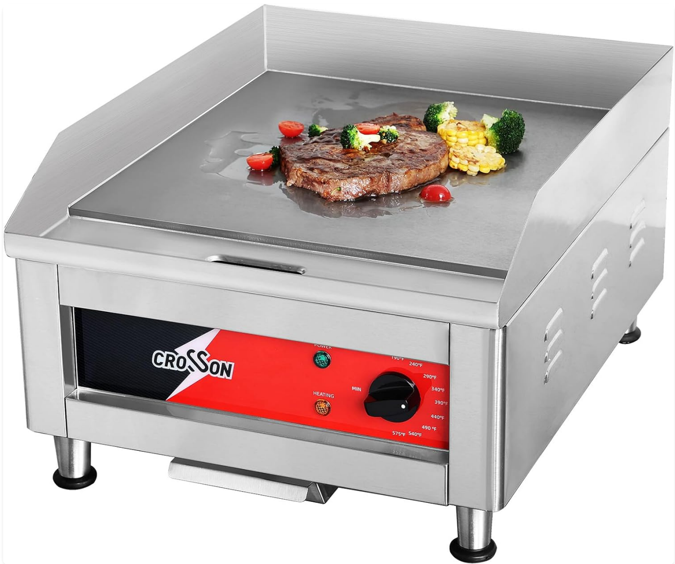
Image 1: The CROSSON EG-400C Electric Countertop Griddle, a stainless steel unit with a flat cooking surface and control panel.