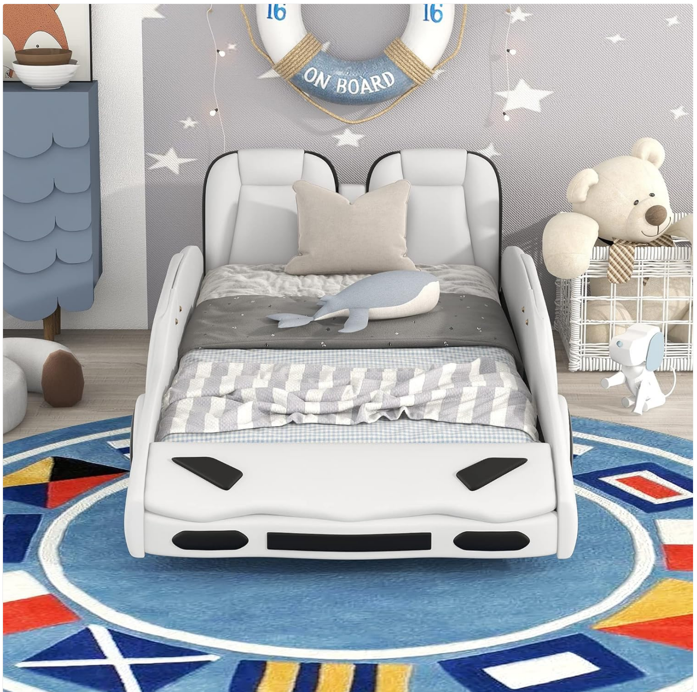
Image 5.1: Front view of the assembled bed. This image highlights the distinctive front bumper and headlight design, contributing to the race car appearance.