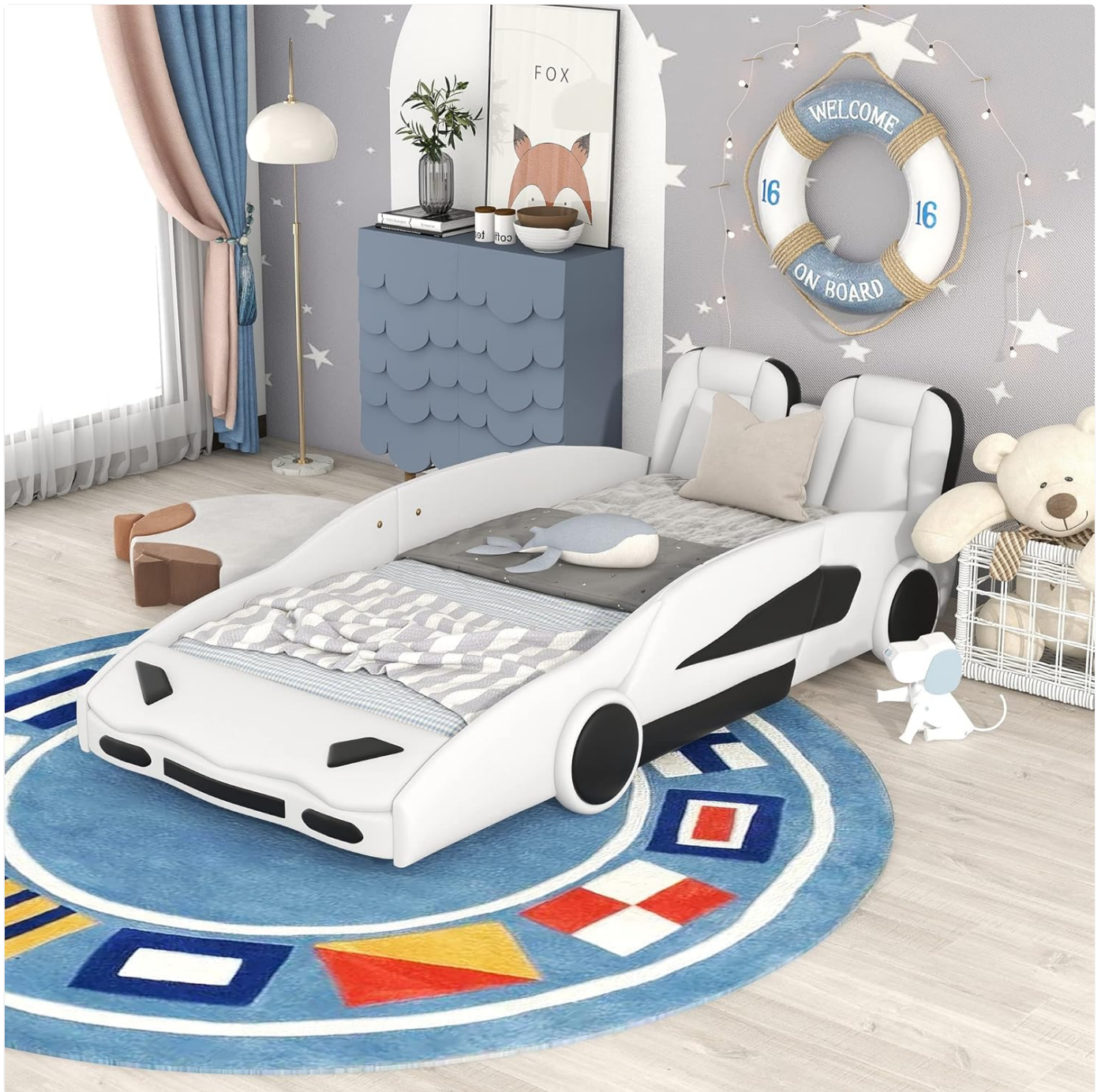
Image 1.1: Overview of the FridayParts Twin Size Race Car-Shaped Platform Bed in White. This image shows the full bed setup in a room, highlighting its distinctive race car design with white and black accents, and integrated wheels.