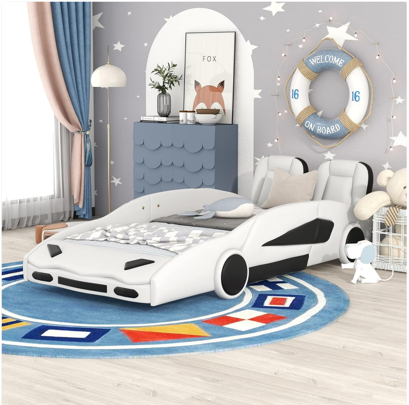
Image 8.1: Side profile of the assembled bed, showcasing the sleek race car body and integrated wheels. This view emphasizes the overall design and proportions.