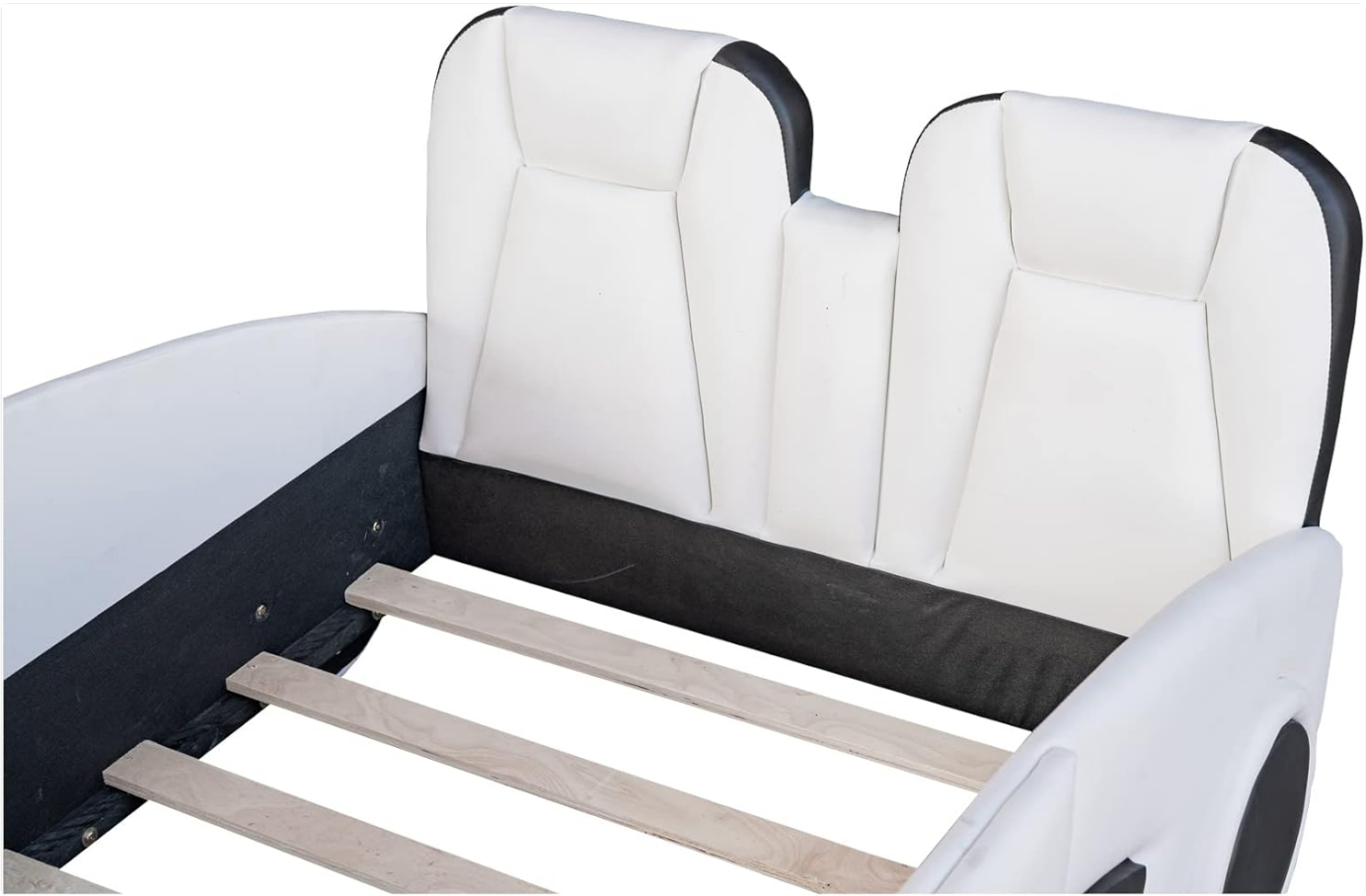
Image 6.1: Close-up view of the bed's interior, showing the headrest design and wooden slats. This image helps in understanding the internal structure and how the mattress is supported.