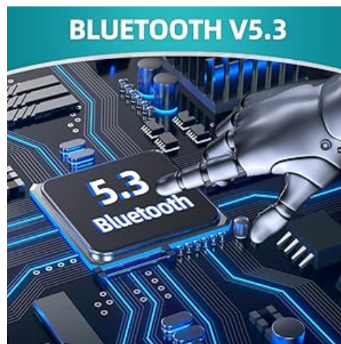
Image: Illustration of Bluetooth 5.3 technology, emphasizing fast and stable connection.