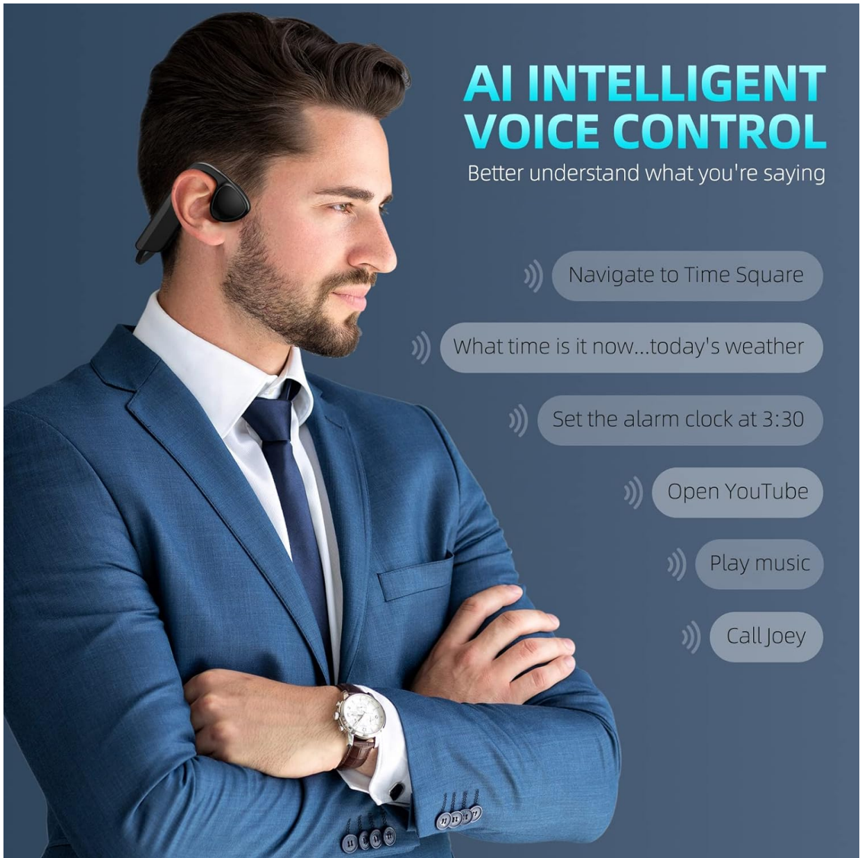
Image: CHENSIVE Bone Conduction Headphones highlighting ergonomic design and comfort.

This manual provides detailed instructions on how to set up, operate, and maintain your CHENSIVE X19 Pro headphones to ensure optimal performance and longevity.