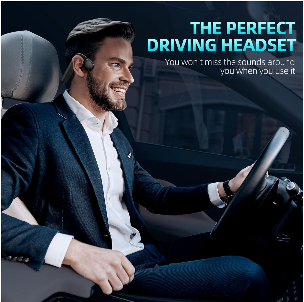
Image: Man driving, illustrating the headphones as a suitable driving headset.