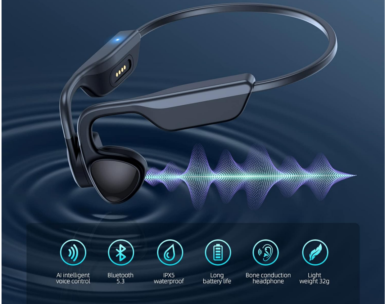
Image: Headphones with visual representation of sound waves, emphasizing high-quality audio output.

Built in high quality HIFI allows you to enjoy the pleasure of music