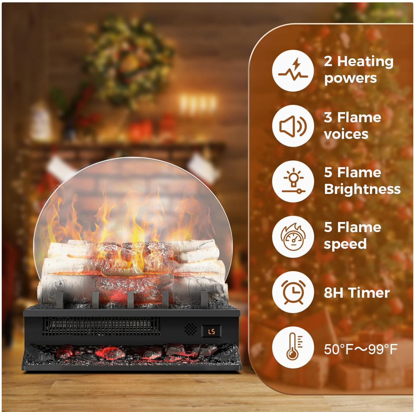
Figure 1: Overview of product features including heating powers, flame settings, and timer.