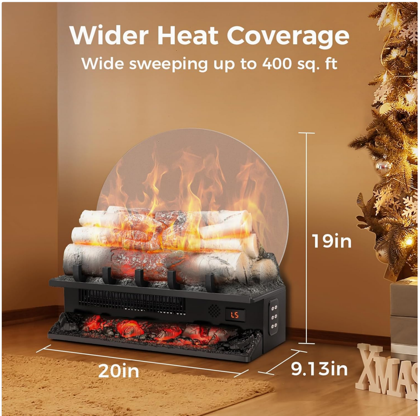
Figure 2: Product dimensions and heat coverage area for optimal placement.