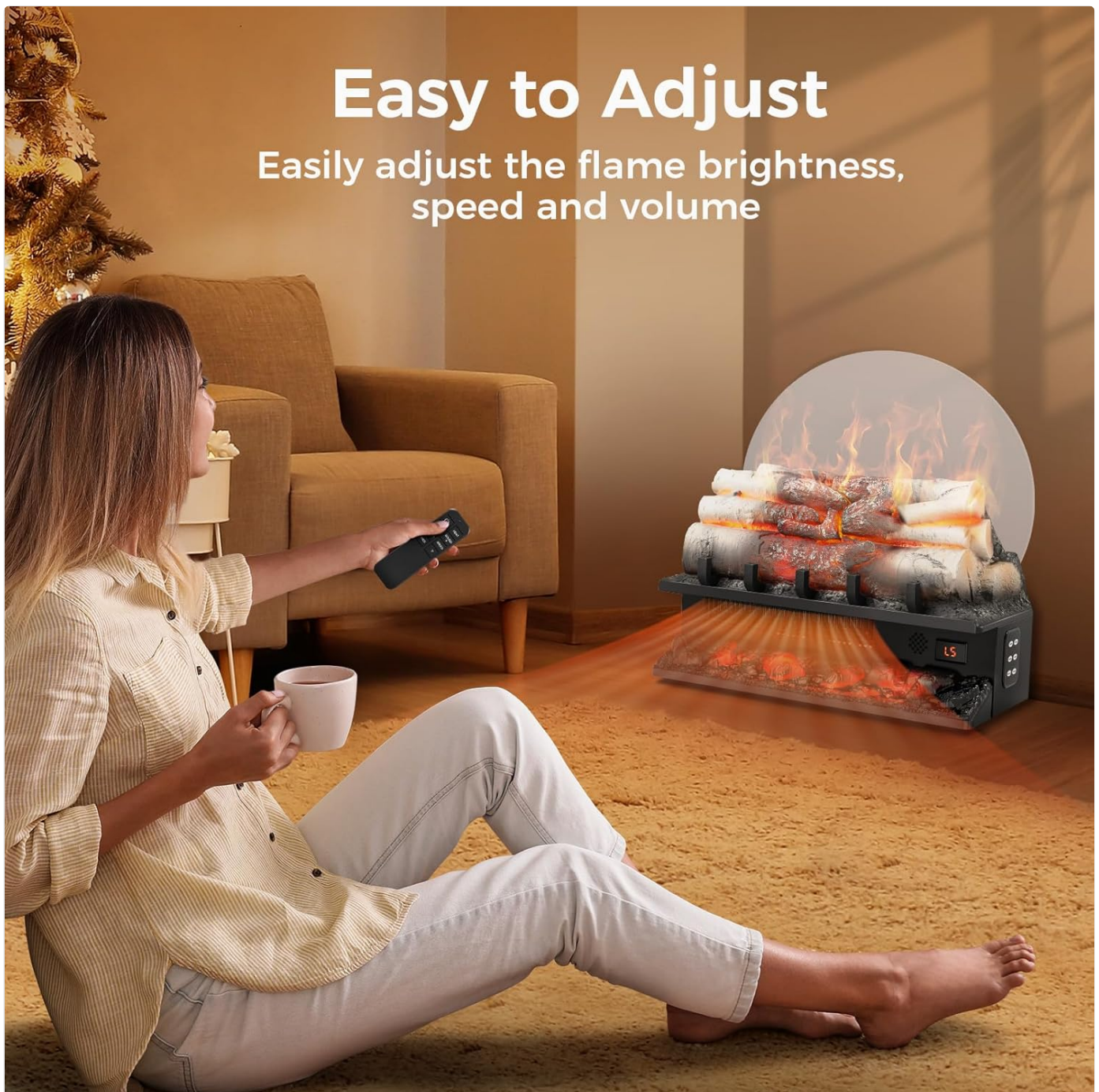
Figure 7: Convenient remote control operation.