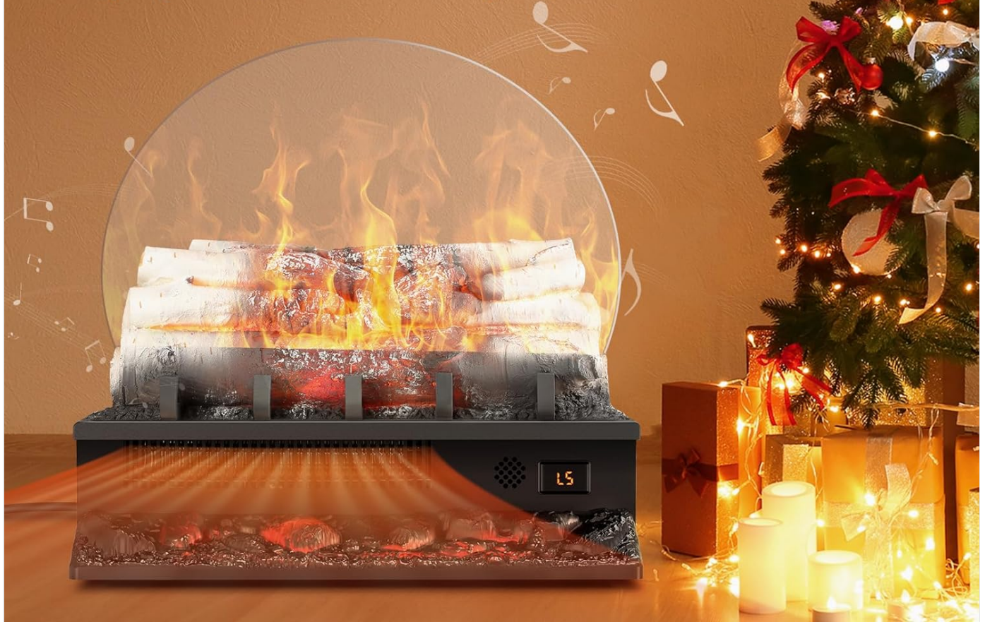
Figure 6: Three different flame sounds available for selection.