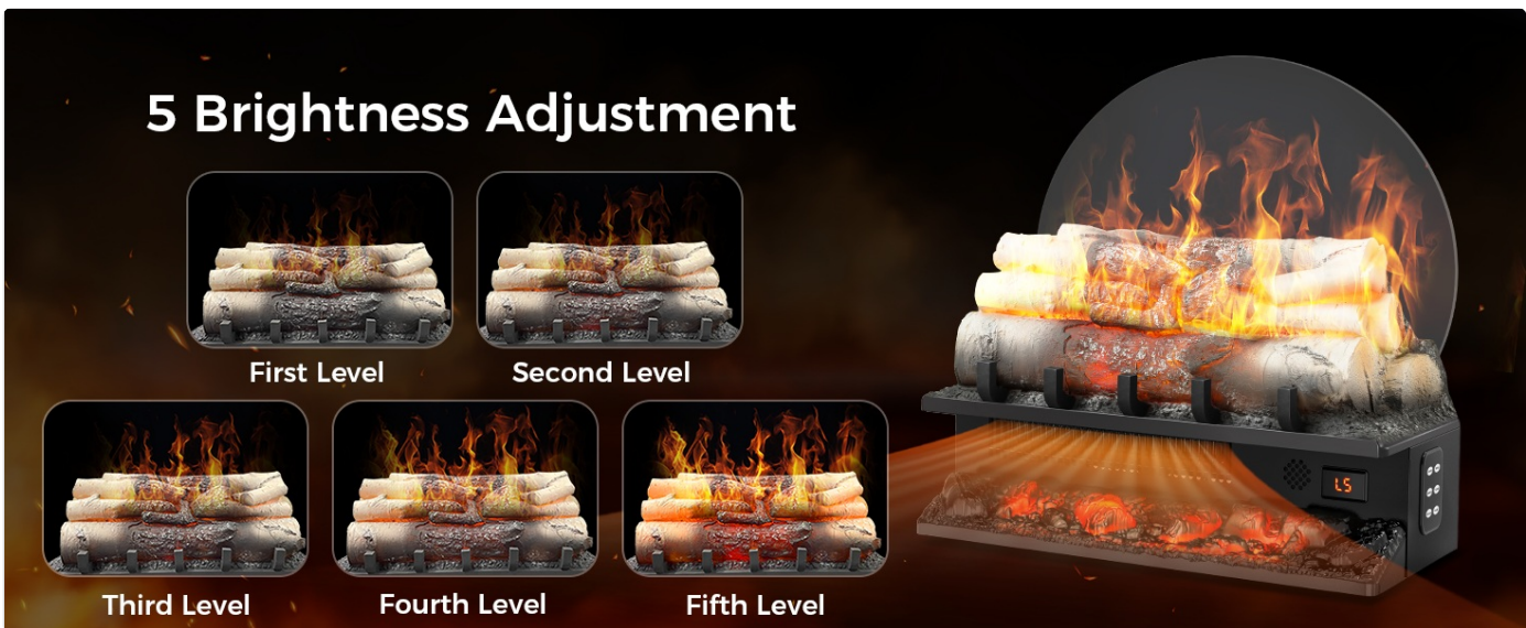
Figure 5: Visual representation of 5-level flame brightness adjustment.