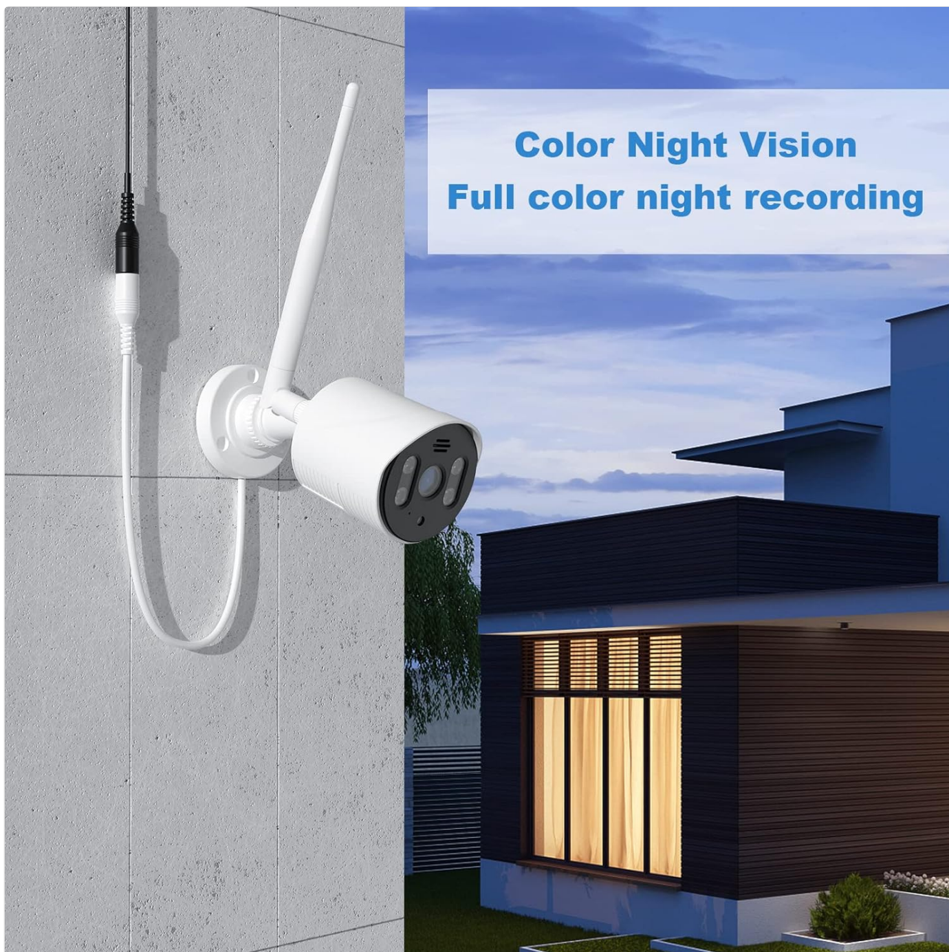
Figure 4: Camera mounting and antenna connection.