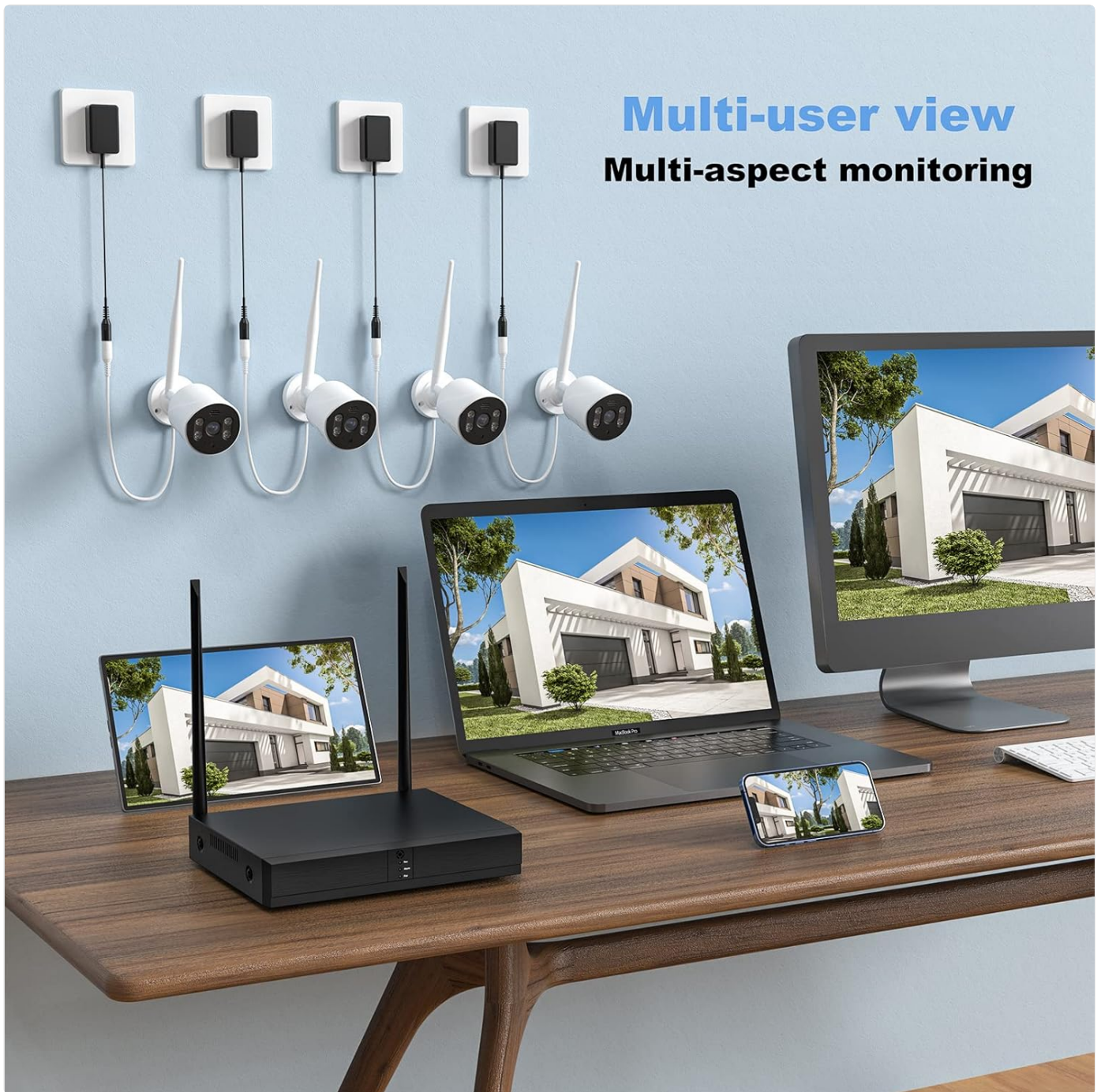
Figure 1: All components included in the NUFEB Security Camera System package.