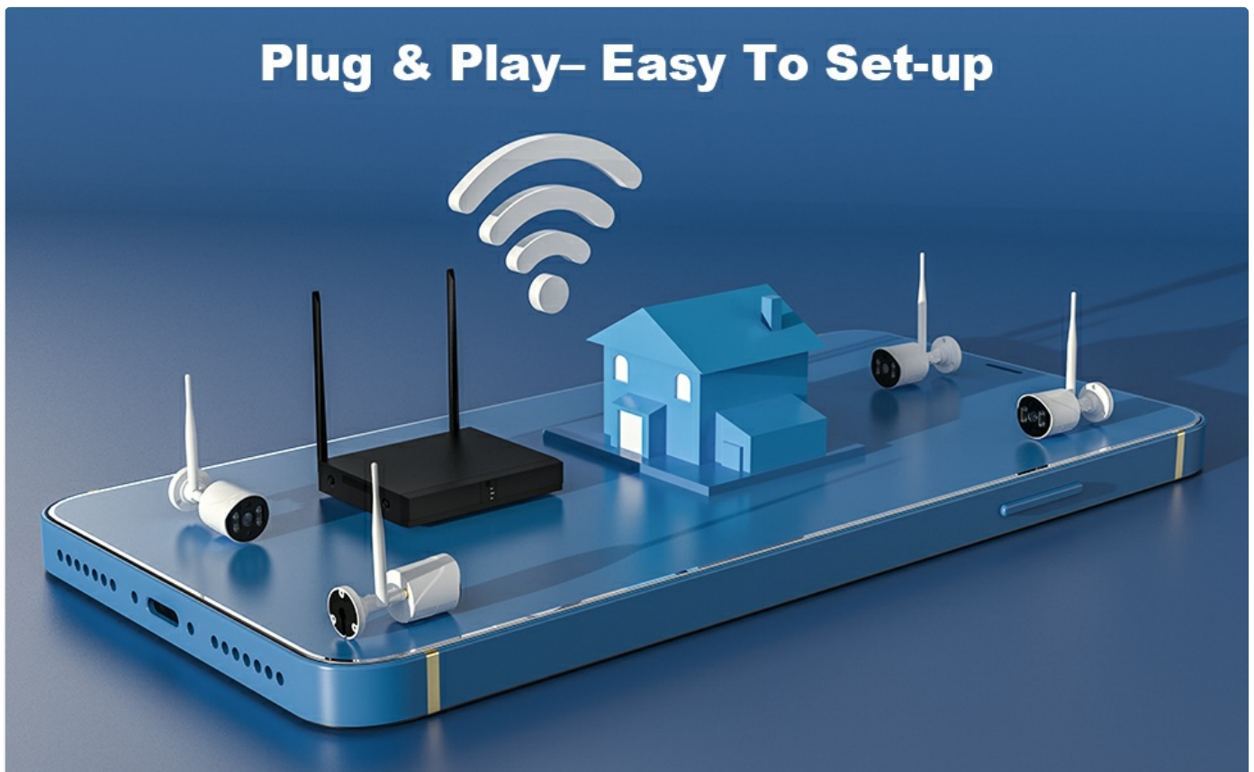
Figure 5: Mobile app interface for remote monitoring.