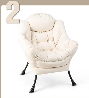
2 Mettre la housse