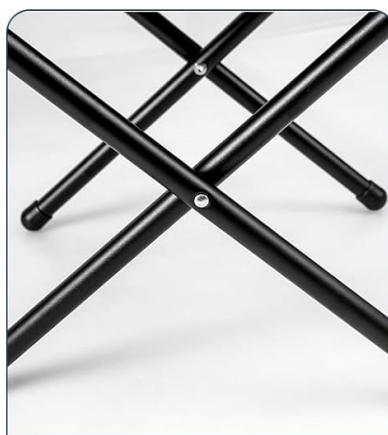
Structure robuste en forme de X