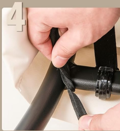
4 Attacher les sangles