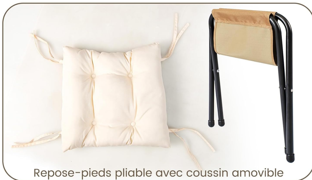
Repose-pieds pliable avec coussin amovible