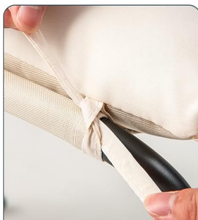
Sangles haute résistance et longue durée