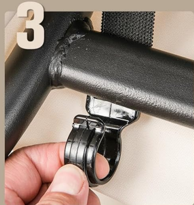
3 Attacher la boucle