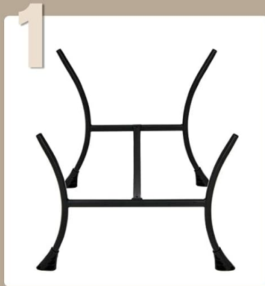
1 Connecter les tubes de support