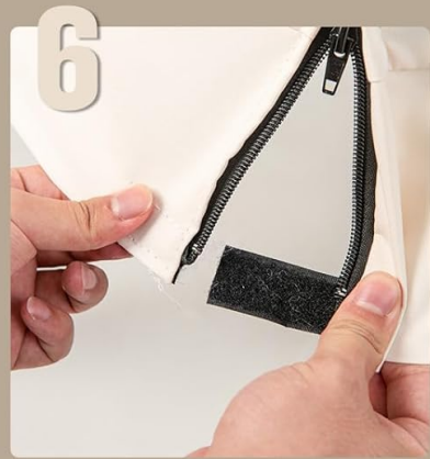
6 Fixer à l'aide des fermetures velcro

Step-by-step assembly guide for the COSTWAY lounge chair, showing how to connect support tubes, attach the cover, secure buckles, fasten straps, close zippers, and fix velcro.