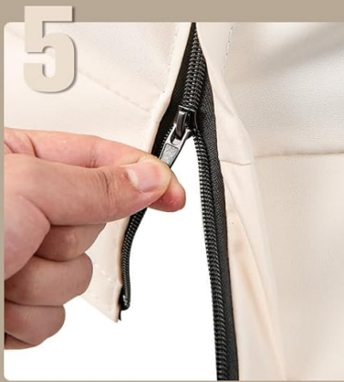
5 Fermer la fermeture éclair