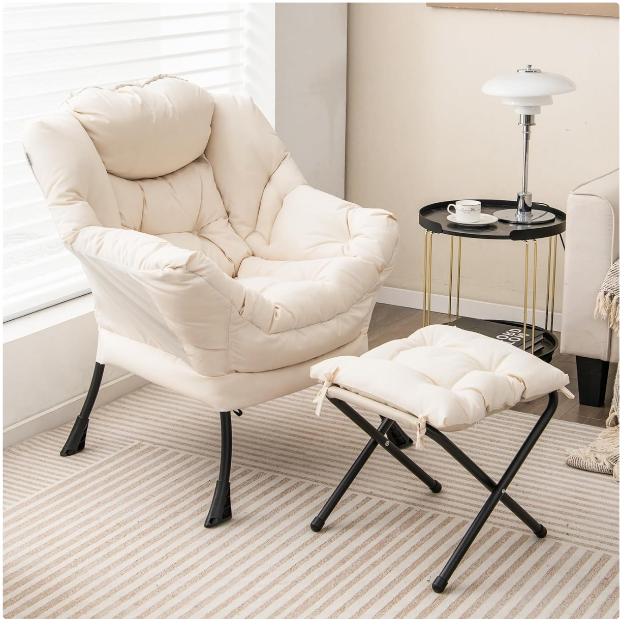
The COSTWAY lounge chair and ottoman in a modern living room setting, demonstrating its aesthetic appeal and comfortable design.