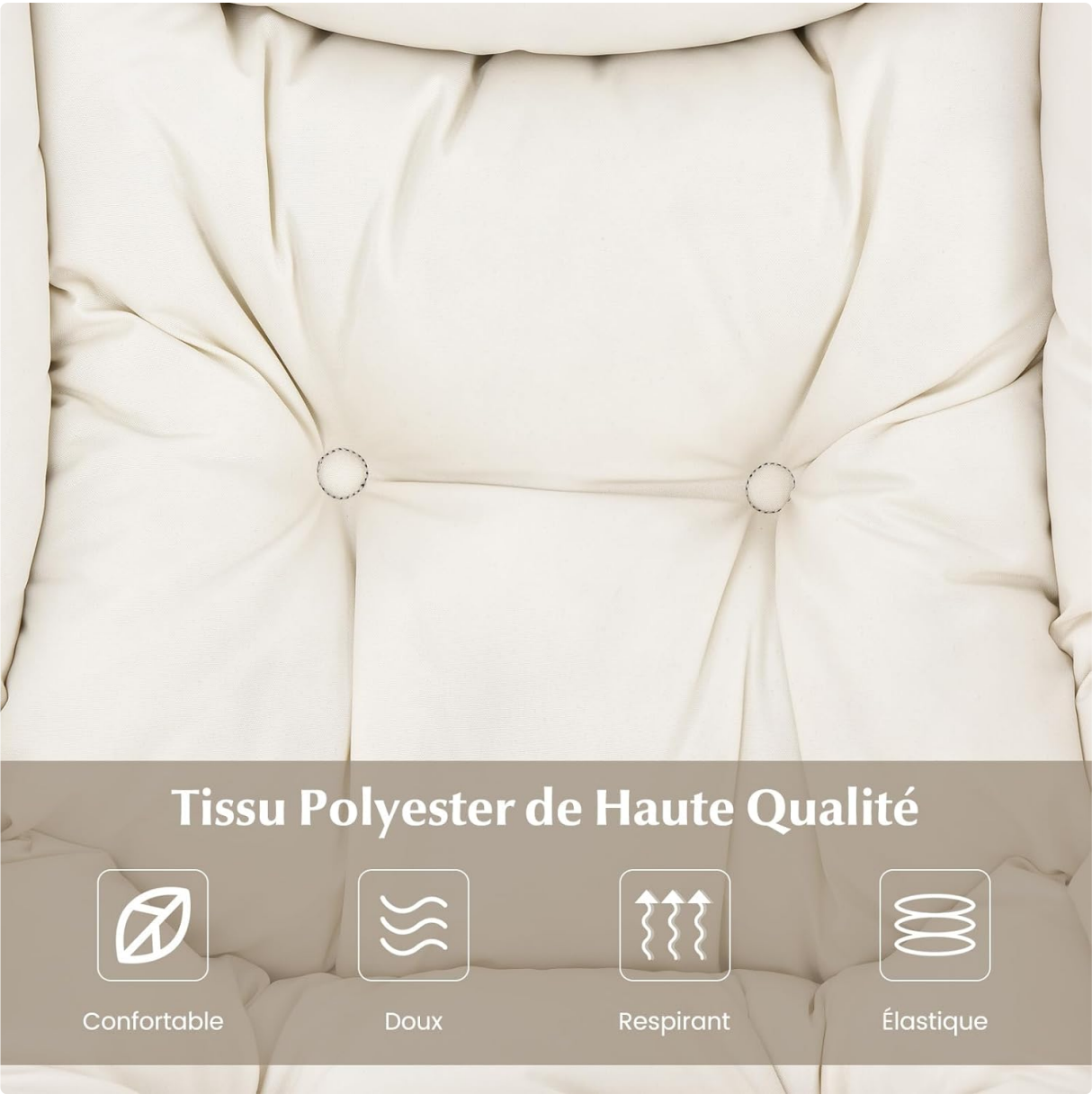
Close-up view of the high-quality polyester fabric of the COSTWAY lounge chair, illustrating its comfortable, soft, breathable, and elastic properties.