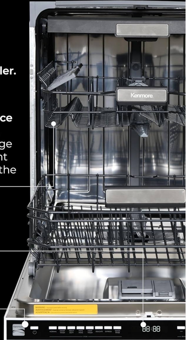
Figure 3: Interior design highlighting adjustable racks and user-friendly controls.