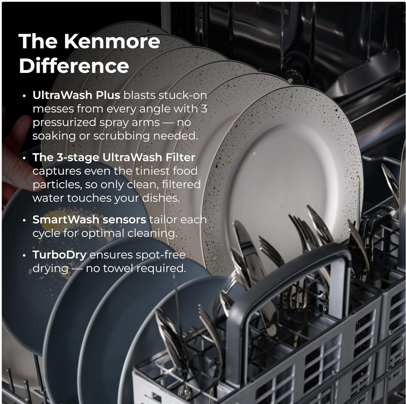
Figure 2: Illustration of Kenmore dishwasher's advanced cleaning and drying technologies.