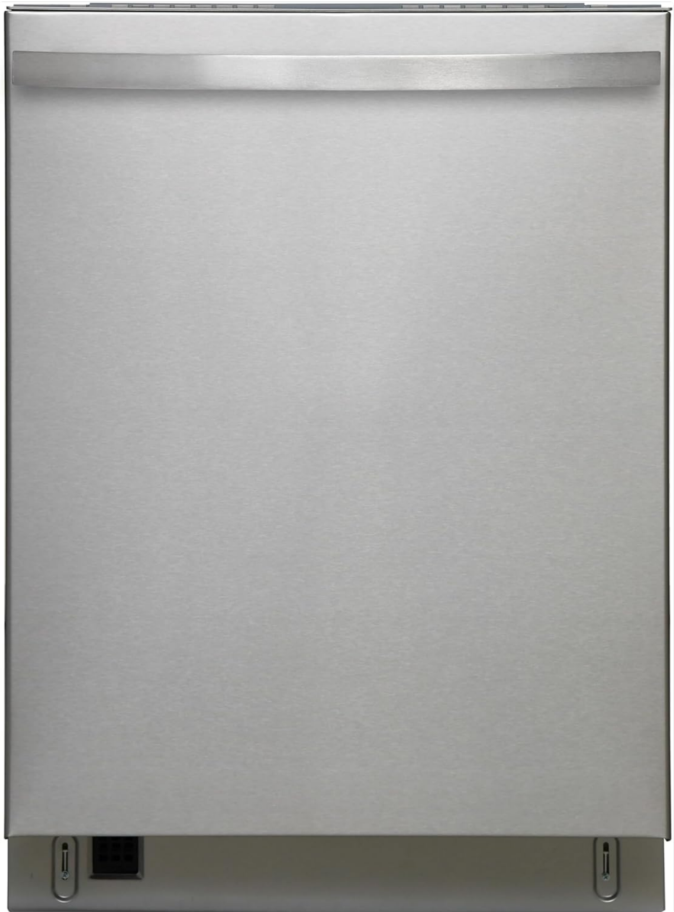
Figure 1: Front view of the Kenmore 24-inch Built-In Dishwasher in fingerprint resistant stainless steel.