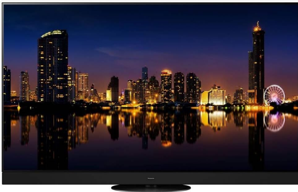
Image 1: Front view of the Panasonic TX-55MZ1500E 55-inch 4K OLED TV, showcasing its display quality with a night city scene.

Thank you for purchasing the Panasonic TX-55MZ1500E 55-inch 4K OLED TV. This television combines advanced OLED display technology with smart features and high-performance processing to deliver an exceptional viewing and gaming experience. This manual provides essential information for setting up, operating, and maintaining your new television. Please read it thoroughly before use and retain it for future reference.