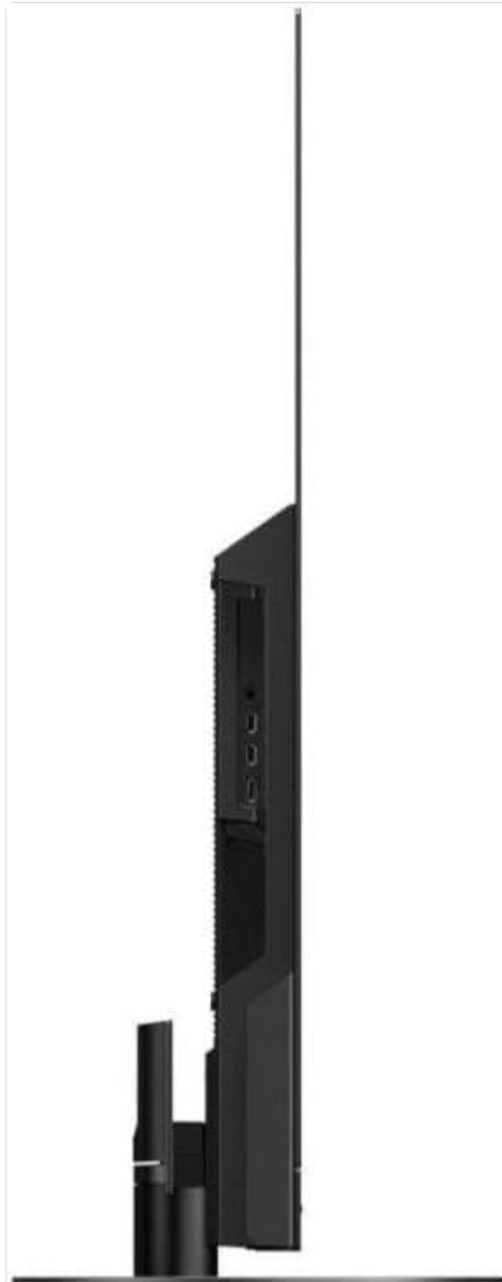
Image 2: Side profile of the Panasonic TX-55MZ1500E, highlighting the slim design and accessible input ports.

The TX-55MZ1500E offers various connectivity options. Refer to the side view image for port locations.