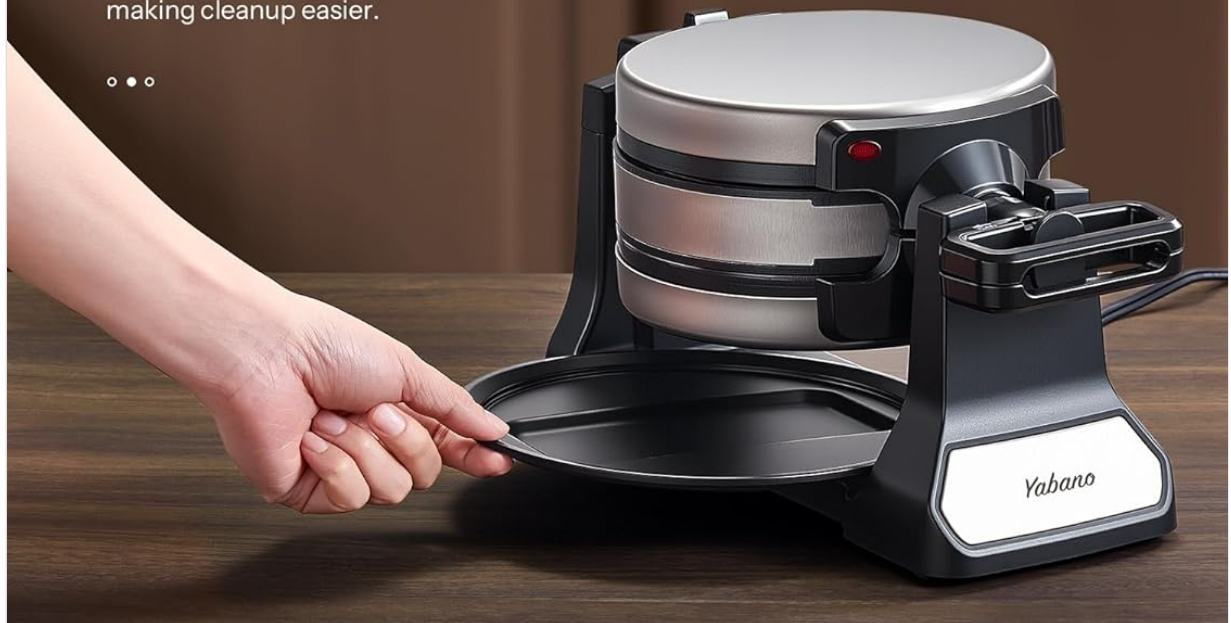
Image 5.1: Indicator lights show when the waffle maker is preheating (red) and ready to cook (green).