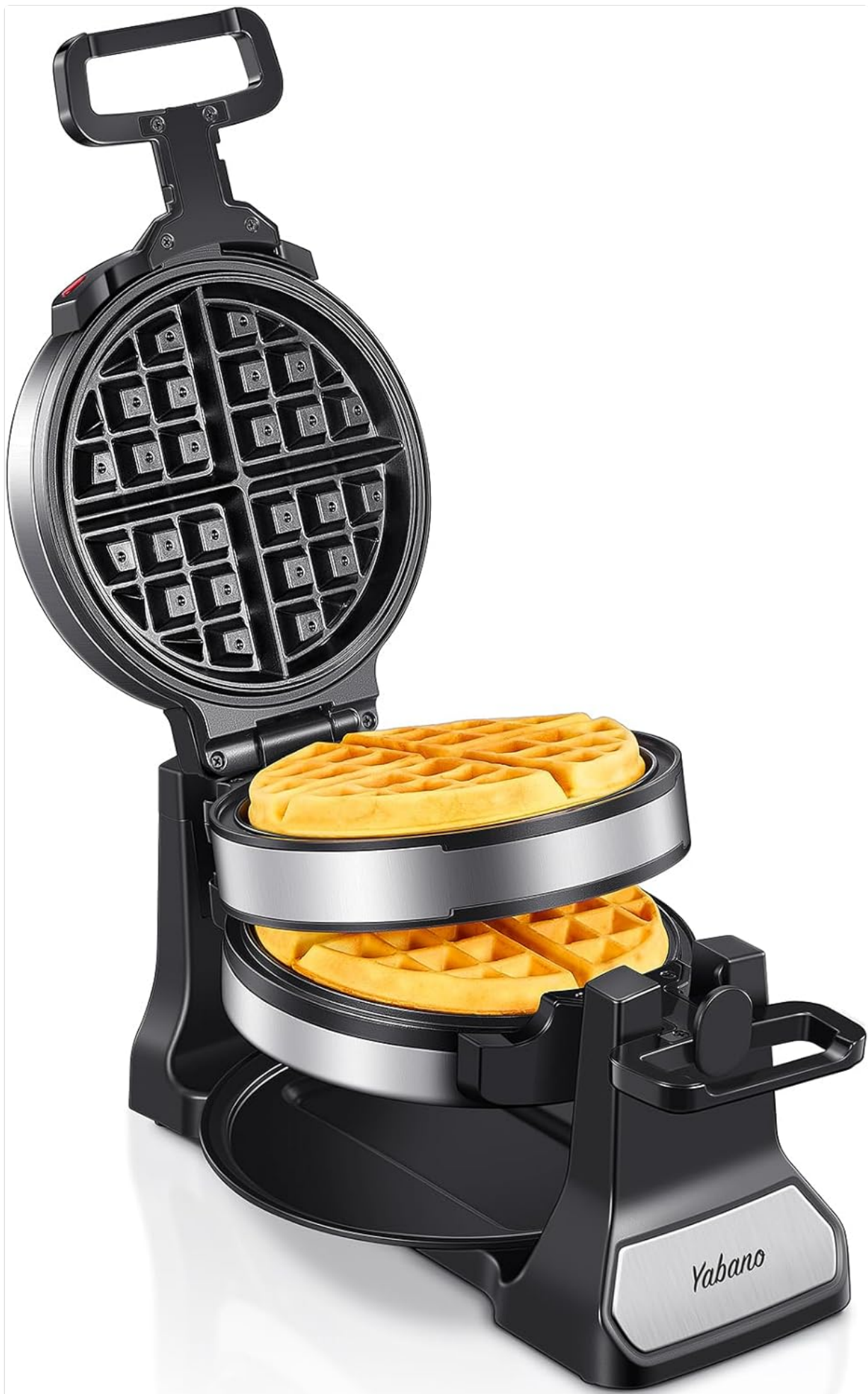
Image 3.1: The Yabano SW2090B Belgian Waffle Maker, showing its dual waffle plates and rotating design.