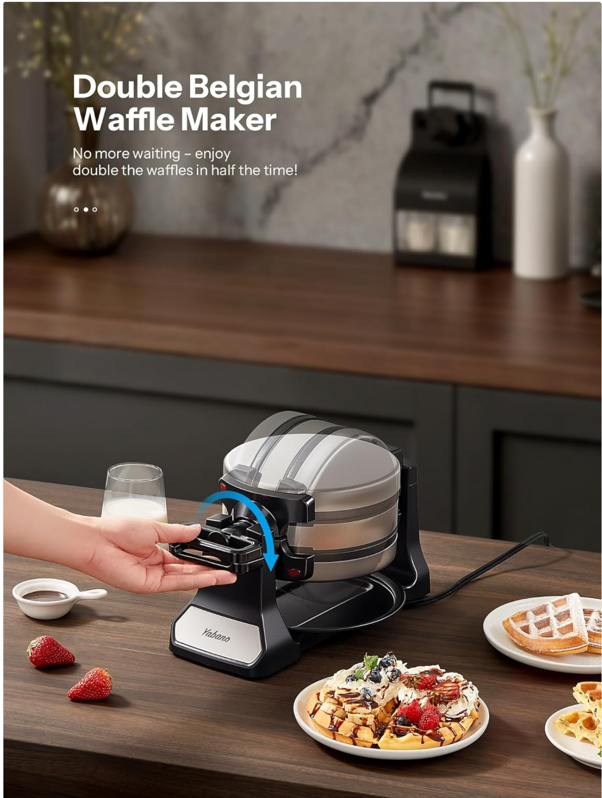
Image 5.2: The rotating mechanism ensures even batter distribution and cooking.

Your browser does not support the video tag.